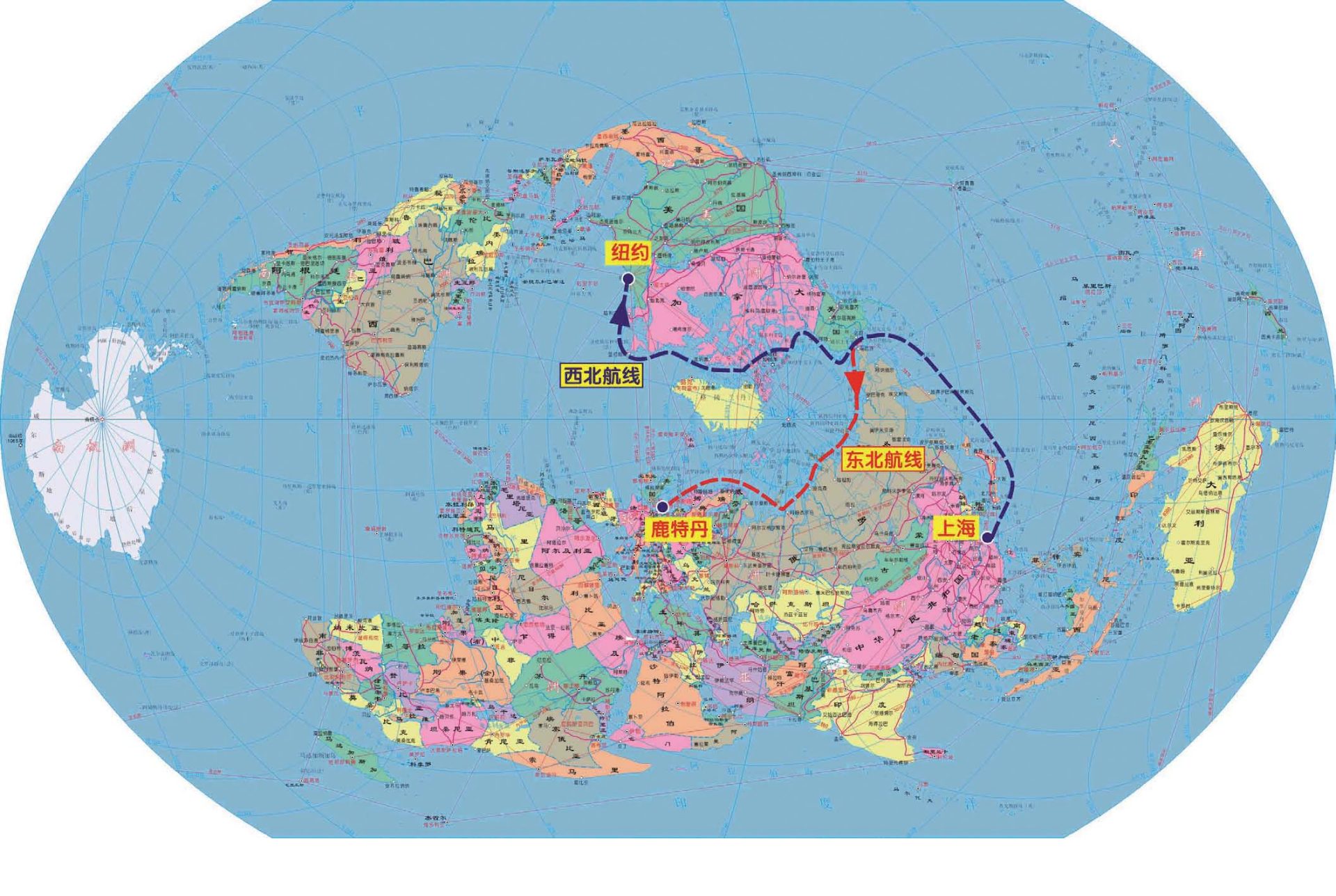
China's Perception of Future Arctic Sea Routes