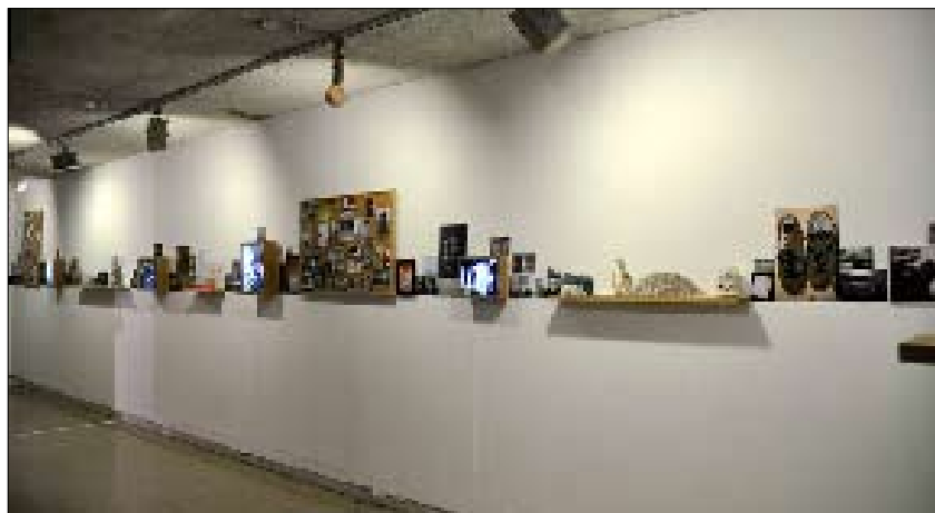
Subject/Object . Installation by MM Yu. 2009 13 Artists exhibition. Cultural Center of the Philippines.

Perhaps most importantly, however, is how this exhibition is transformative in terms of the possibilities it presents for Philippine art. These works are works that incite bravery—bravery to actively participate in the discourse that contributes to the progression and development of art. Circumstances may not have changed completely, nor have spatial boundaries been completely traversed, but the work presented here may be the beginning of a true metamorphosis. By challenging current boundaries through the engagement of method, context, space, perception and interpretation, the exhibit invites us to take a risk, and step into a brave new world.