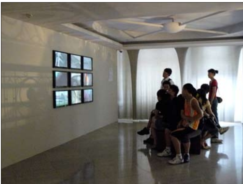
Visitor’s watching video work at Shanghai Biennale 2008.

What struck me most visiting Shanghai Biennale was the number of people clustered around the video