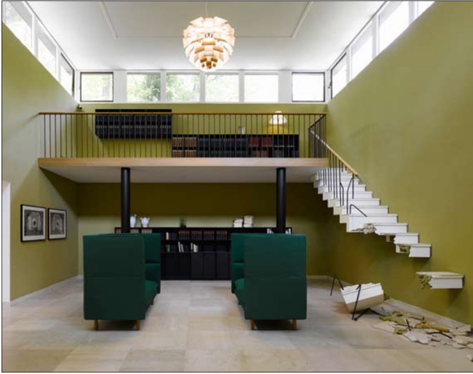
Installation view from the Danish Pavilion at the Danish & Nordic Pavilions, Giardini.