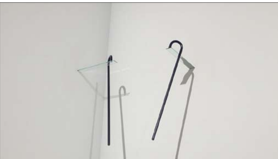
Richard Wentworth. Untitled (2009) at the Arsenale.

Even larger scaled works appear reserved; Michelangelo Pistoletto’s roomful of ornately framed mirrors, the relics of his performance Seventeen Less One where the artist smashed the surfaces with a mallet, makes a strong but not radical impact. Lygia