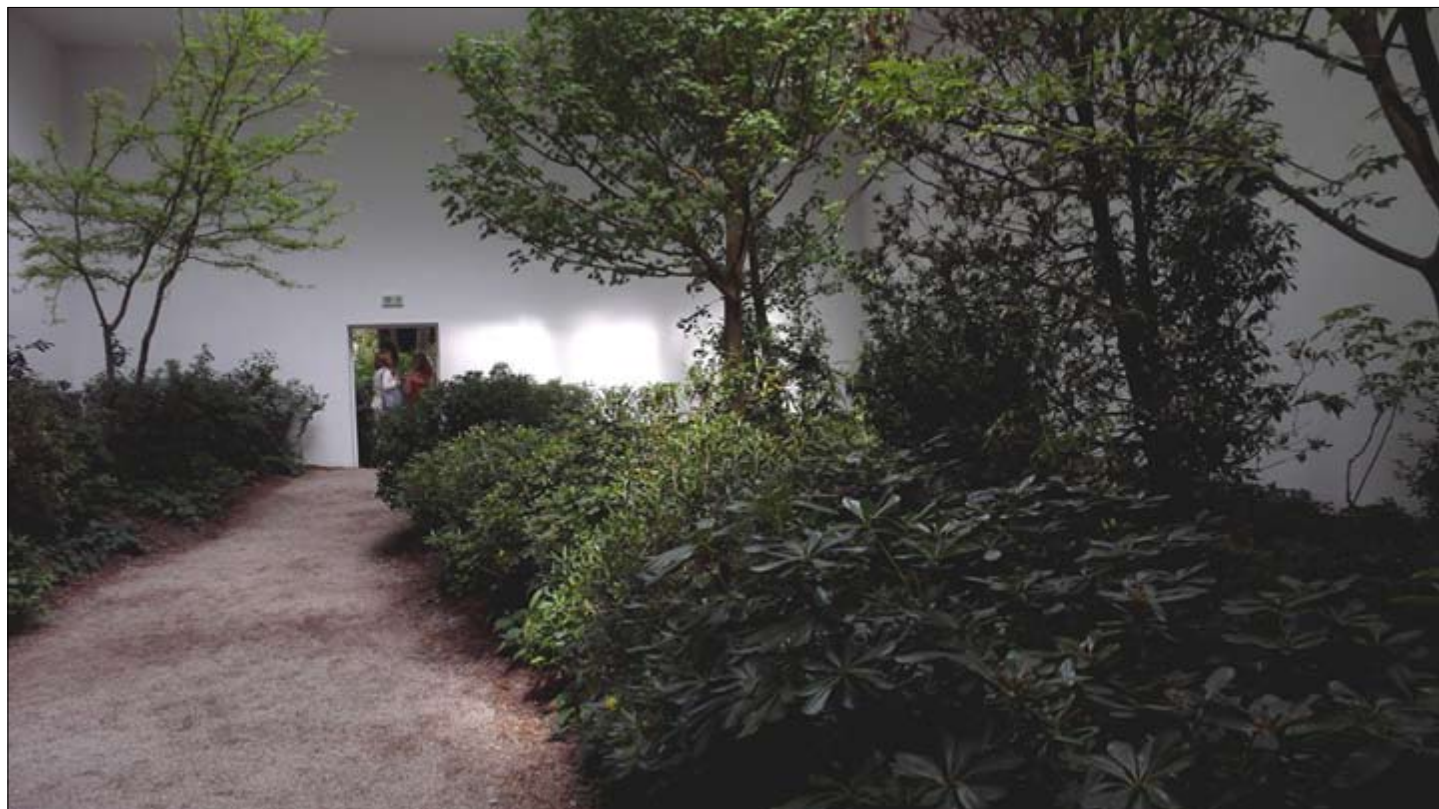
Roman Ondák's Loop (2009) at the Czech Pavilion in the Giardini.

In the aftermath of the manic opening days of the Biennale, it is perhaps only on hindsight that one can better appreciate the critical resonances of this year's fare and the varying forms of worlds present, past and future which the works seek to express. Yet, I am not entirely certain that any of the works in the Biennale really set out to 'make a world' at all but rather, to hold a globe up to the light and turning that sphere under the light, to scrutinize the world for what it appears to be now in order to understand its present nature. At the Czech Pavilion, Roman Ondák's Loop unassumingly questions what we currently perceive in our immediate present and the tendency to borrow from, rather than to invest in a future. Collapsing notions of the present with that of the future, the pavilion replicates its external ecology—the surrounding trees, plants and foliage surrounding the Giardini have been planted inside the pavilion. One might almost walk right through, and past it in a rush to look for what else is on show without noticing the work. That is, until you stop, take in a breath of fresh air and realize that this is the art, the world as it has already been made and its current composition, and how it continues to exist as far as it is re-envisioned according to how we relate to it from the here and now.