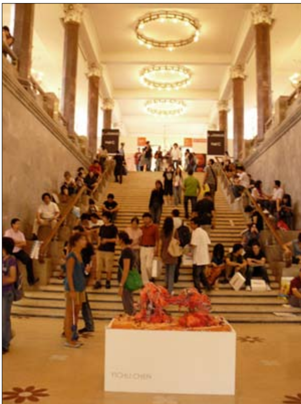
Weekend crowds at SHcontemporary08 Art Fair, Shanghai.

Hong Kong’s Asian Art Archive reports that today, there are over 60 international biennials and triennials, the overwhelming majority of which began during the 1990s. 3 By my count, 25 of those are/were events held in Asia; that is more than one third and growing. That says more about these locations than the art they are showing. Take China for example. Before 1996 it didn’t have a single biennale; it reportedly now has seven. ArtZineChina ’s report continues, “Four years ago there was only one art district—the 798 in Beijing; now seven cities around this country have art districts and Beijing alone enjoys nine art districts. Art Galleries grew from less than 30 five years ago to at least 300 at present. And five years ago, no more than five auction houses dealt with contemporary art, now at least fifty auctions houses have stepped into the contemporary art market...[In China] 70% of all collectors have emerged in only the last two years.” 4 This is definitely a growth industry.