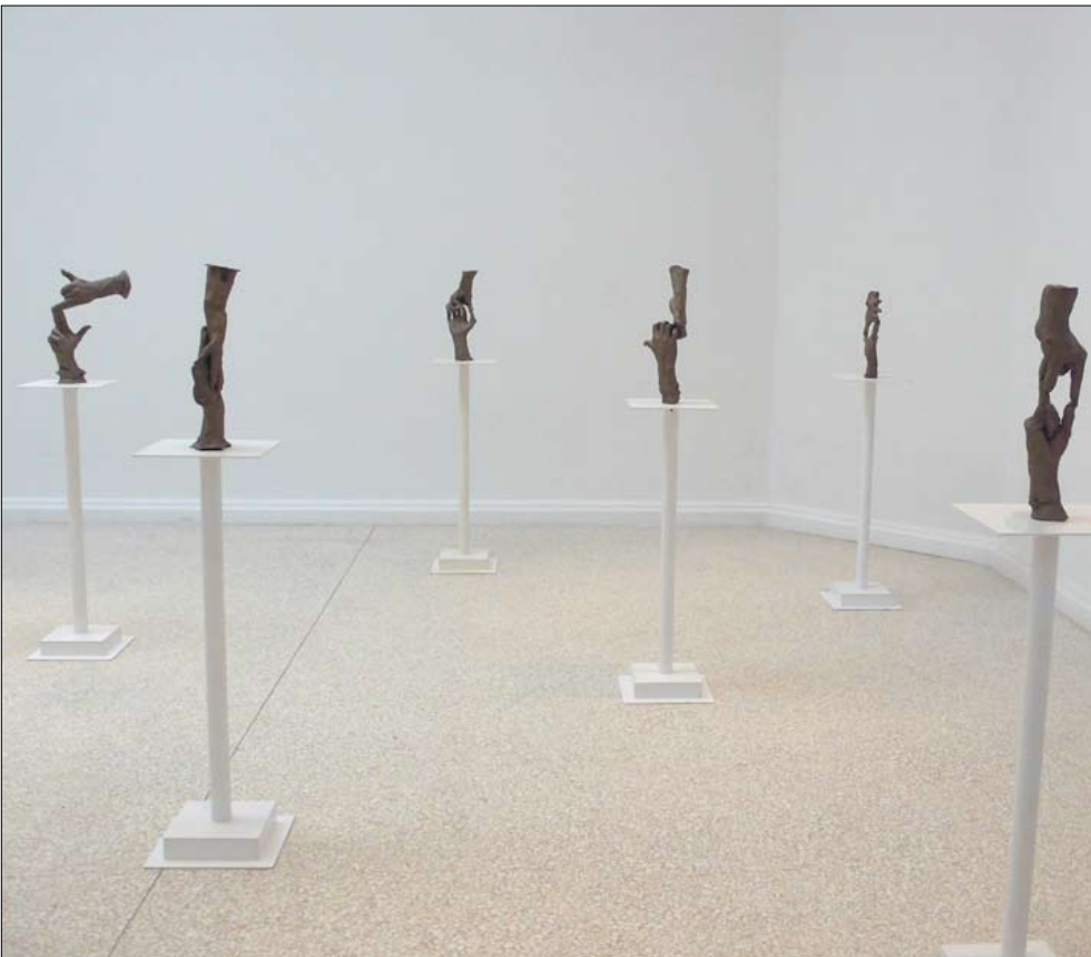
Bruce Nauman's Fifteen Pairs of Hands (1996) at the American Pavilion in the Giardini.