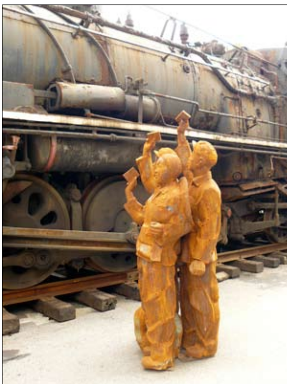
Jing Shijian (China). "Express Train: Shanghai Biennale Station" (2008). Train car, rail, sleepers, video, 45 tonnes. Installation view 7th Shanghai Biennale, 2008