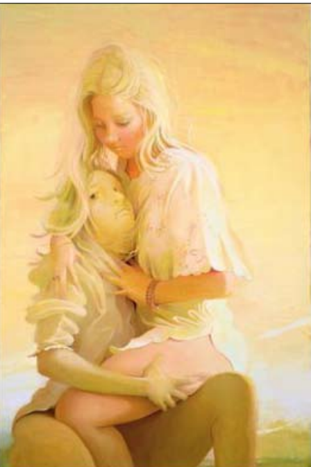
Yuskavage. Imprint (2006)

at different ages shown to us simultaneously? Perhaps this is why Yuskavage has begun painting two figures in some of her recent works such as Imprint (2006). As Yuskavage suggested to an interviewer: “I would put out the possibility that there are not two figures. That there is one figure, one entity. It’s the idea of caring for oneself or struggling with oneself” (Scott, 2006). Imprint is my favorite Yuskavage painting—so poetic in its representation of the two ages of a woman—the forty-something clinging to her youth which looks ambivalently on the older woman she is to become.