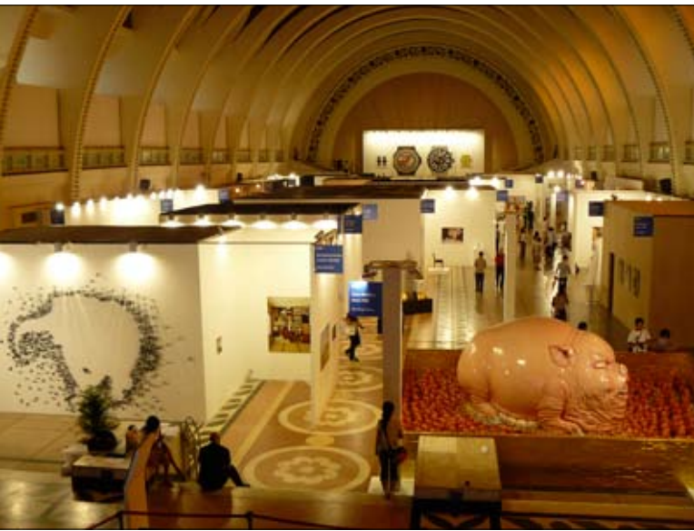
Installation view "Best of Discovery", SHContemporary08 art fair, Shanghai

What currency does the voice of the nomadic curator have to this local population, where he or she steps centre stage for a short moment? As 'the biennale' has been deployed across cities and regions, these events increasingly are brokered on themes of social responsibility as witness to