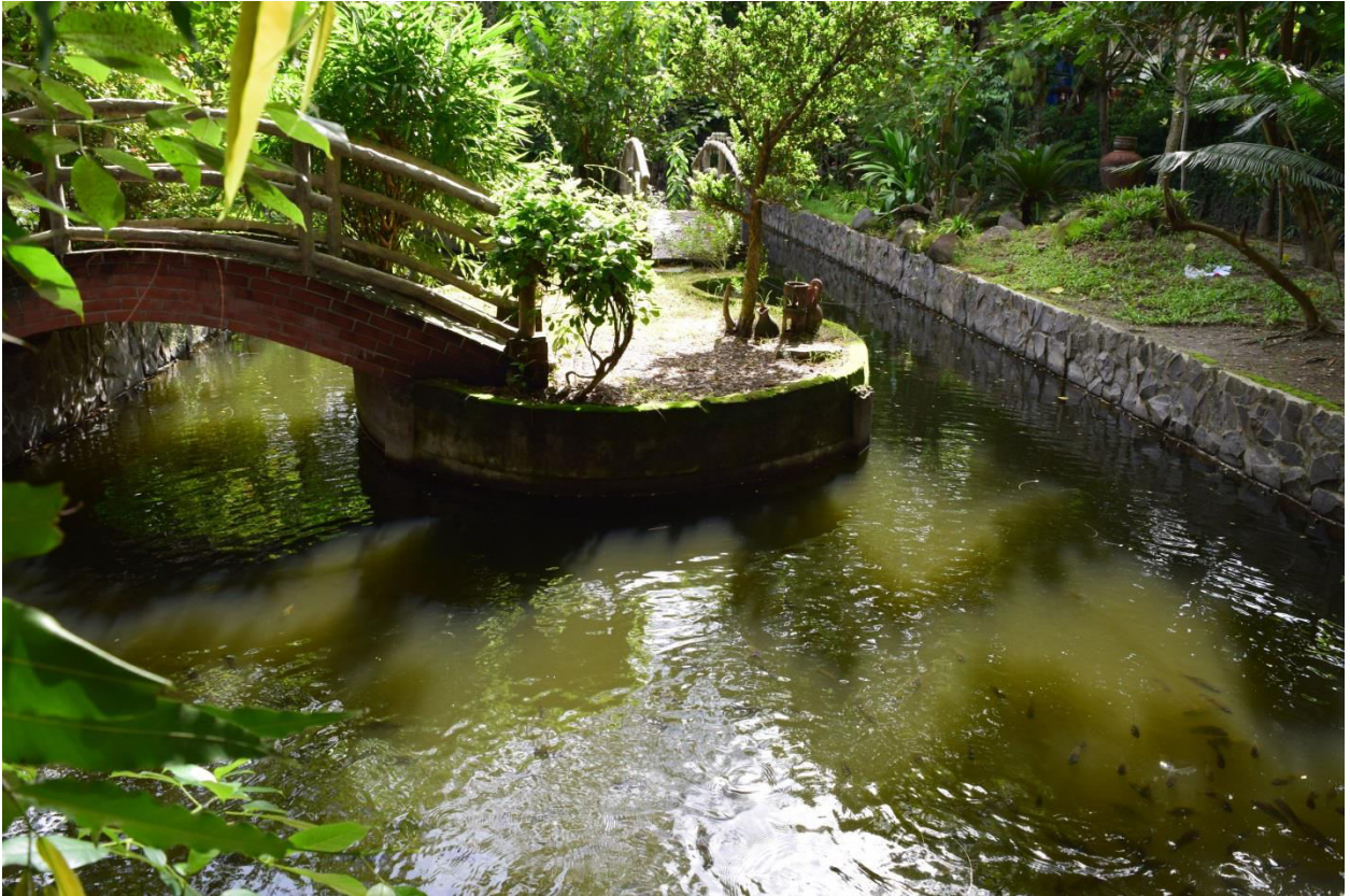
Diaspora Farm Resort