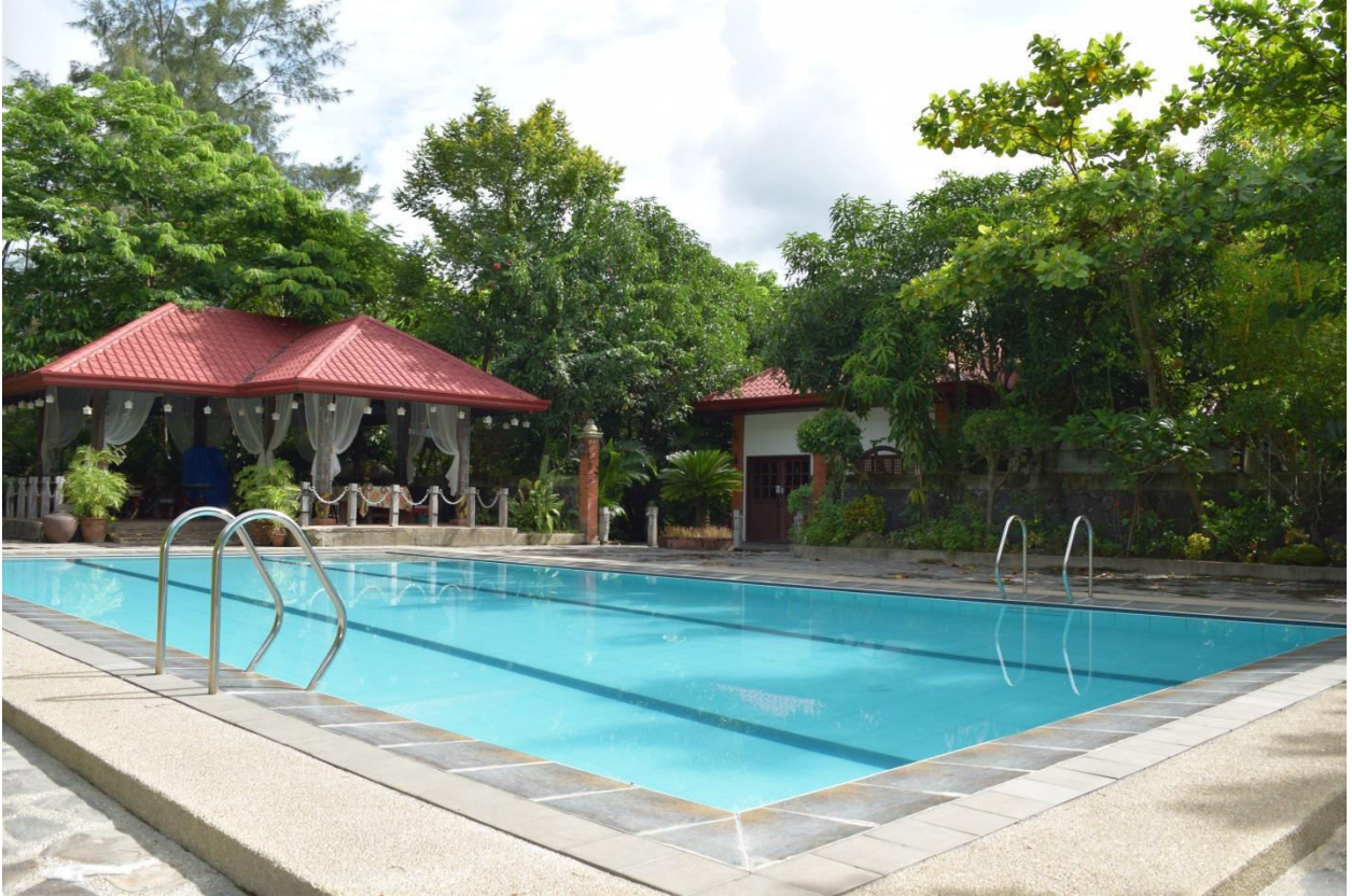
Diaspora Farm Resort