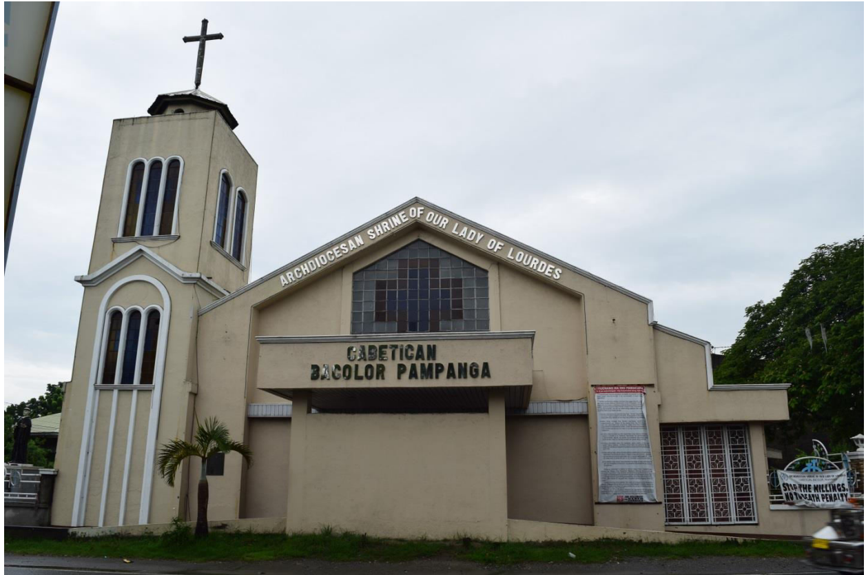
OUR LADY OF LOURDES CHURCH