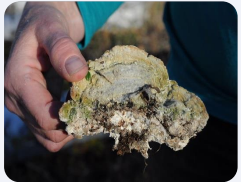
Fort Good Hope, NT

Project Overview: This project had been previously piloted in the community and was very well received by participants, who requested the event become a regular activity. During the first medicine walk, older women guided a group of youth and taught them how to pick and prepare traditional plants, while discussing the healing properties of each. The second walk focused on berry picking and the traditional stories behind each type of berry was shared.