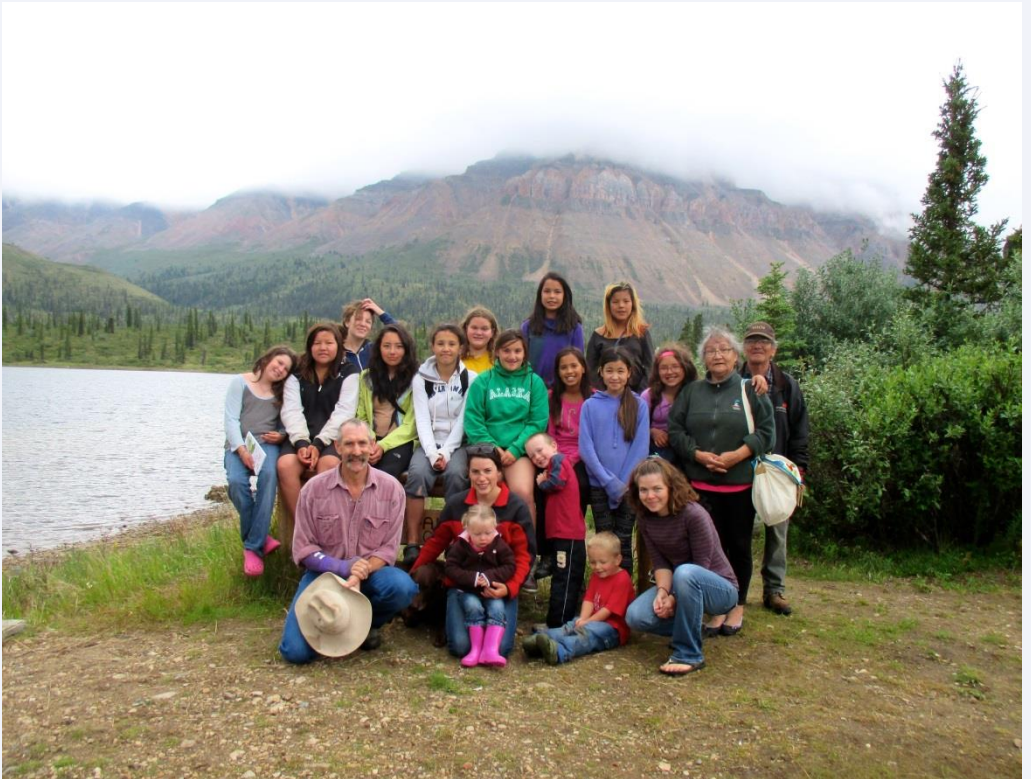
Gana River Camp, Sahtu Region, NT

“Respect and care for each other will be the objective of this intergenerational connection.” (Tulita Coordinator)