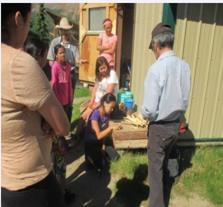
Gana River Camp, Sahtu NT

Community: Territory-Wide Lead Organization: Northern Youth Leadership Timeline: July 2014 (one week camp)