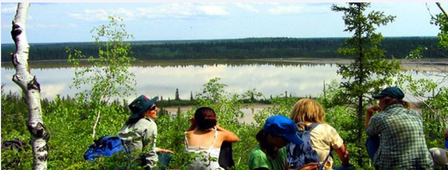
Fort Smith, NT

Intergenerational Practice aims to “bring people together in purposeful, mutually beneficial activities which promote greater understanding and respect between generations and contributes to more cohesive communities. It is inclusive and builds on the positive resources that the young and old have to offer each other and those around them” (Centre for Intergenerational Practice, 2001).