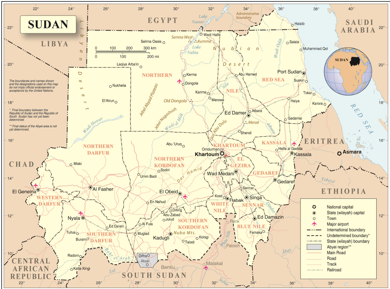
Map No. 4458 Rev.2 UNITED NATIONS March 2012