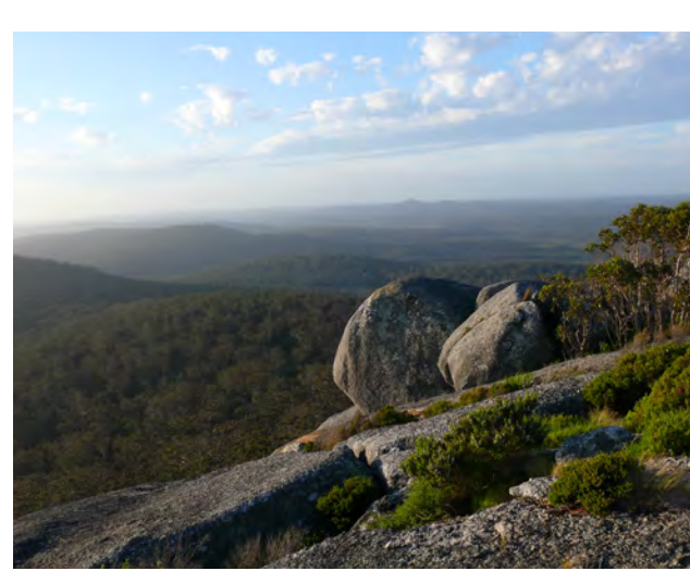
Above left Mt Frankland Wilderness Lookout. Above right Views from Mt Frankland summit.