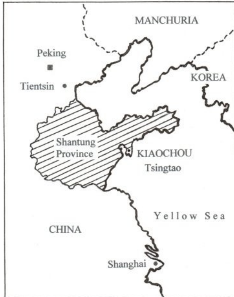
The German Colony of Kiaochou (1897-1914)

the foreigner!” Westerners identified these militia bands by giving them the name “Boxers”, a loose translation of their Chinese name meaning “Righteous Harmony Fists”. The Boxers at first began singling out Chinese Christians for persecution, then went after the missionaries themselves. Isolated posts were attacked resulting in many missionaries and thousands of their Chinese converts being put to death. Things rapidly got out of hand, with all foreigners finding themselves in grave danger. The greatest concentration of foreigners was in the Legation Quarter of Peking which contained the foreign embassies, and it is there that the Boxers went seeking revenge. The foreign powers made an unsuccessful attempt in June 1900 to send additional troops to protect the embassies there. Foreign troops then seized the