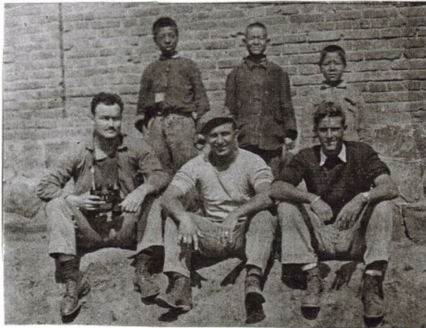
Author (lower right) with fellow Marines accompanied by three local kids eager to have their picture taken.