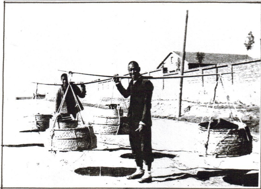
The “egg man” en-route to Tsingtao market.