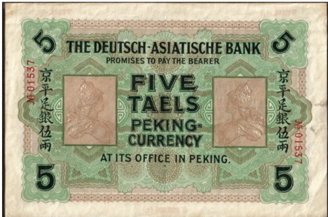
The Deutsch-Asiatische Bank 1907 five tael issue of the Peking branch office. The bank's main office was at Tsingtao in Kiaochou. Three other branches operated in Hankow, Tientsin and Shanghai. The notes were the product of the German printing firm of Giesecke and Devrient in Leipzig.