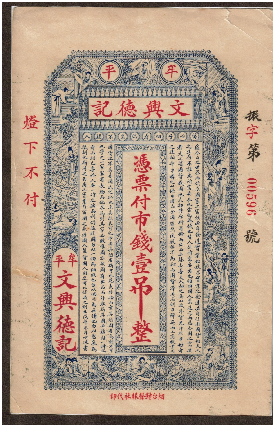
Private bank issue of Wei Hsing Te Chi in the amount of 1 tiao. "Tiao" was a term for one string of 1000 copper cash coins. This note is typical of those issued by money lenders in every town and village during the latter Ch'ing and early Republican period. Translated, the four vertical characters in the left margin read: "Not to be paid by lamplight".

began imposing their own banking systems upon a China weakened by corruption and wars.