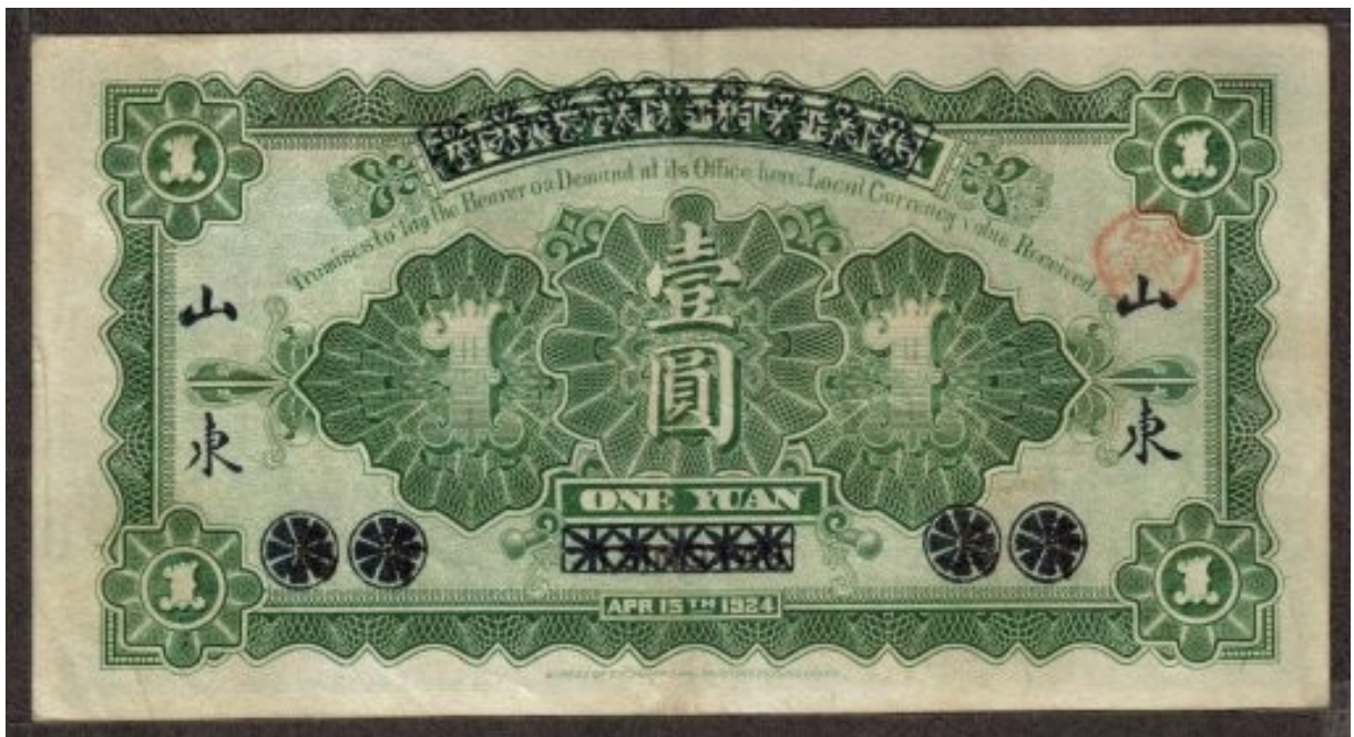
The Provincial Bank of Shantung released its first banknotes in 1924 after first obliterating the old Tsingtao City Bank name from the remainder of its note stock.