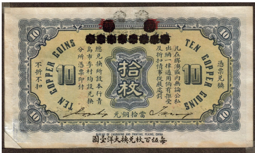
The Tsingtao City Agricultural and Industrial Bank changed its name in 1933 from the previous “Tsingtao City Bank”. As an economic expedient it reused existing notes by obliterating the former bank name and substituting the new.