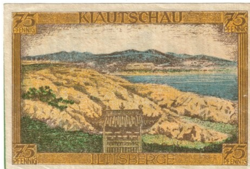
Berlin notgeld in the amount of 75 pfennig, dated 31 March 1922. This note commemorates “German-Hanseatic Colonial Remembrance Day”. All obverses in the series are alike. Each reverse honors a former colony. This one, honoring Kiaochou, contains a view of “Iltisberge”, otherwise known as Skunk Mountain.