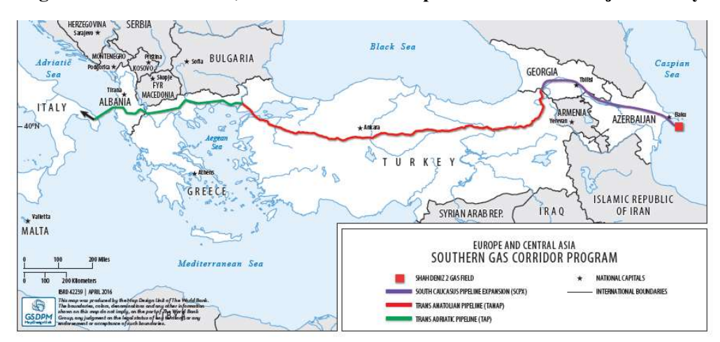
Figure 1: Route of SCPx, TANAP and TAP Pipelines from Azerbaijan to Italy