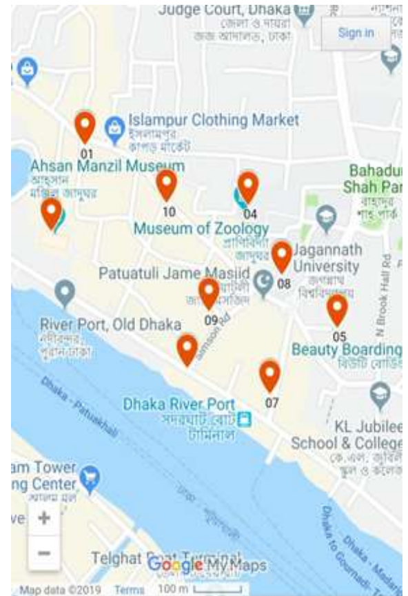
DS 37 Bangla Bazar Team-6 Day 2