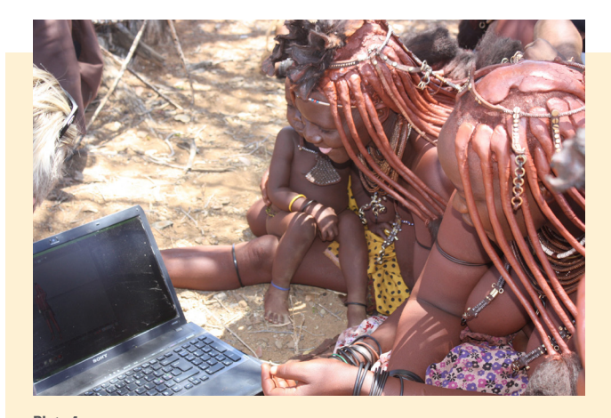
Plate 4 This shows the 3D model being evaluated by some of the women from the community. Photo: Heike Winschiers-Theophilus, 2014