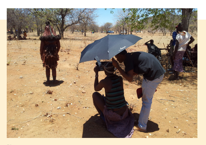
Plate 5 Uriaieke taking photos of his wife while being provided with shade by one of the researchers.

students re-used previously made 3D graphic models, among others one of our 'naked' woman (Plate 6). The intention was solely to produce a running application which could demonstrate a possible mechanism of dissemination of cultural heritage.