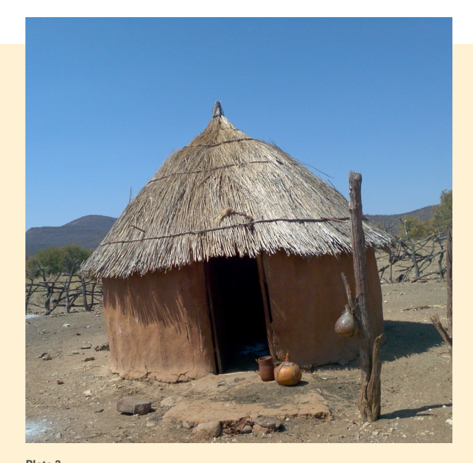
Plate 3 Left: photo of a traditional OvaHimba dwelling. Right: 3D model of the dwelling.