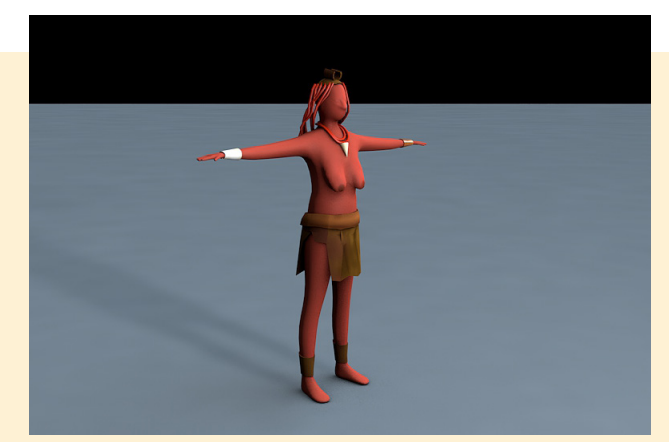
Plate 2 Left: photo of an OmuHimba woman. Right: 3D model of the OmuHimba woman. Photo: Uriaieke Mbinge, 2013.