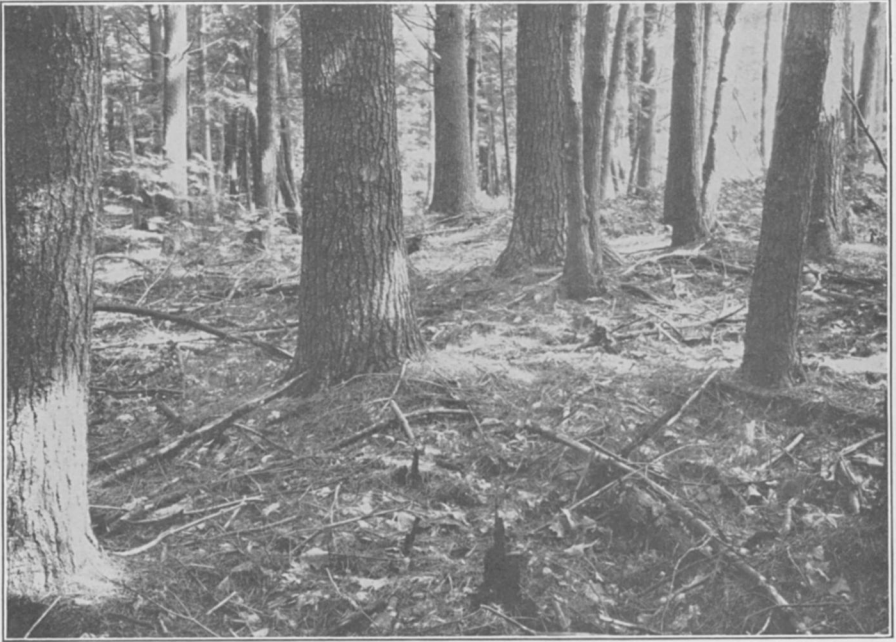
A. Original old field white pine stand (control area), now 80 years old.