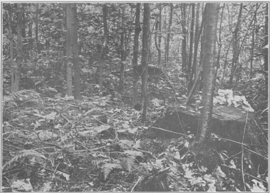
B. Converted stand of mixed hardwoods 18 years after clear cutting the pine stand. Before cutting, this area looked like A above. Note large pine stumps.