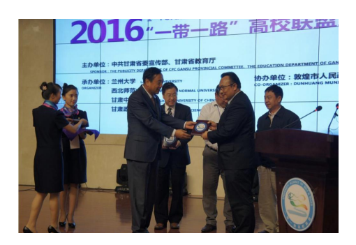
Image source: "首届"一带一路"高校联盟论坛在敦煌举行" [First Belt and Road Higher Education Alliance Forum Held in Dunhuang], Lanzhou University International Cooperation and Exchange Office, September 22, 2016

gins of the Dunhuang Silk Road International Cultural Expo in September 2016.<sup>74</sup> Pictures taken at the event show that it was jointly sponsored by the Propaganda Department of the Gansu Provincial CCP Committee and the Gansu Province Education Department.