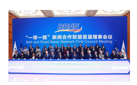
Belt and Road News Alliance<sup>24</sup>

The "Belt and Road News Alliance" (BRNA, 一带一路新闻合作联盟, Belt and Road News Cooperation Alliance), an idea that emanated from the State Council in April 2016, 25 was first launched by CCTV during the May 2017 Belt and Road Forum with a mission to "assist key media organizations in countries along the Belt and Road." It originally included 63 members from 35 countries. 26 It seems not to have been very active for the following two years and was reborn as "Belt and Road News Network" (BRNN,