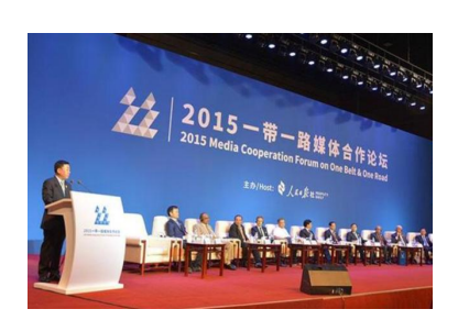
Media Cooperation Forums on the Belt and Road<sup>19</sup>

Since 2014, the People's Daily has convened four consecutive "Media Cooperation Forum[s] on Belt and Road" ("一带一路" 媒体合作论坛) which have included over 460 journalists from 126 countries. 20 Xi Jinping sent a congratulatory letter to the participants of the 2016 Forum, which illustrates its political importance. In his letter, he wrote that the media "plays an irreplaceable role in information dissemination, mutual trust, and consensus [...] I hope that the media in various countries will make good use of this platform to [...] play an active role in the construction of the Belt and Road." 21 The People's