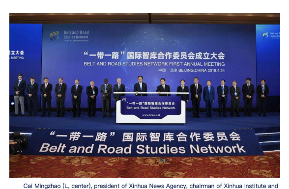
chairperson of an initiators council of the Belt and Road Studies Network (BRSN), witnesses with other guests the launching of the BRSN's official website, www.brsn.net, in Beljing, capital of China, April 24, 2019. The Belt and Road Studies Network (BRSN), co-initiated by Xinhua Institute and 15 other think tanks, was inaugurated in Beljing Wednesday.