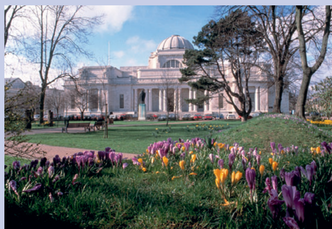
National Museum of Wales