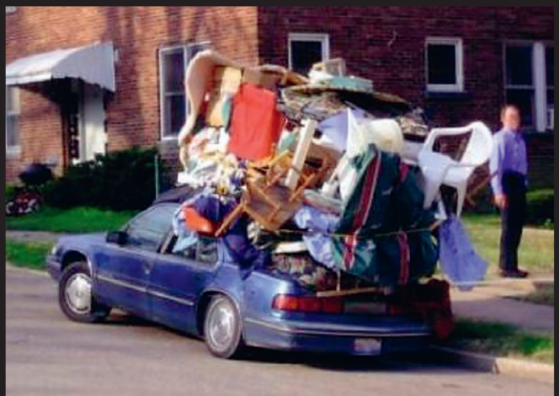
Many consumers undertake their own removals ...

We may be pint-sized, but we nevertheless pack an effective punch!