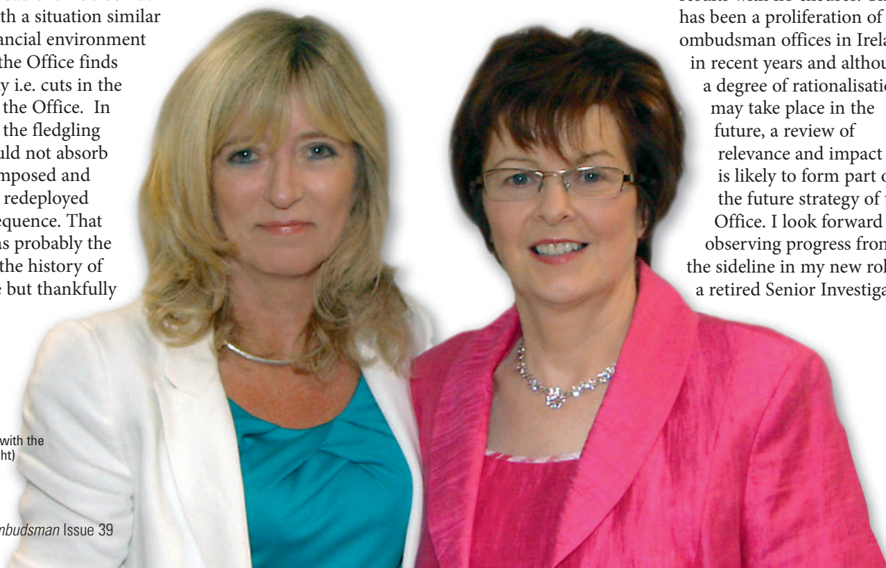
Emily O'Reilly, Ombudsman, with the author (far right)

Looking back over my time in the Office, my experience has been a very happy one. The nature of the work done has been a source of great satisfaction and fulfilment. The Office is very fortunate to have a competent staff dedicated to serving the public with kindness and patience. Times, however, are changing and the Office faces new challenges both internally and externally. The public has become more demanding and expects quick responses and results with no excuses. There has been a proliferation of ombudsman offices in Ireland in recent years and although a degree of rationalisation may take place in the future, a review of relevance and impact is likely to form part of the future strategy of the Office. I look forward to observing progress from the sideline in my new role as a retired Senior Investigator.