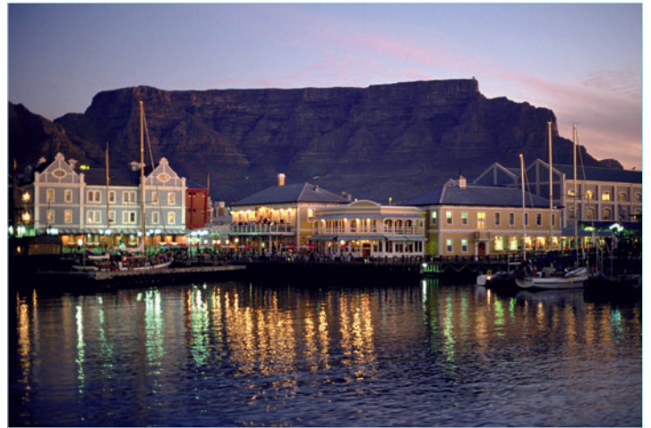
Table Mountain, Cape Town