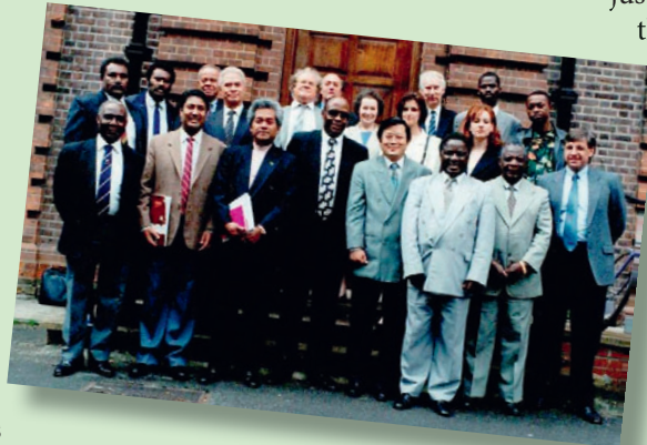
First international Ombudsman programme in May 1997