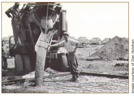
Levittown house built by developer William Levitt as part of the first mass-produced suburb in U.S.

c. 1965, Thomas Engel patents method for stabilizing polyethylene by cross linking molecules using peroxide (PEX-A) and in 1967 sells license options to a number of companies.