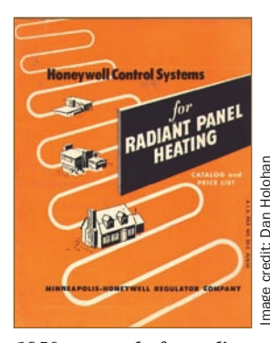
1950s controls for radiant systems.

c. 2000 The use of embedded radiant cooling systems in Middle Europe becomes a standard system with many parts of the world applying radiant based HVAC systems as means of using low temperatures for heating and high temperatures for cooling.