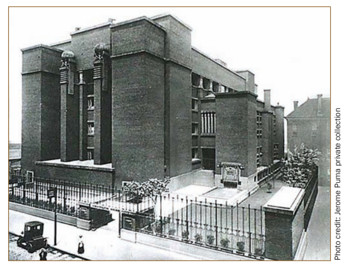
Larkin Administration Building, Buffalo, N.Y. Designed by Frank Lloyd Wright, it was one of the first to use radiant floor heating.

Bureau. It is also reported that since 2005, the number of commercial radiant system specifications has increased by 36% with 7.5% of new construction specifying radiant systems, a number expected to double by 2013.<sup>33</sup>