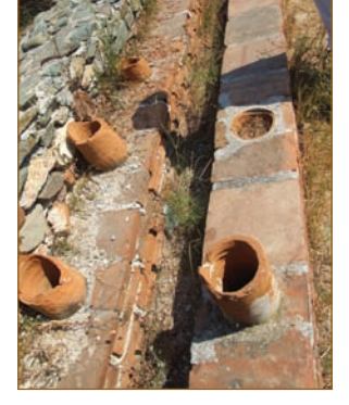
Hypocaust flues from Roman baths.

c. 1904, Liverpool Cathedral (England) heated with system based on the hypocaust principles.