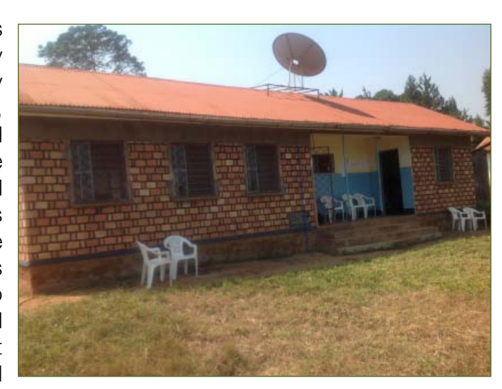
Figure 2.4: One of the Ward Information Center in Bukoba Rural District Council

During the survey, significant efforts or contributions by community members were evident especially in fishing, agriculture, housing, beekeeping irrigation. WARCs where beneficiaries have constructed descent houses, and other buildings to cater for offices and other official activities. team visited a few NSAs such as KADETFU and KANGONET who are active players in Bukoba Rural District. Like many other District Councils, this District is not oriented towards its own system of resource mobilization.