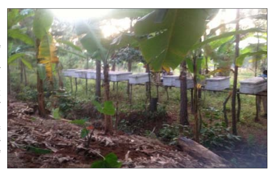
Figure 2.3: Kazi Kwanza Group Beekeeping at Kasenene

This project has been identified at Bugabo Ward due to its strategic location and potential for environmentally friendly projects of planting trees and beekeeping but also for the agroforestry industry in Bukoba town which has conducive climatic conditions. Bugabo Ward is crucial in order to protect the catchment areas