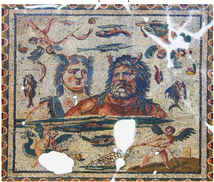
Figure 3: Antioch, Oceanus and Tethys

One of the earliest examples of such mosaics has been found in "House of Menander" dated 3rd century AD in Antioch (Levi,1947: 214; Cimok, 2000: 187) (Fig. 3). Designed on a central basis, a large part of the mosaic is covered by Gods and Goddesses. Eros figures were placed reciprocally and upside and down. The fish on left and right sides of Oceanus andTethys swim symmetrically towards each other. In the mosaic, the artist created a three dimensional effect in colours. The mosaic has the characteristics of naturalistic Greco-Roman style in terms of technique and style. The importance attached to presentation of figures rather than geometrical ornamentations or ornamental plant in pictorial areas is observed in this mosaic too.