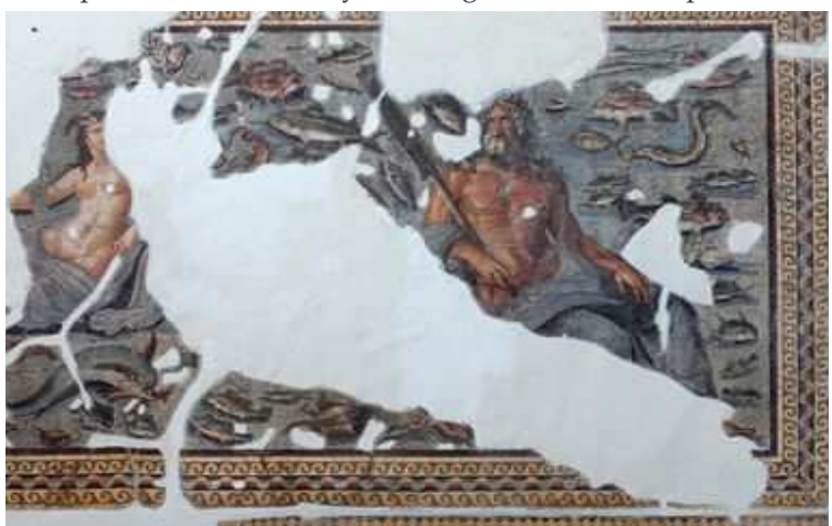
Figure 1: Antioch, Oceanus and Tethys

In the "Calendar House" mosaic, Tethys and Oceanus were depicted as surrounded by himation under their waists and together with various marine animals (Levi, 1947: 38–9; Lassus, 1983: 257; Campbell, 1988: 61) (Fig. 1). They both sit on the sea floor. Tethys leans left and raises her left hand up. She probably holds the body of Cetus with her left hand. The figures of Oceanus in such examples were described with a rudder resting on the shoulders and a pair of claws on hair. And Tethys was depicted with a pair of wings on her hair and a Cetus around. In the "House of Tethys and Oceanus" mosaic, they were depicted as half-lying reciprocally; their faces and bodies are parallel to each other (Levi, 1947: 222) (Fig. 2). It seems that whole-body representations of Oceanus and Tethys together are compositions of Antioch origin; and there is not an example, in which they were depicted in whole-body form together in Roman provinces other than Anatolia.