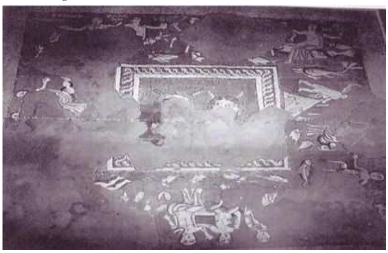
Figure 5: Garni, Oceanus and Tethys

One of the mosaics depicting Tethys and Oceanus together have been found pavement of Roman Bath in Garni. In the mosaic dated 3rd century AD, the outmost part of the panel was bordered by a pink stripe, and the figures of Nereid, Eros and fish ornament were used as border ornamentation (Wages, 1986: 120; Thierry-Donabedian, 1987:529) (Fig. 5).