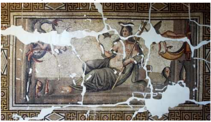
Figure 6: Seleucia Pierra, Tethys

One of the Tethys compositions has been found in Seleucia Pierra (Samandağ), located in the environs of Antioch. Tethys pictured individually in whole-body form in the centre (Cimok, 2005: 62) (Fig. 6).