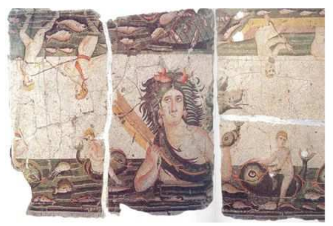
Figure 7: Antioch, Thalassa

were schematized differently from their real forms and they adopted a decorative form in the scene. The artist strengthened such decorative scene with Eros figures. The artists made the waves explicit with light and dark green tesserae. By using the tones of green, the artist succeeded in creating a marine atmosphere and used the sea as a border.