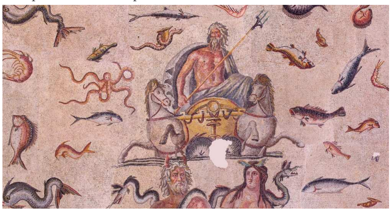
Figure 4: Zeugma, Oceanus and Tethys

too. In stylistic terms, it resembles the Tethys figure depicted in "Calendar House" mosaic. Both of these mosaics tend to display the characteristics of classical naturalism. The absent expression in the eyes of Tethys, the random placement of the fish, and showing the fish as if moving bear the characteristics of classical naturalist forms. The greatest similarity is seen in description of the fish, placed on all areas of the panels, swimming freely. Here, the artist aimed to imitate the marine life by including various fish in different colours such as octopuses, eels, shrimps and seashells.