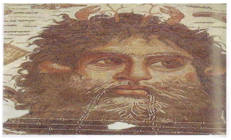
Figure 10: Themetra, Oceanus

One of these heads of Oceanus seen in frigidarium section of Roman bathhouse in Themetra city of Tunisia. In this mosaic, dated 3rd century AD, the big head of Oceanus was depicted with all its glory (Ben Abed-Ben Khader, 2006:115) (Fig. 10). Here, the fish, ships, fishermen and a few buildings complete the marine scene. The Oceanus head of Themetra is totally different from the ones created as a decorative theme with lineal shapes observed in late 2nd century AD. Such difference can be clearly observed in big and attractive eyes of Oceanus head, covering a large part of the panel, with dark green bulky hair and beard and sea water pouring down from the sides of his mouth.