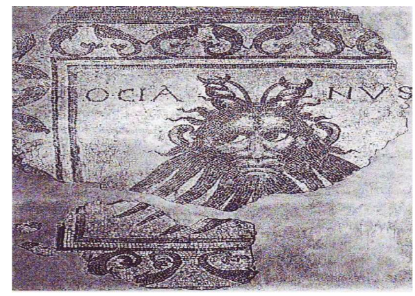
Figure 9: Montreal, Oceanus

One of such schematized examples has been found at hypocaust section of Glesia villa dated to 4th century AD in Montreal province of France (Balmelle, 1987: 194) (Fig. 9). The border of panel includes dolphin patterns and circulated by two tiny stripes inside. The bust of Oceanus is in a central position on a white floor. Over his head is the inscription on which "OCIANVS" is written. In the model, displaying a stylistic approach towards abstraction which is completely different from the classical naturalist forms, the God was depicted as half human and half animal. The wild and angry expression observed in the eyes of Oceanus is different from the calm and attractive expression of Oceanus depicted in Asian Roman geography.