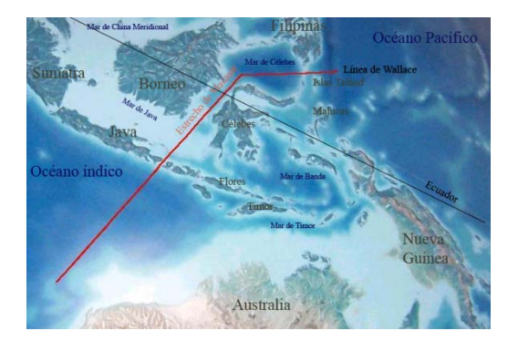
Wallace's Line divides the Australian and Southeast Asian fauna. The deep water of the Lombok Strait between the islands of Bali and Lombok formed a water barrier even when lower sea levels linked the now-separated islands and landmasses on either side [from Wikipedia].

his collecting, he has written two books, and no less than sixty published articles and letters in learned journals. Amongst his publications are three of the most important papers in the history of biological science, the Sarawak and Ternate essays and another that I have not yet mentioned, on the division between the Asiatic and Australasian biota - the famous Wallace Line <sup>25</sup>. His notebooks are observations crammed with of biogeography, observations that would be the basis for five books and influence subsequent profoundly studies of the subject..