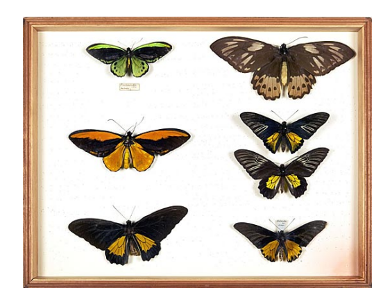
Wallace's specimens of birdwing butterflies (Papilionidae) in the Wallace Collection at the Natural History Museum, London. The drawer was arranged by Wallace. The specimen on the middle left is a male golden birdwing butterfly, named by Wallace Ornithoptera Croesus. He caught the first specimen in 1859 while on the island of Batchian (Bacan), "The beauty and brilliancy of this insect are indescribable, and none but a naturalist can understand the intense excitement I experienced when I at length captured it," he wrote. "On taking it out of my net and opening the glorious wings, my heart began to beat violently, the blood rushed to my head, and I felt much more like fainting than I have done when in apprehension of immediate death. I had a headache the rest of the day, so great was the excitement produced by what will appear to most people a very inadequate cause." (Wallace, 1869)

contents of many of which I had not seen for five or six years, and the examination and study of which I looked forward to with intense interest."