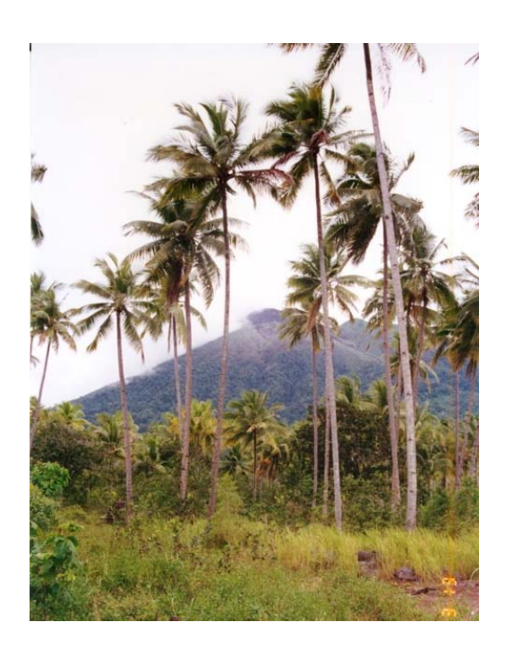
Mount Gamalama, the volcano that dominates the island of Ternate.

Eleven years earlier, after a day in the British Museum bemused by the huge numbers of beetles and butterflies on display, Wallace had written to Henry Walter Bates, soon to be his companion on the voyage to the Amazon, "I begin to feel rather dissatisfied with а mere local collection; little is to be learnt by it. I should like to take some one family to study thoroughly with a view to the theory of the origin of species. "<sup>3</sup> Now, in Ternate, still feverish, an idea comes to him, as all ideas seem to do, "in a flash." <sup>4,5</sup> He sets it out in the form of a publishable essay, "On the Tendency of Species to Depart Indefinitely from the Original Type", and posts it, together with a covering letter, to Charles Darwin, Down House, Kent.