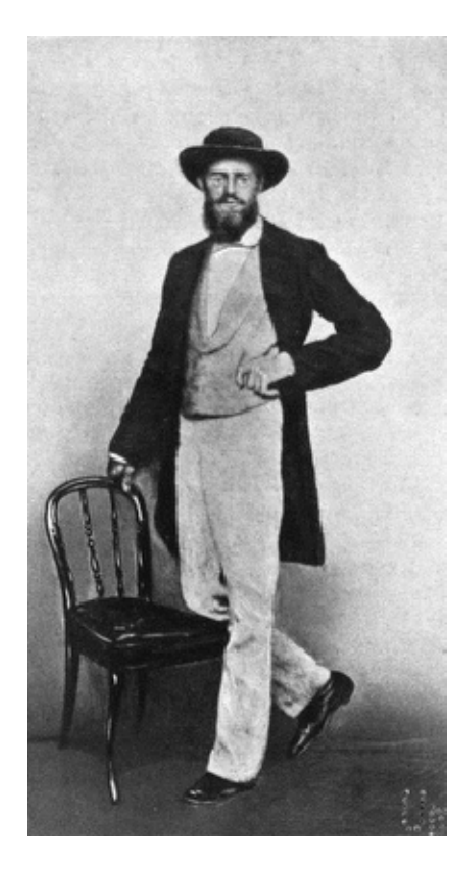
Wallace in Singapore in 1862, just before returning to England.

deserved, he would have had less time to "flit from project to project." But he was a man of prodigious intellectual energy. Many of the projects did not have the least prospect of financial reward. And many of them – socialism and spiritualism for example - centred on ideas that were latent even before he had embarked with his companion Bates for the Amazon. It is an injustice to Wallace to suppose that he would not have developed them.