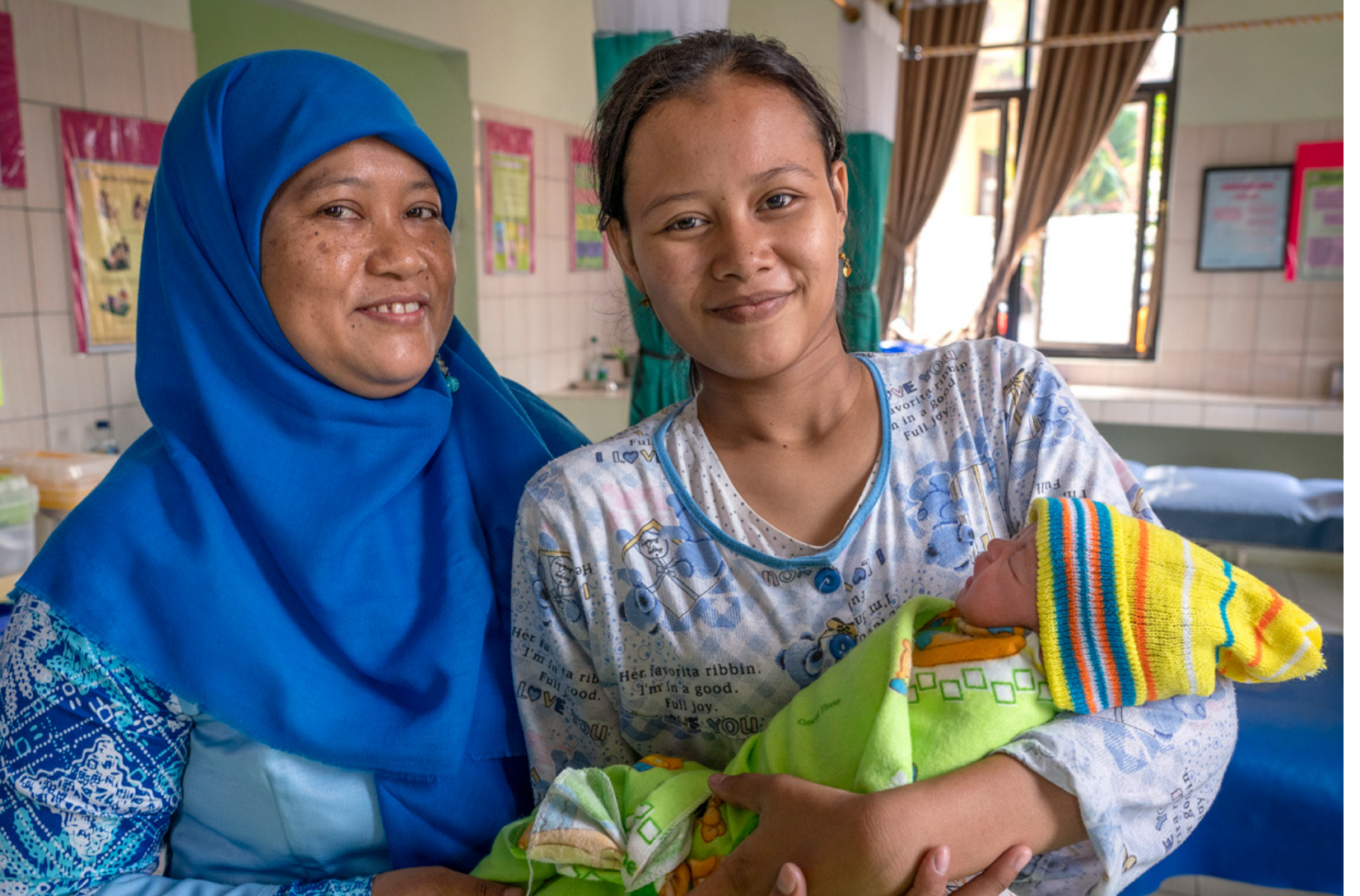
Above: A nurse in Banyumas, Indonesia, stands next to a new mother. In 2018, nurses in this birthing center completed a Helping Babies Breathe course run by LDS Charities facilitators.