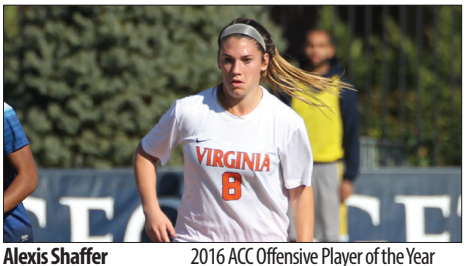
2016 ACC Offensive Player of the Year 2016 ACC Midfielder of the Year