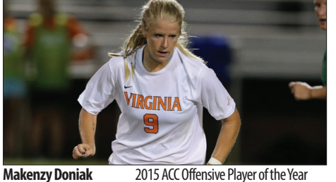
2015 ACC Offensive Player of the Year