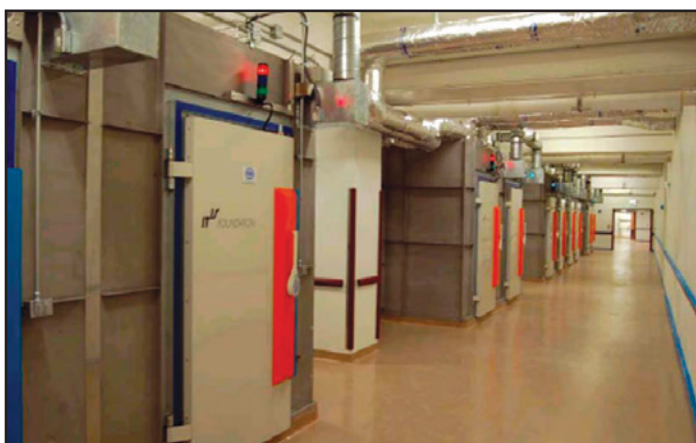
Chambers at the IIT Research Institute in Chicago where the studies took place

NTP and RFR experts from the National Institute of Standards and Technology (NIST) and the IT'IS Foundation designed and built the chambers specifically for these studies.