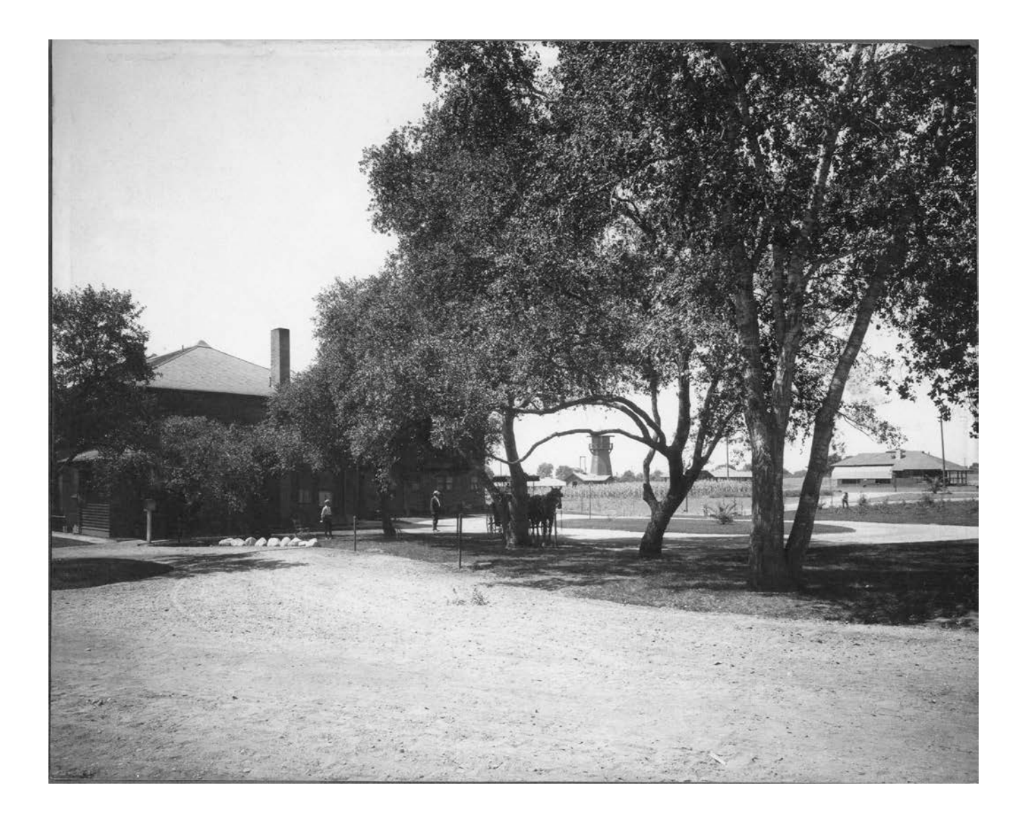
Figure 4. Circa 1905. View of west elevation of main building, water tank and cottages (view to southeast).