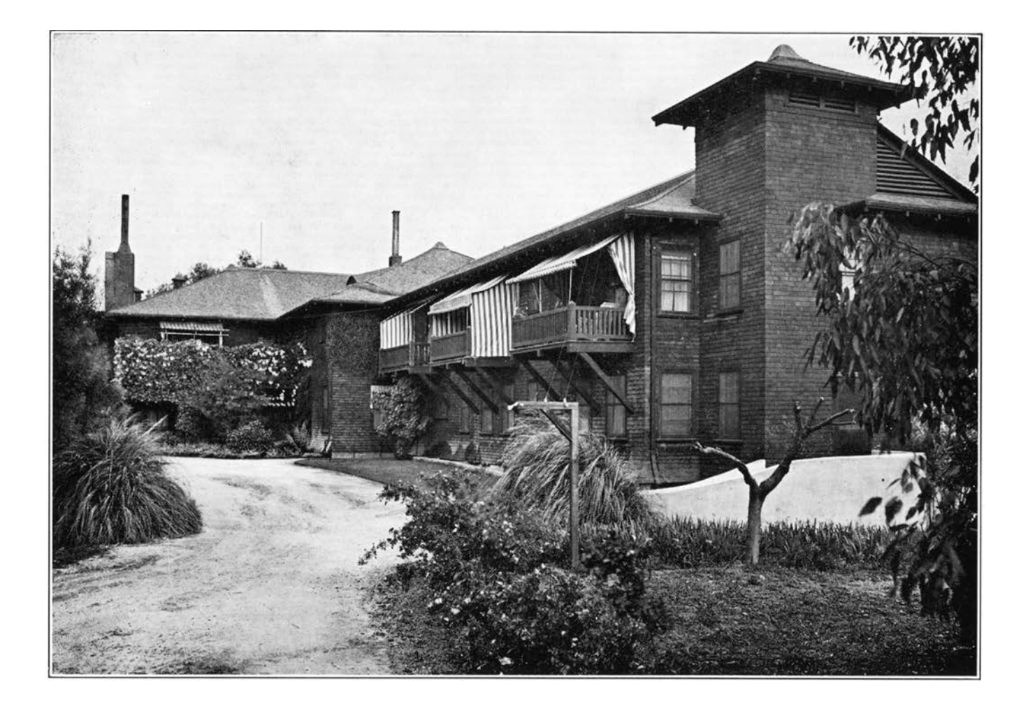
Figure 5. Circa 1910. Photograph showing tower of 1910 addition; original 1904 building on left.