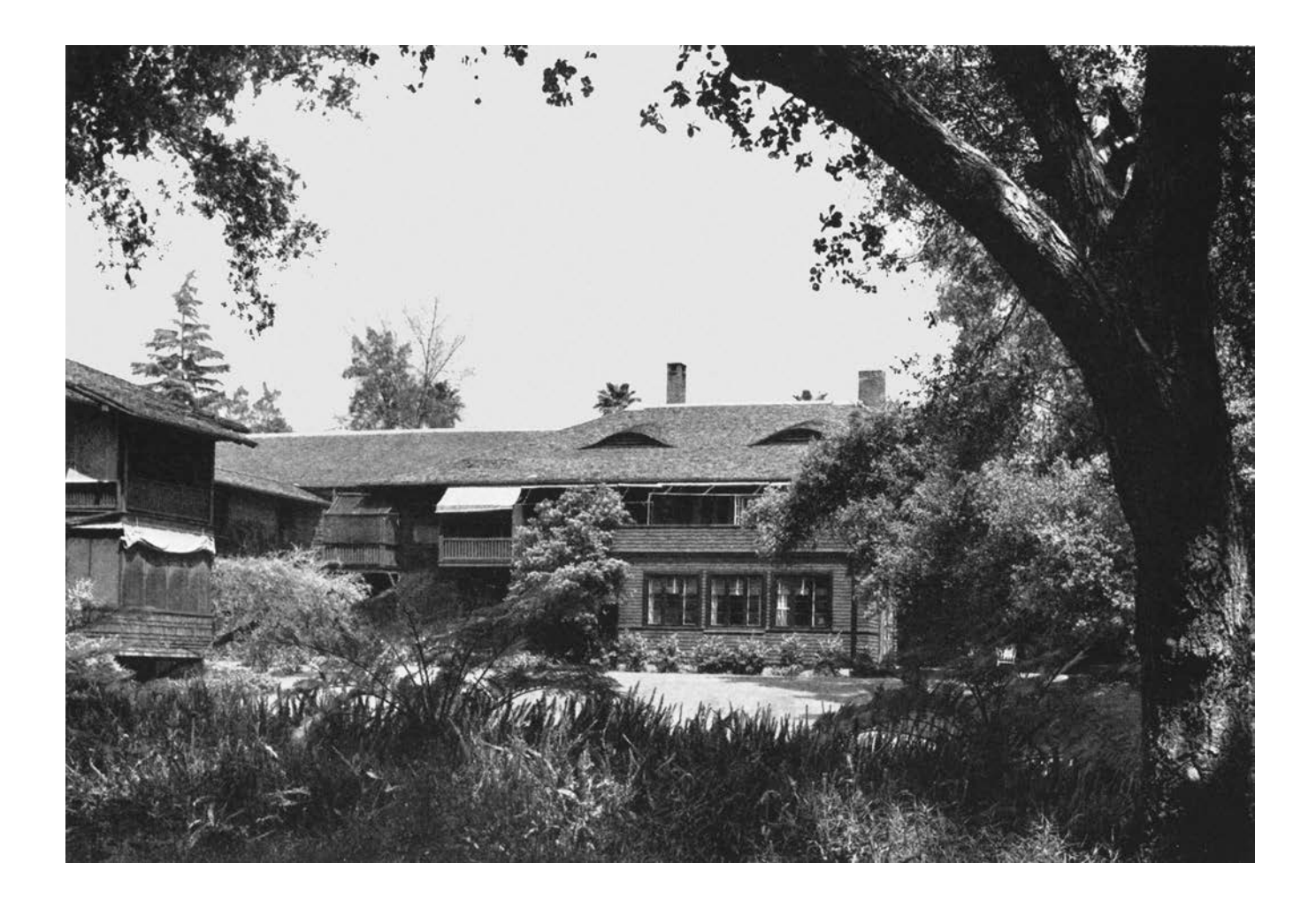
Figure 3. South elevation, with 1917 south wing addition on left, Southern California Sanitarium (date unknown).