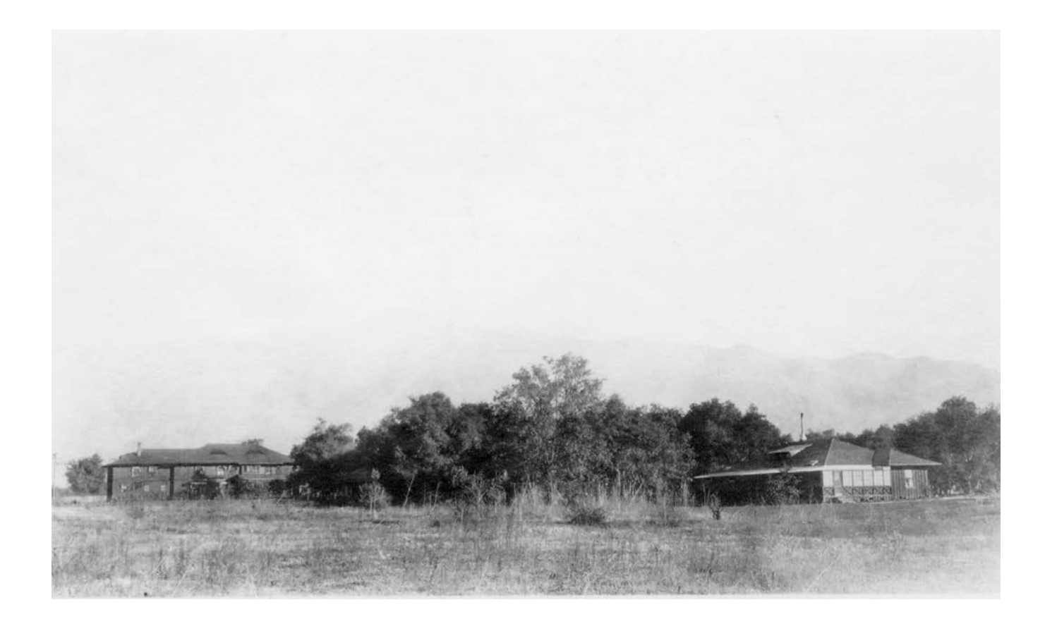
Figure 2. Circa 1905 photograph of Southern California Sanitarium.

Southern California Sanitarium Historic District Name of Property Los Angeles, CA County and State N/A Name of multiple listing (if applicable)