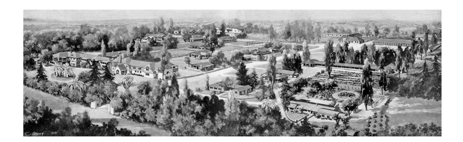
Figure 1. Circa 1930 view of Southern California Sanitarium. Drawing from cover of period brochure.