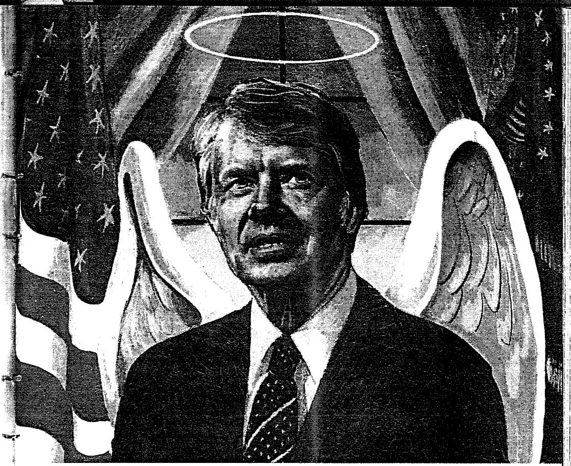
Illustration by Don Eckelkamp