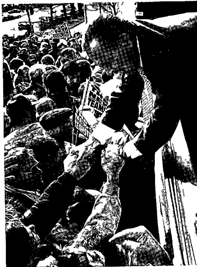
Ron Carey shaking hands with well-wishers outside the Marble Palace on his inauguration day.