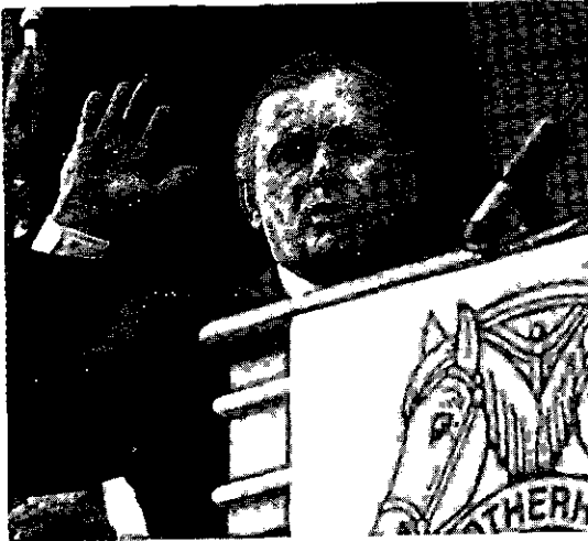
Ron Carey is sworn in on February 1, 1992, as the new General President of the International Brotherhood of Teamsters.

"I felt I could get those signatures even in that short period of time. But these people had another priority. So they didn't push like they would have or could have."