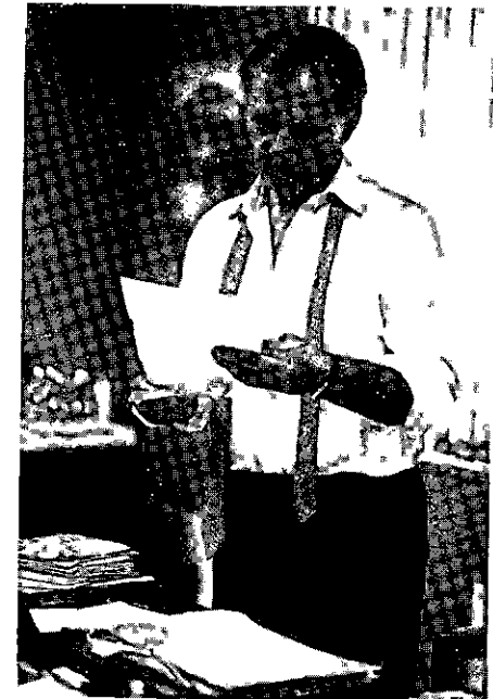
Ron Carey at his office at Teamsters Local 804 in Queens, New York. Carey announced his candidacy for the General Presidency of the Teamsters on September 17, 1989.