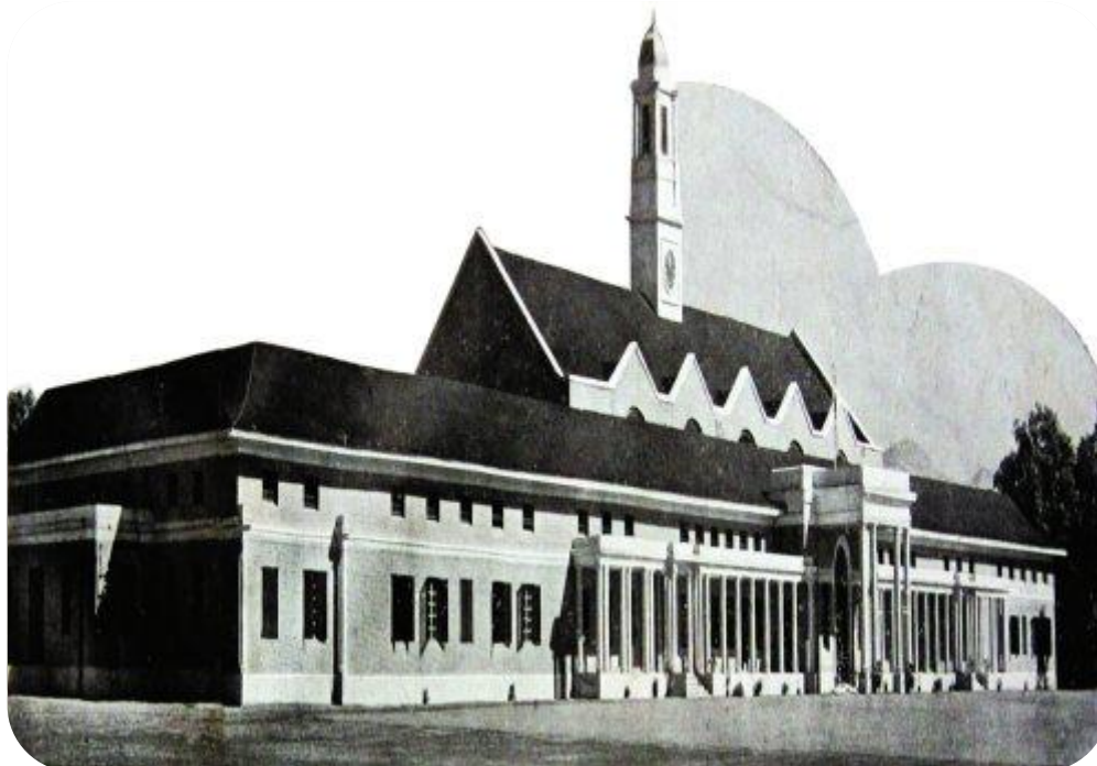
Chetwode Building in 1932

Brig LP Collins, DSO, OBE, 4 Gurkhas was appointed as the first Commandant and Capt JFS MC Laren, 1 st Battalion the Black Watch as the first Adjutant. The first batch of 40 Cadets reported by 30 September 1932 and on 01 October, the institution became functional.