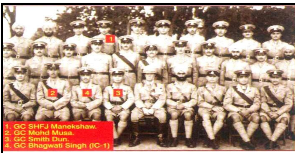
The Commandant with the first Course (The Pioneers), 1932

Regimental colours are the ceremonial flags of military regiments. Historically, their roots can be traced back to the Roman Empire. Colours are emblem of loyalty and courage and Indian Military Academy has the proud privilege of receiving the Colours thrice in its service to the Nation and as an acknowledgment of sacrifice of its alumni. The Academy was presented its First Colours by HE Viceroy Lord Willington on 18 November 1934.