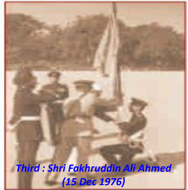
Third : Shri Fakhruddin Ali Ahmed (15 Dec 1976)

On 10 December 1962 , exactly thirty years after inception of the Military Academy, Dr. Sarvapalli Radhakrishnan, President of the Republic of India, presented new Colours to the Indian Military Academy in recognition of the gallant services of the Alumni of the Military Academy in various operations.