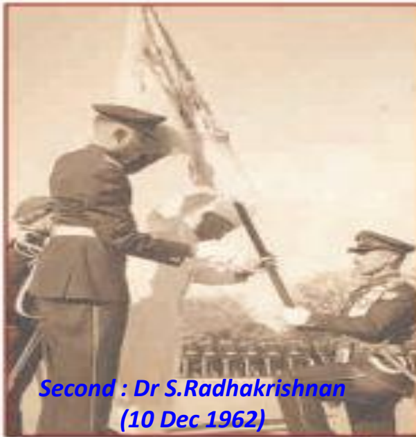
Second : Dr S.Radhakrishnan (10 Dec 1962)