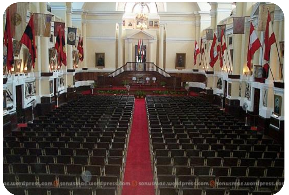
Chetwode Hall, 2016