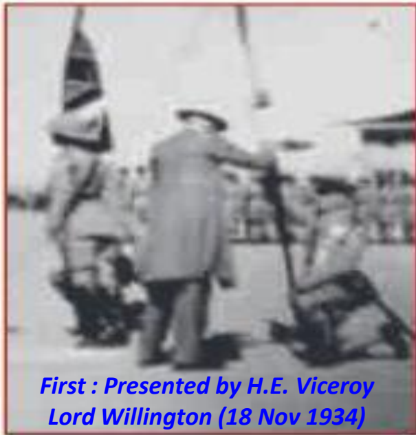
First : Presented by H.E. Viceroy Lord Willington (18 Nov 1934)