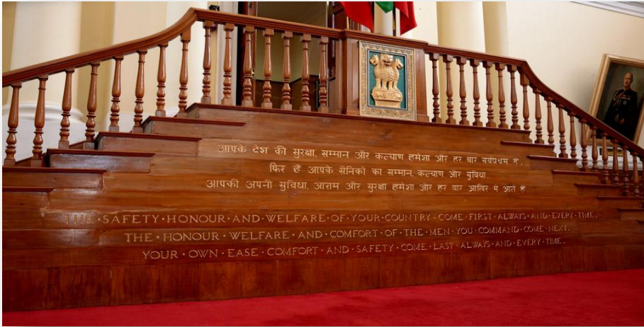
CREDO (Inscribed in the Chetwode Hall)