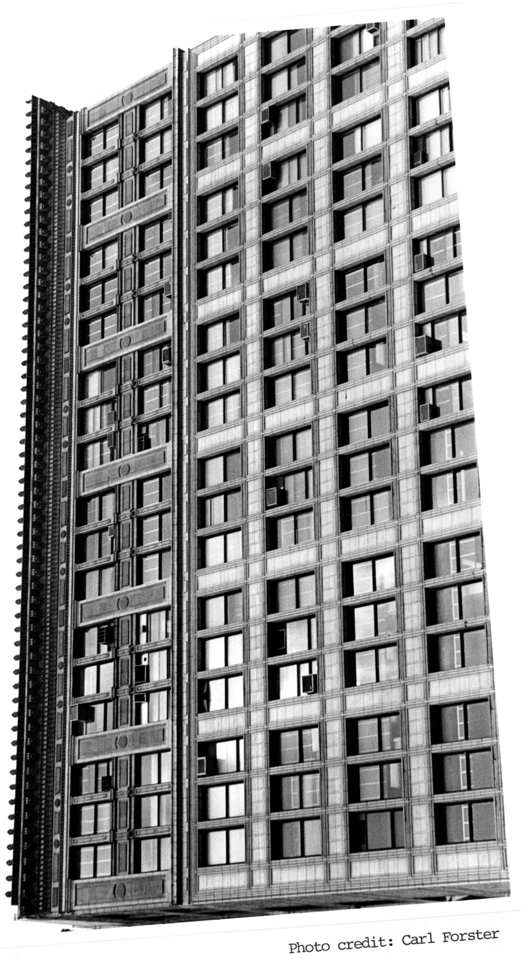
The Everett Building Detail, upper stories and cornice, Union Square elevation