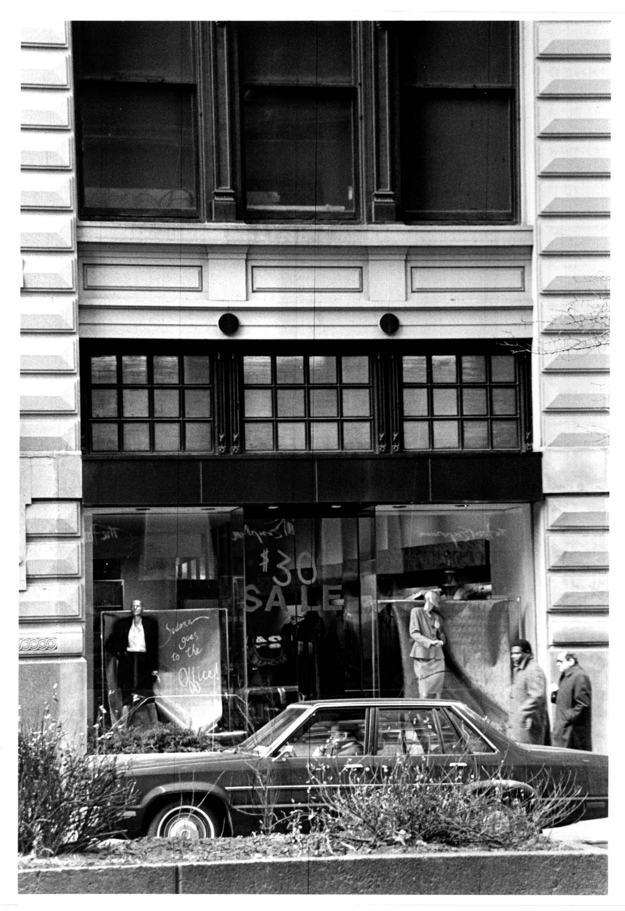
The Everett Building Detail, ground story, Park Avenue South elevation (original transom treatment)