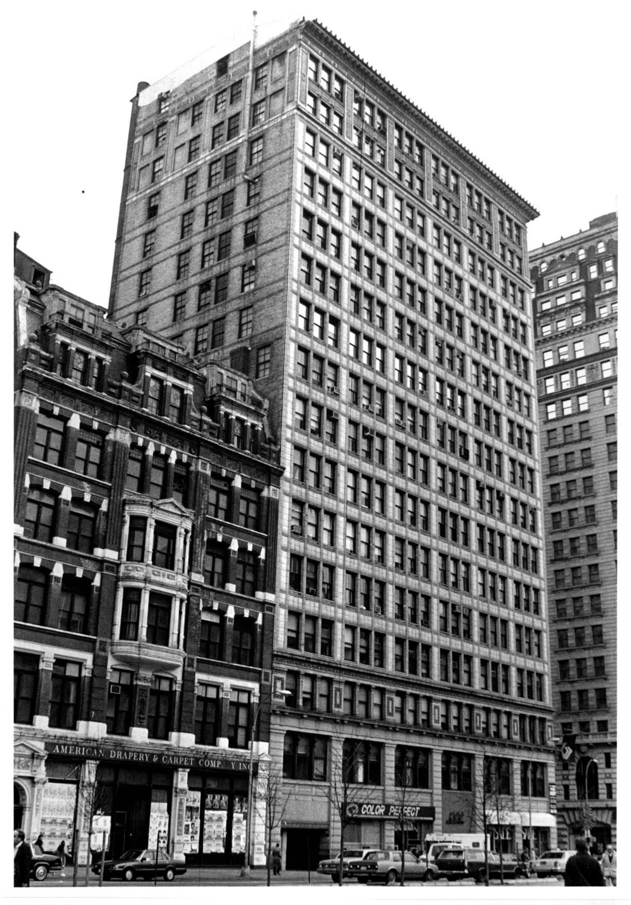
The Everett Building West and Union Square elevations