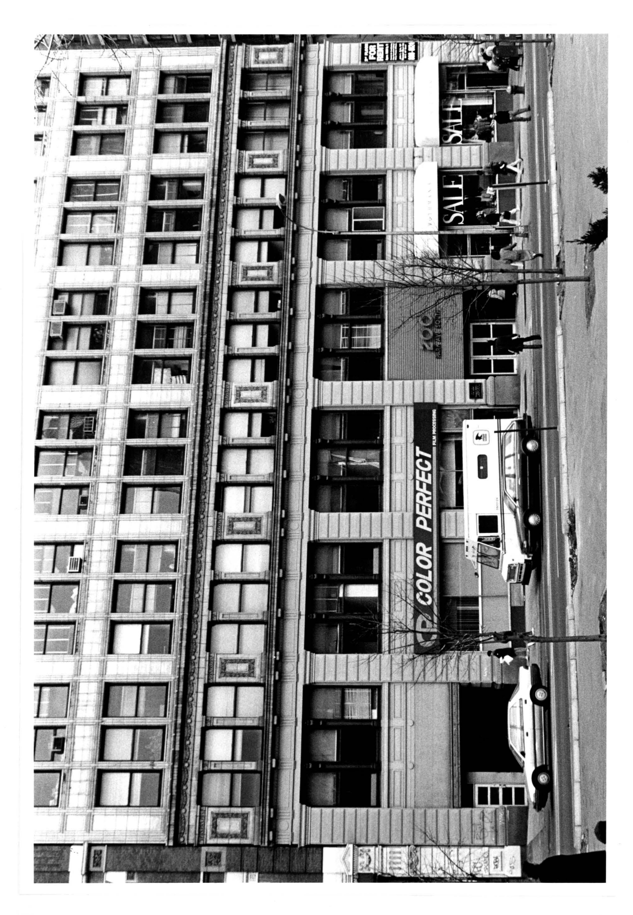
The Everett Building Detail, base, Union Square elevation