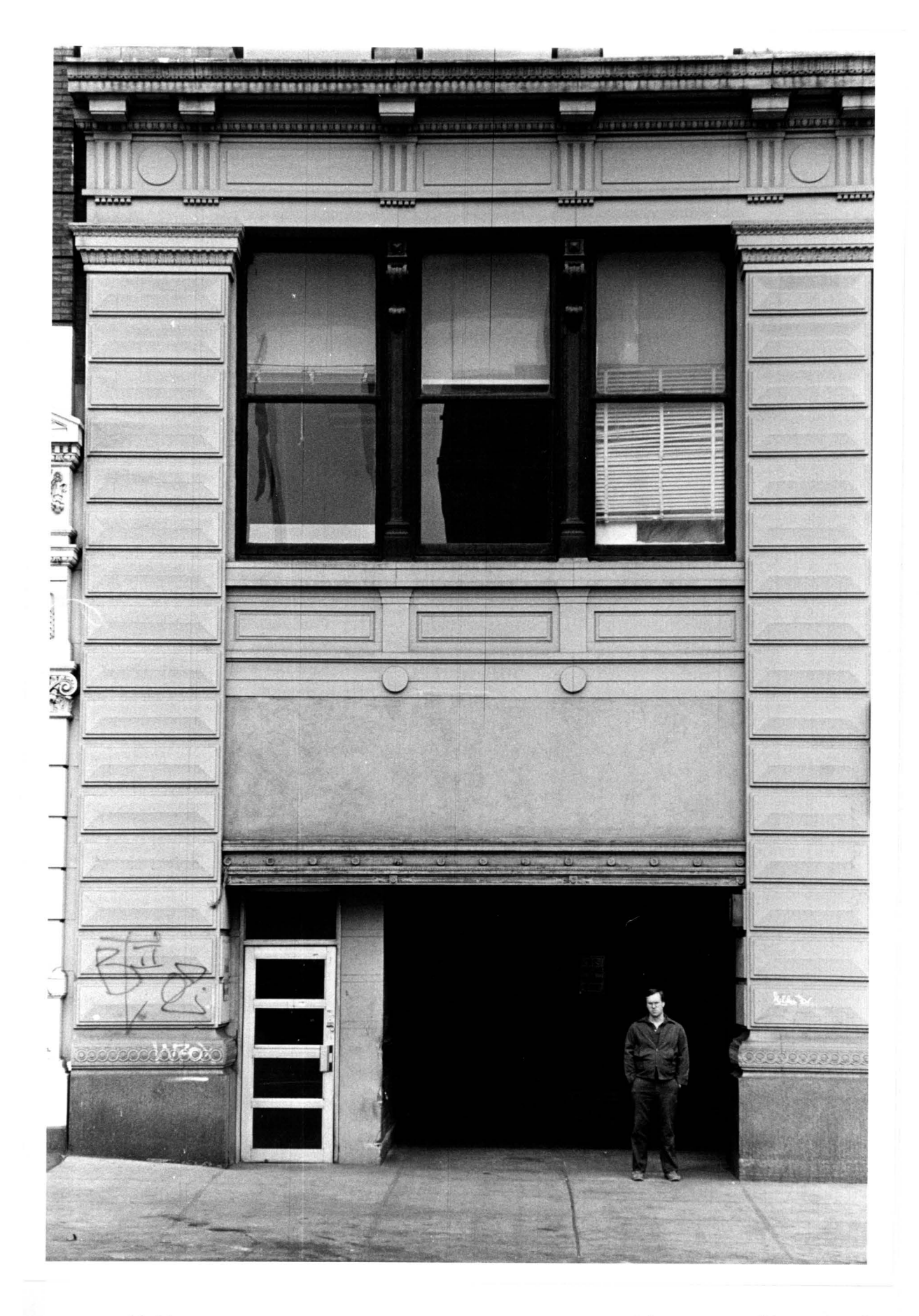
The Everett Building Detail, base, Union Square elevation (original overdoor molding treatment)