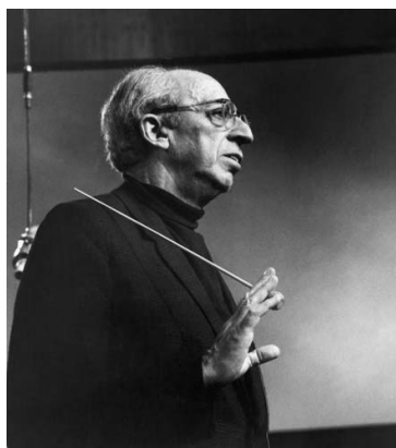
Aaron Copland, elected 1951.

Election: 1999, Fellow Affiliation at election: University of California, Los Angeles Residence at election: Los Angeles, CA Career description: Historian; Philosopher; Educator; Academic administrator Current affiliation: Same