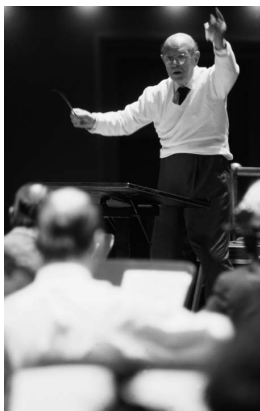
Pablo (Pau Carlos Salvador Defillo de) Casals, elected 1960, FHM.

Career description: Civil engineer; Educator