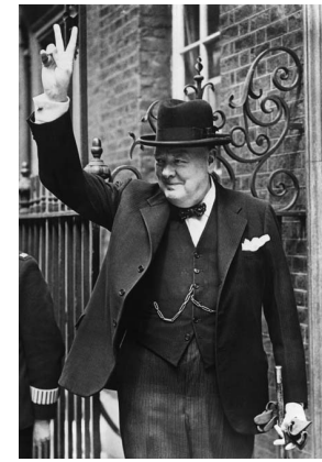
Winston Churchill, elected 1946, FHM.