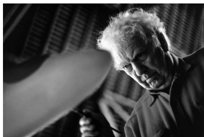
Alexander Calder, elected 1959.

Calasso, Roberto (1941-) Election: 2000, FHM Affiliation at election: Adelphi Edizioni S.P.A Residence at election: Milan, Italy Career description: Writer (essayist, fiction writer); Publisher Current affiliation: Same