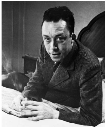
Albert Camus, elected 1959, FHM.

Career description: Astronomer; Observatory administrator; Academic administrator