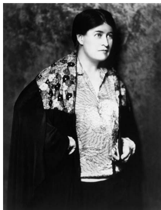
Willa Cather, elected 1943.