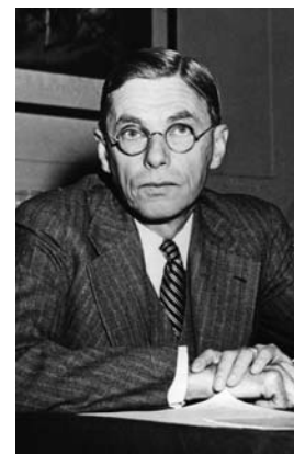
James Bryant Conant, elected 1924.

Career description: Astronomer; Educator; Academic and observatory administrator