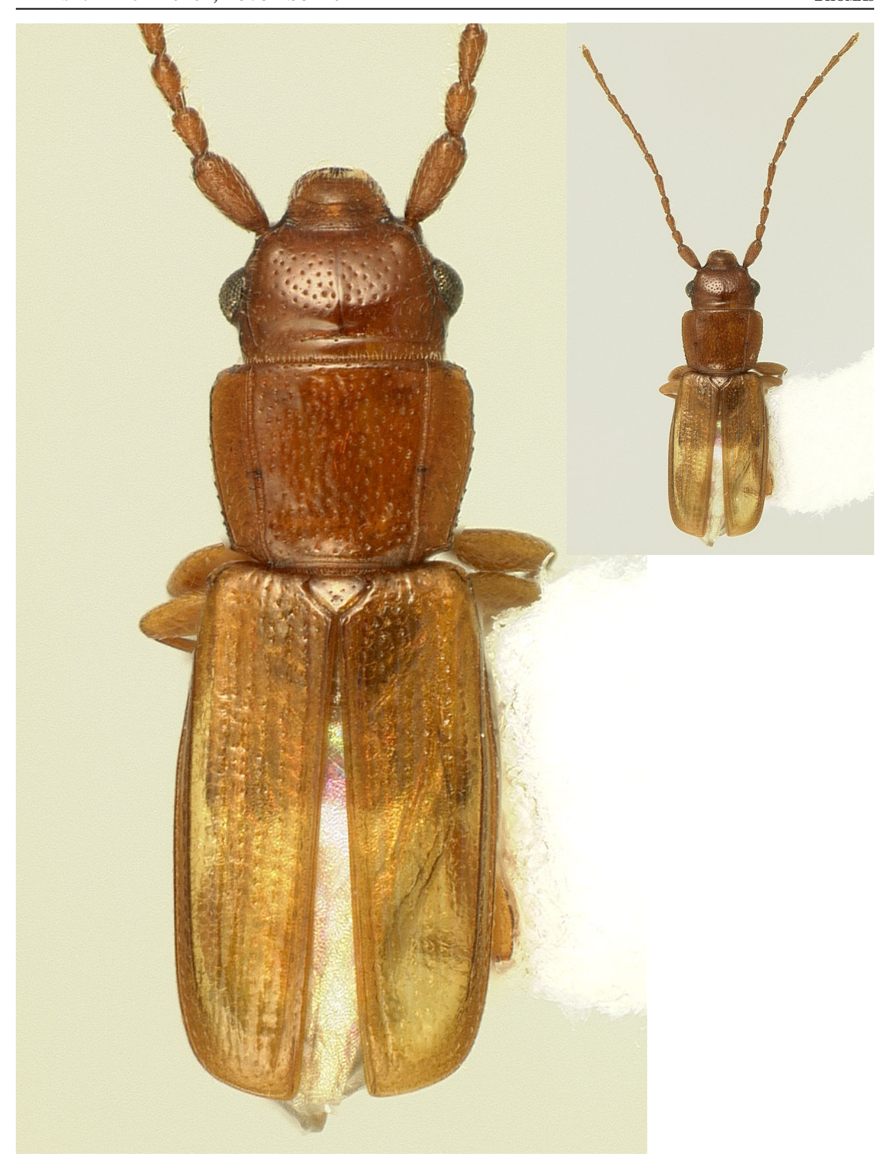
Figure 1. Placonotus falinorum Thomas, n. sp., dorsal habitus of holotype less antennae. Inset, dorsal habitus of entire specimen.