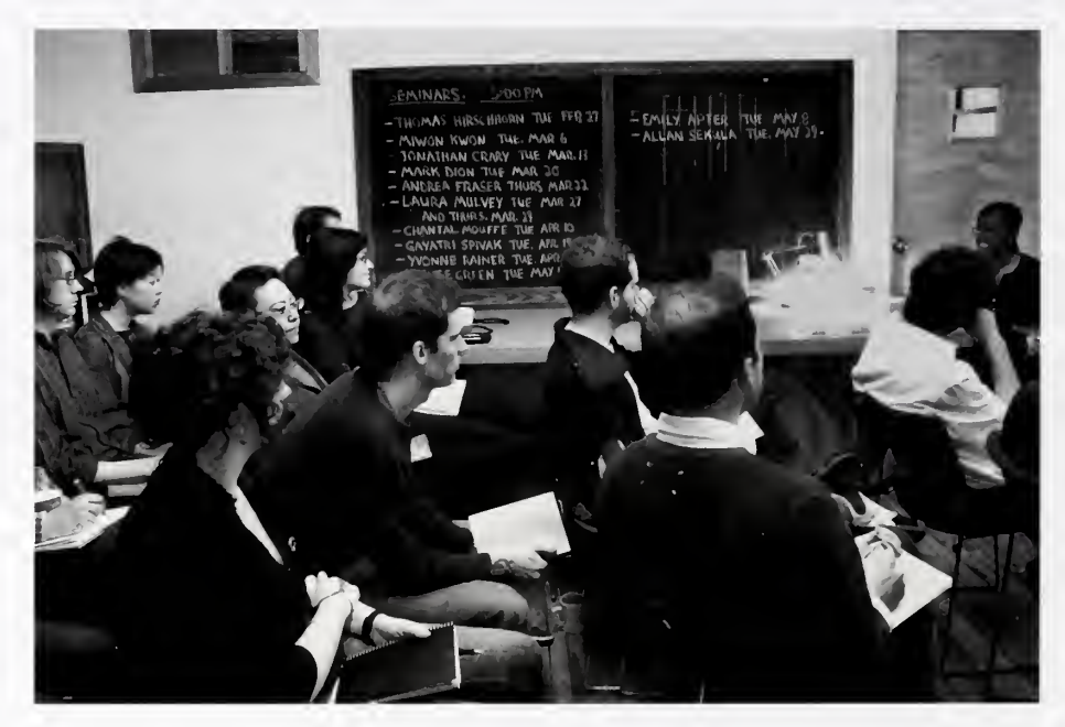
Artist Renée Green leading a seminar at the ISP space at 100 Lafayette Street, 2006

ISP faculty member Eva Diaz leading a seminar at the ISP space at 100 Lafayette Street, 2005