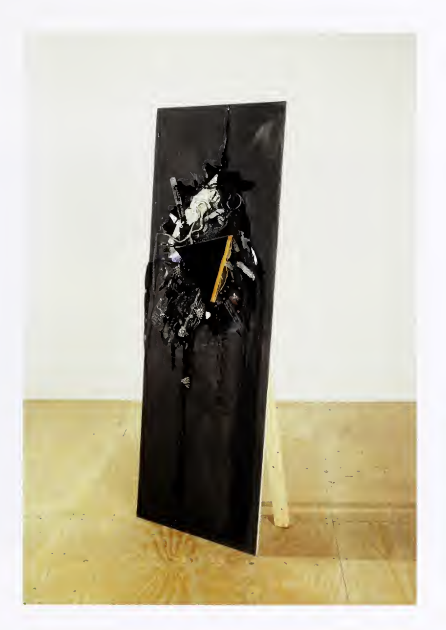
Grand Entourage , 2006 Mixed media and liquid glass on plywood panel, 75 x 27 in. (191 x 68.6 cm) Private collection, San Juan, Puerto Rico; courtesy Reena Spaulings Fine Art, New York