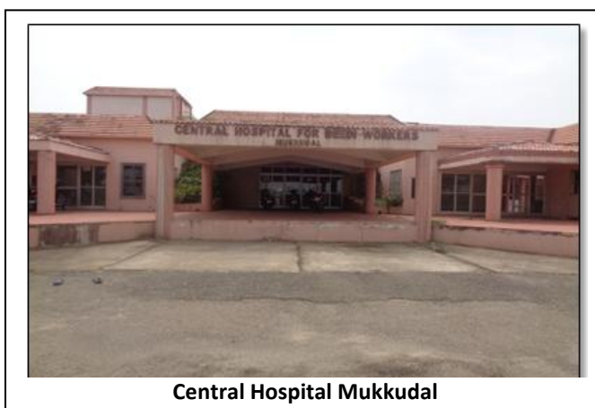
Central Hospital Mukkudal

The Beedi Workers Hospital at Mukuddal town in Tirunelveli District is the only one in Tamil Nadu for beedi workers. It started as a dispensary in 1983 and, in 1987, was upgraded to a hospital, with 28 beds. It functions under the Ministry of Labour, Commissioner of Welfare. There are 6 staff nurses and 2 doctors apart from the CMO. It serves the population coming under a 15 km radius of the hospital.