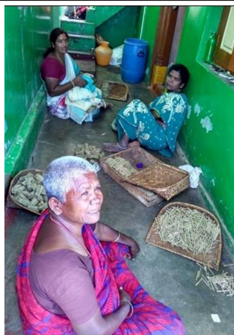
Cramped Working Conditions of the workers

Most dwellings of the beedi workers are poorly maintained with unclean surroundings. Many of them don't have their own houses and instead stay in rented dwellings which add to their burden. This is the situation particularly in the urban areas. Within the villages the situation of those coming from the SC community is the worst because most of them don't own any land. Apart from that they also face discrimination at multiple levels.