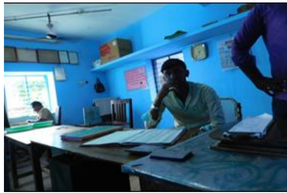
Village branch of Kajahbeedi

Visits to village branch of Chandrikabeedi and Kajahbeedi, in Tirunelveli district, gave a glimpse into the process when the workers come in the shop. Behind a long table a supervisor was sitting receiving, checking and calculating the rolled beedis brought by the women workers; next to him sat a clerk making entries in register and in her passbook; and then another person was sitting in the corner weighing the raw material (tobacco, rolls of tendu leaves) and giving it away to the women. Women workers from the same village and from the nearby villages come on the scheduled time to deposit the rolled beedis and to collect raw material for the next lot. Women from the same village or closer by villages are given raw material enough to roll beedis and deposit back by next day but to women who are from far off villages raw material is given in comparatively larger quantity so that they can come back in 3-4 days to deposit their rolled beedi bundles.