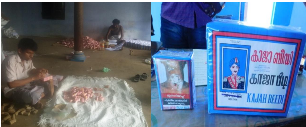
Packaging and labeling process Beedi packet with warning

In Thoothukudi district in a few villages, cutting of beedis was done exclusively by some women, to be collected by the leaf supplier later on. In these villages people do not know how to roll the beedis. These villages were inhabited predominantly by people from the SC community. In Vellore district the practice of supply of raw material and collection of the finished product is done by the agents.