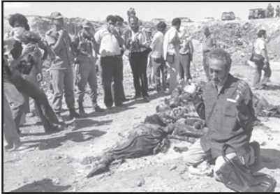
A Turkish Cypriot prays at the scene of an alleged massacre of 86 fellow citizens, Maratha, Cyprus, 1974, investigated by UNFICYP (UNFICYP)