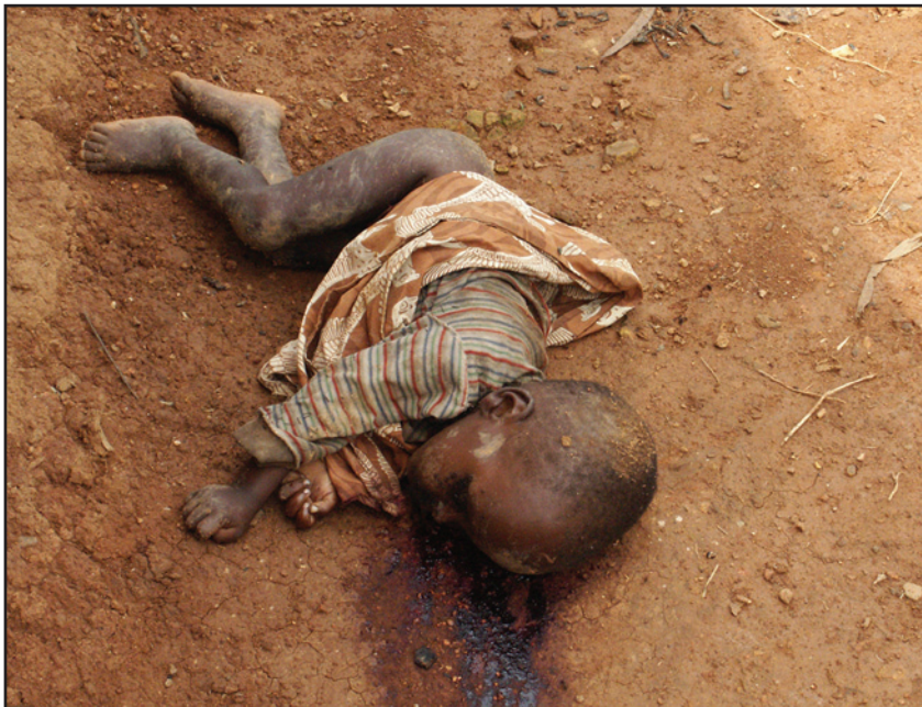
A Murdered Child, 2003, Democratic Republic of Congo - Op Artemis

Although the "Holy Grail" of complete and absolutely final casualty data is yet to be attained, there are now sufficient case examples of high quality casualty recording in conflict to have stopped the argument being about whether it can be done. It can. But, unless states are helped to see more clearly that it is in their interest to do it, and unless international frameworks are developed that articulate the state's responsibility in this matter, inertia will probably result in continuing inaction.