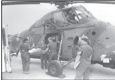
Civilian casualty evacuated by RAF Hel, Cyprus, 1974 (UNFICYP)

Response: Ultimately, high quality recording acts as a reality check on good intentions and statements. Only when the reality matches these, can local armed resistance genuinely be expected to be reduced or averted.