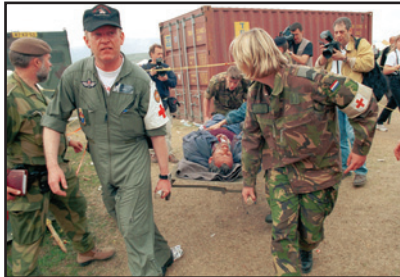
Civilian Casualty - Bosnia

However, not every kind of information is helpful to integrative approaches – for example, when it is massively aggregated and impossible to connect to identifiable events. This has particular pertinence in the Afghanistan theatre, where highly divergent aggregate totals have been published by different interested parties, including NATO, leaving the ordinary citizen with absolutely no means of assessing whether these accounts are reconcilable or not.