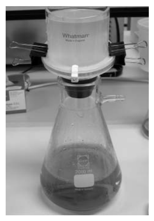
Fig. 1. Three-piece Glass Filter setup with the final wash of Paramecium in amoeba inorganic medium.

cultures, at log phase and with a minimum density of 4500 Paramecium /ml of culture medium, were used for inoculation of new cultures. Using aseptic techniques, 10-15% of the volume of medium to be inoculated was taken from the growing culture and transferred to the flask to be inoculated. The newly inoculated cultures were then grown in the dark at 26°C with no agitation or shaking needed.