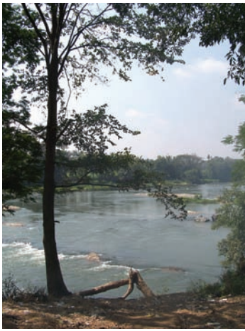
Cauvery River, courtesy of Wikipedia, the free encyclopedia.

ity and rice production in the Cauvery River Basin of Tamil Nadu in India. In addition to the IPRC, the Tamil Nadu Agricultural University (TNAU) in Coimbatore, India, and the Norwegian Institute for Agricultural and Environmental Research (Bioforsk) are participating. The role of the IPRC in this project is to assess the value of high-resolution regional model simulations for describing the future impacts of climate change on the Indian monsoon and the frequency and intensity of drought in the region. The results from this assessment will provide input to the hydrological and crop-weather modeling, which will be conducted by Bioforsk and TNAU. For more information see www.tnau.ac.in/climarice/index.html .