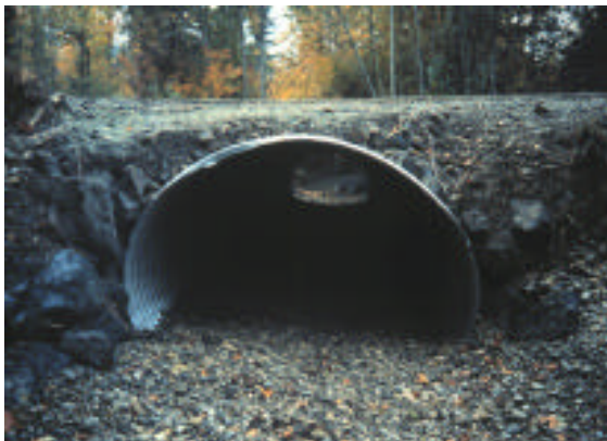
Well-designed culverts allow trout to move upstream and downstream.

Boulders - In-stream boulder clusters can be placed in streams to provide a break in the current and pockets of slow water in which trout can rest between feeding activities. Boulders can be placed within any gradient stream channel where resting cover is limited, and where such in-stream structural components were likely present historically.