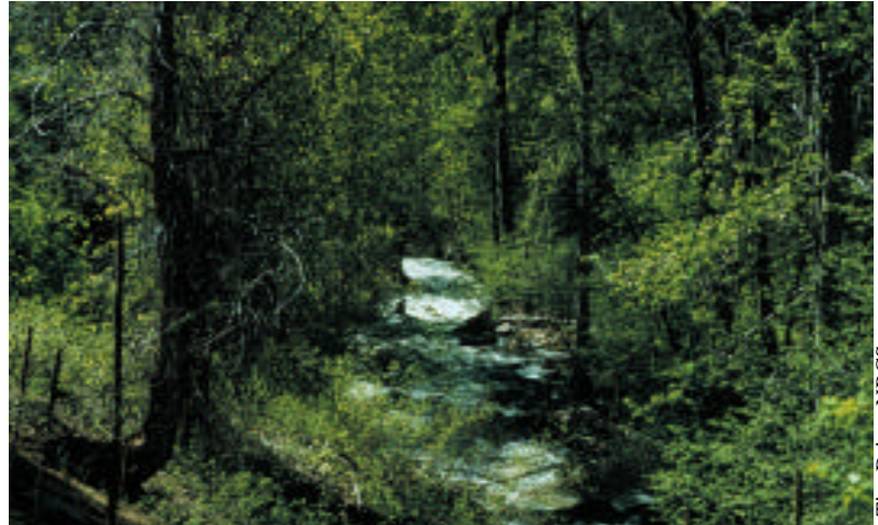
Tim Dring, NRCS

Watershed conditions, streambank stability, channel and streambank gradient levels, and project costs all influence which techniques best suit a particular stream. Instruction and technical assistance from federal, state or local fish and wildlife and land management agencies should be sought before any stream improvements are undertaken. An evaluation of the watershed conditions both upstream and downstream of the proposed improvement project will increase the likelihood that in-stream projects will be successful in improving trout habitat. The text below briefly explains a few common trout stream improvement techniques. Complete diagrams and instruction for these and other trout stream improvements can be found in Trout Stream Therapy by Robert Hunt or the interagency Stream Corridor Restoration Manual (1998). See the reference section for complete citations.