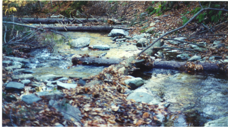
Scott Wixsom, USFS

In-stream wood -- Adding large wood to streams where little or no wood exists because of logging or poor retention capacity can increase pool area and provide cover for trout, especially in low-gradient channels with mobile substrates (see Hilderbrand et al. 1997). In forested streams, logs provide resting and hiding cover for rainbow trout and can be imported from outside of the riparian zone and placed in the stream channel.