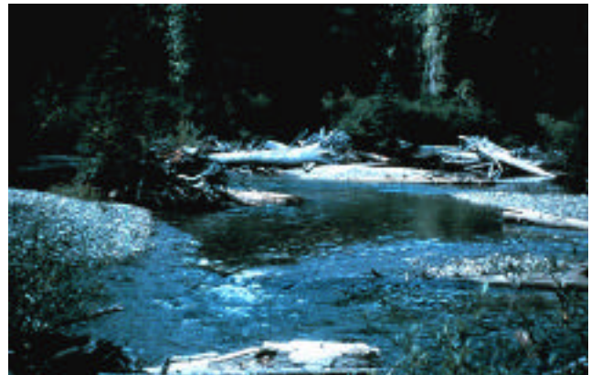
Mark Schuller, NRCS

Ideal interspersion of habitats within a trout stream consists of a complex of cool, clean water; undercut banks with overhanging riparian vegetation; slow-flowing shallow to deep pools; riffles in rapid-flowing water; one to three-inch diameter gravels or pebbles; aquatic weed beds; and submerged or semi-submerged logs or branches, rock piles and root masses that provide shelter. Because rainbow trout are more solitary than social in nature, an abundance of complex habitats partitions and reduces the size of territories, allowing more trout to coexist. In areas of extreme winter conditions, deep pools serve as refuges in iced-over streams and are critical for over-winter survival. Trout inhabiting lakes seek deep, cool water with access to shallows and inlet or outlet streams.