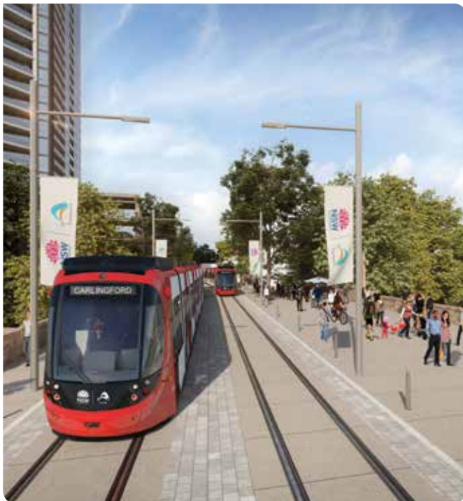
Artist impressions, from top: a pedestrian-only 'Eat Street' ahead of Parramatta Light Rail major construction; the historic Lennox Bridge.

The $2.4 billion Parramatta Light Rail will connect Westmead to Carlingford via the Parramatta CBD and Camellia, revitalising the region and communities along the route. Major construction to deliver the light rail program will begin in 2020, with the network expected to commence services in 2023.