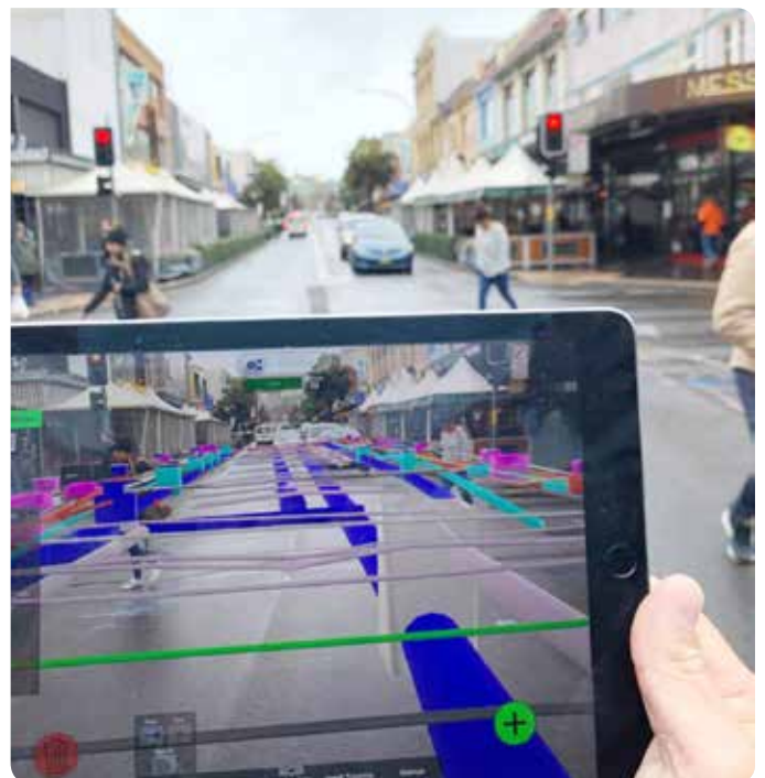
Above: augmented reality technology gives an under-the-ground view of important utility services found beneath Church Street.

This is intended to reduce anticipated noise and impact from the work, compared to street level works. The tunnel will be about six metres below the surface, and launched from a pit on the south side of Lennox Bridge.