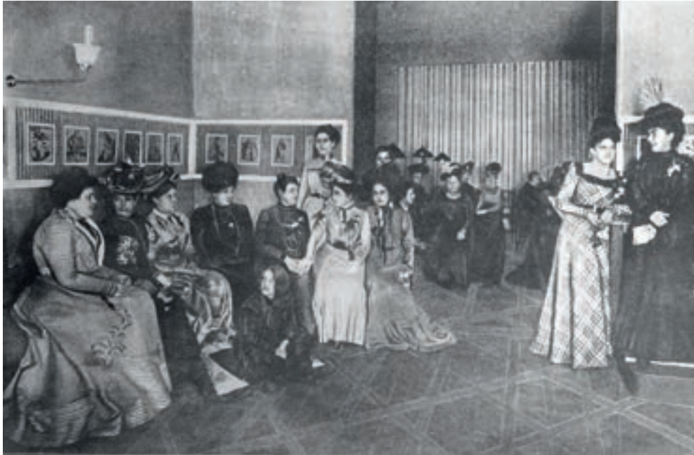
8. Interior view of the Wiener Frauenclub (Vienna Women's Club), designed by Adolf Loos, 1900. Photograph printed in the journal Das Interessante Blatt , Volume 22, November 1900. Austrian National Library, Vienna