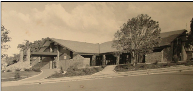
Catholic Church of St Joseph. Corinda, 1968