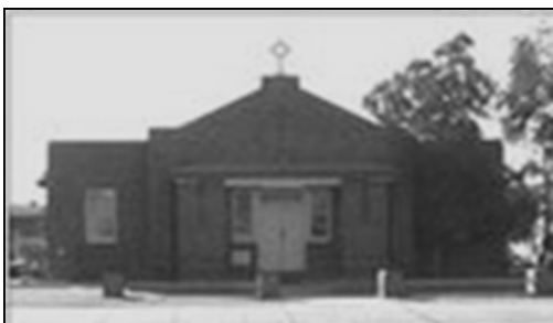
Our Lady of the Sacred Heart Church & School, Darra