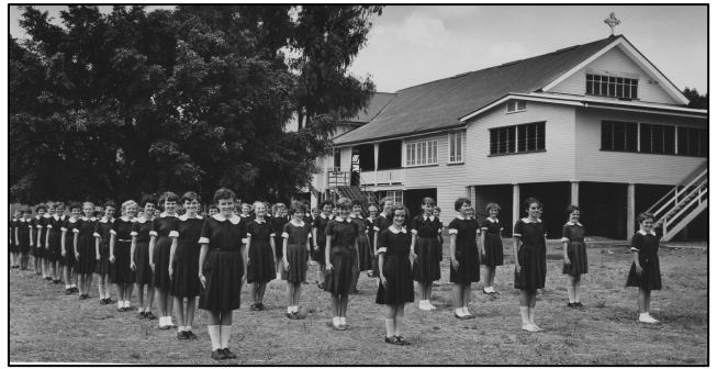
St Joseph's School Corinda. Upper primary students circa 1955.

1972 OLSH College Corinda closes at the end of the school year.