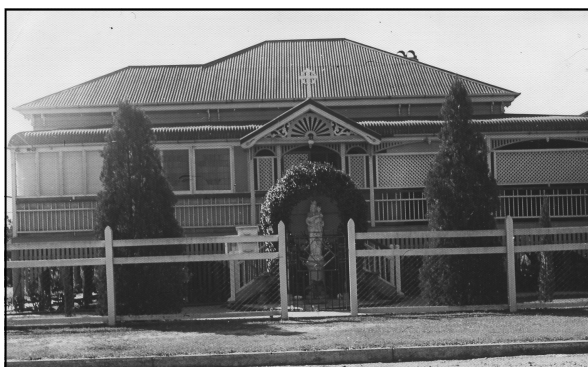
Convent of Our Lady of the Sacred Heart, Corinda circa 1950

As St Joseph's School approaches its second century of education in Corinda, we are grateful to God for the dedication and labours of the Daughters of Our Lady of the Sacred Heart who worked in the school to shape it into a place where the school community strives to share in the mission of Jesus, to bring hope, salvation, justice and peace to all. We thank the lay teachers who have followed in the excellent tradition of the Sisters. We give thanks to the many Priests of the Parish, the parents and parishioners who have supported the school. We offer thanks to God for the thousands of students who have been educated and nurtured in Faith and Love at Corinda. St Joseph's School is an integral part of the Corinda Graceville Catholic Parish and shares in the mission of Jesus to bring love, forgiveness, dignity and salvation to all. May the Sacred Heart of Jesus be everywhere loved. Forever!