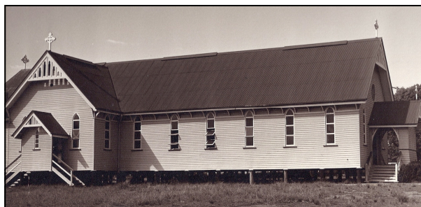
St Joseph's Catholic Church Corinda with extensions built in 1926

1926 Extensions to St Joseph's Church are blessed and opened by Monsignor James Byrne on 18 th July.