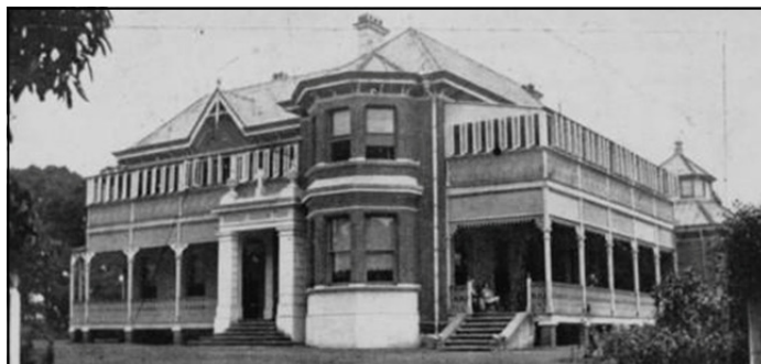
Our Lady of the Sacred Heart College, Whinstanes

1925 Our Lady of the Sacred Heart College Whinstanes is opened as a Junior Boys Boarding School. OLSH Corinda continues to operate for a further decade but the new Whinstanes College, located at College St, Hamilton, allows for expansion and growth.