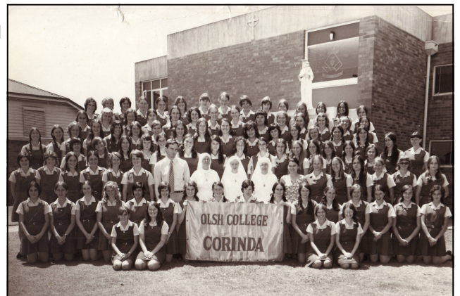
Our Lady of the Sacred Heart College, 1971

1973 St Joseph's Primary school locates some classes and the Principal's Office into the former College building.