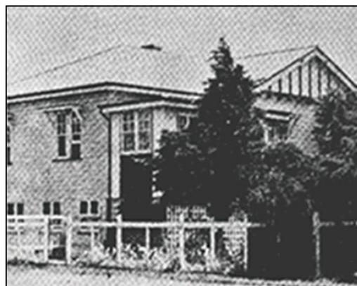
Convent of Our Lady of the Sacred Heart Freneau Park College, Toowoomba

1964 Our Lady of the Sacred Heart College Freneau Park closes.