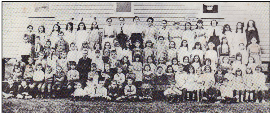
Pupils of St Joseph's School Corinda, circa 1920

1918 Two adjacent properties are purchased by the Daughters of Our Lady of the Sacred Heart in Clewley Street on the 3 rd May, to be used as a junior boys boarding school.