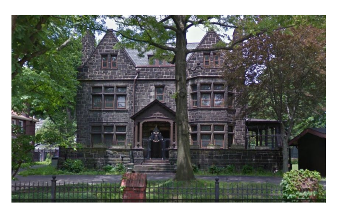
Former Diocesan Center, as it appears in 2016

to have a diocesan center in Pittsburgh<sup>29</sup> and raised money through the Cathedral Fund. The new Diocesan Center at 300 South Dallas Avenue in Point Breeze was purchased and renovated to serve as the bishop's