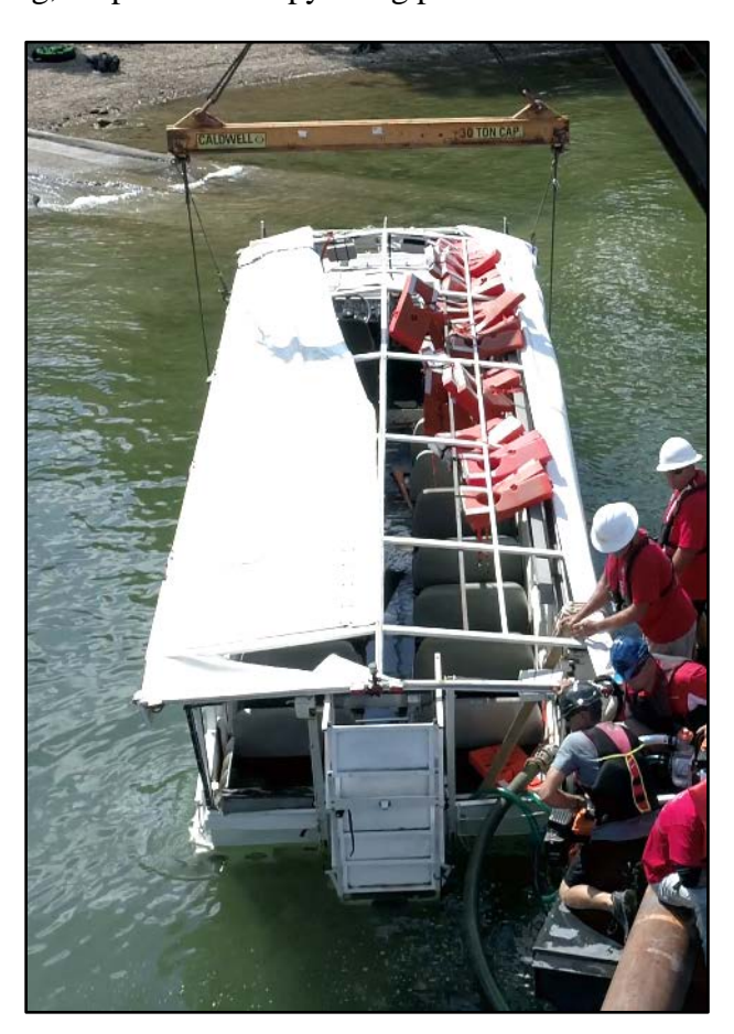
Figure 5. Torn canopy of the Stretch Duck 7 found during recovery operations.

The entire passenger and crew space of the Stretch Duck 7 had been covered by a fixed canopy. Upon recovery of the vessel, the canopy was found torn from front to back (see figure 5 ). It was peeled back over the starboard side but largely remained intact on the port side. The canopy was constructed of vinyl measuring .032 inches thick and pressed into a seam along the horizontal support at the center of the vessel. Underneath the canopy, the Stretch Duck 7 's personal flotation devices (PFDs, commonly called lifejackets) were stored above the seating compartment. All of the PFDs on the port side were found in their stowed position, as well as all but three of the PFDs on the starboard side. With the PFDs in their storage locations above the passengers, vertical egress was blocked during the sinking, despite the canopy being peeled back over the starboard side.