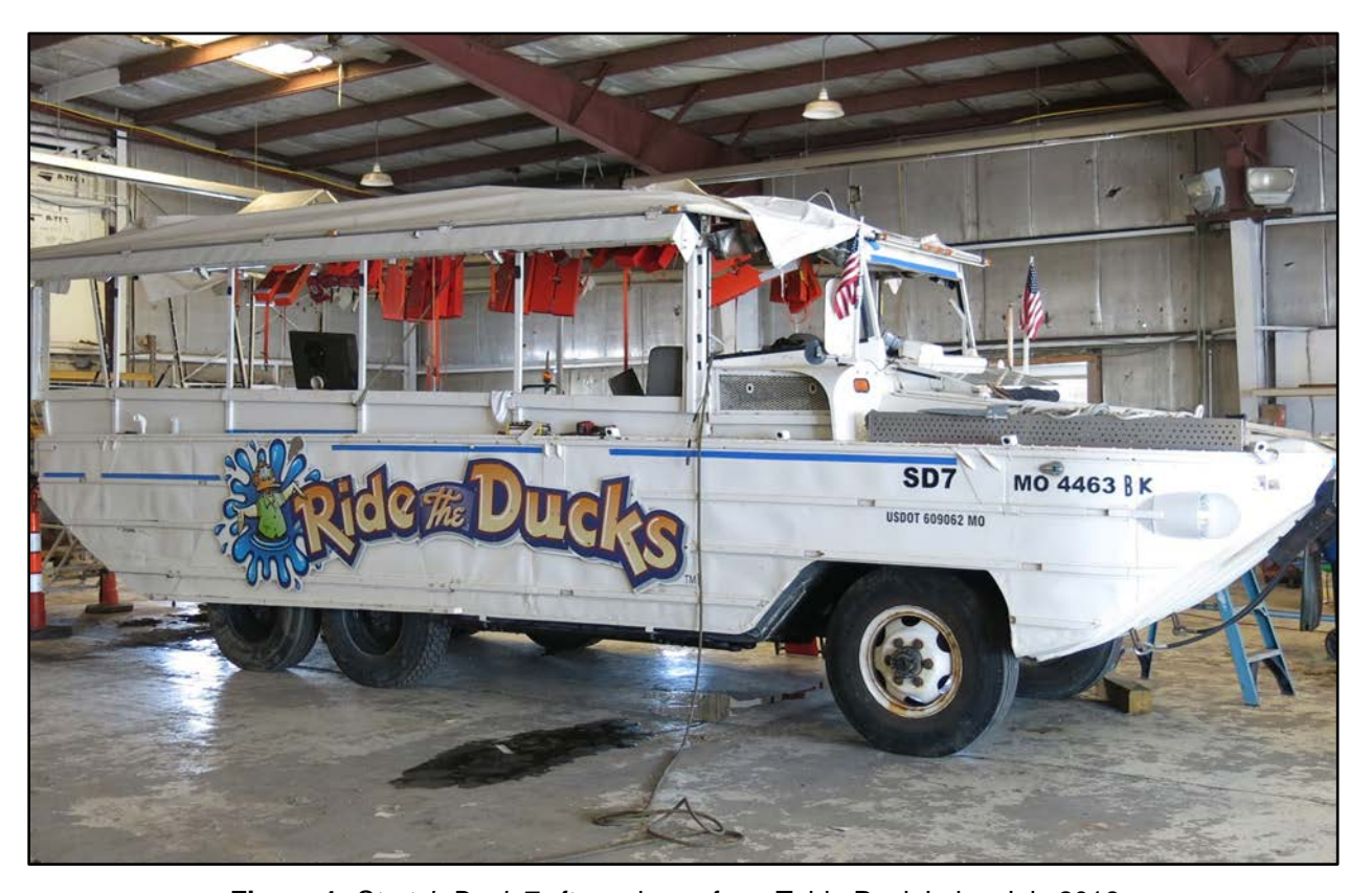
Figure 1. Stretch Duck 7 after salvage from Table Rock Lake, July 2018.

On the evening of July 19, 2018, seventeen of the thirty-one persons aboard the Stretch Duck 7 died when the amphibious passenger vessel (APV) sank during a high-wind storm that developed rapidly on Table Rock Lake near Branson, Missouri. The National Transportation Safety Board (NTSB) is investigating the sinking of the Stretch Duck 7, which originally was built in 1944 as a DUKW landing craft to carry military personnel and cargo during World War II and was then modified for commercial purposes to carry passengers on excursion tours (see figure 1 ).