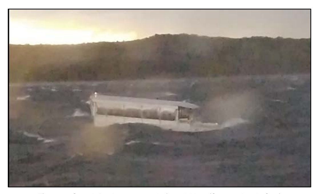
Figure 4. Stretch Duck 7 moments before sinking.

During the waterborne portion of its final voyage, the Stretch Duck 7 was exposed to high winds and waves estimated at 3 to 5 feet. The video recorder on board captured bilge alarms sounding 4 minutes after the vessel encountered severe weather, signaling an ingress of water. About 4 minutes later, the Stretch Duck 7 sank. Witness videos showed the vessel pitching in the storm with white-capped waves covering the bow several times (see figure 4 ). In the forward section of the vessel, the ventilation openings that supplied combustion and cooling air to and from the engine most likely permitted water to enter the engine compartment, from where it would have flowed freely throughout the rest of the hull. The additional water weight would have further lowered the vessel's freeboard and thereby subjected it to more rapid flooding.