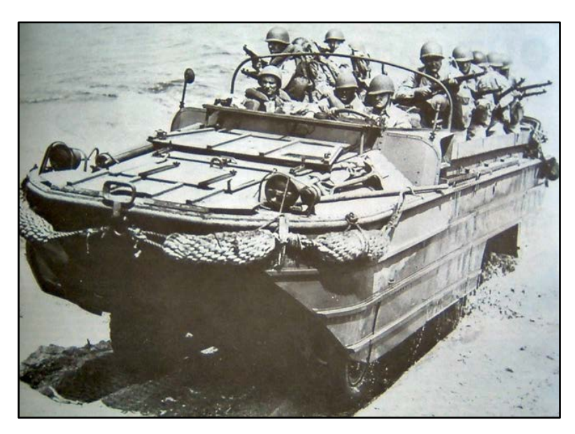
Figure 3. DUKW in military use before conversion to passenger service.

The NTSB has investigated several accidents involving commercial APVs within the United States, including the current investigation of the Stretch Duck 7 . Whether the incident occurred on land or in the water, in 5 out of 6 of these investigations the vessel involved shared similar dimensions and/or characteristics with the World War II-era DUKW amphibious vessel (see figure 3 ). In total, 37 deaths and 104 injuries resulted from these six DUKW-related accidents.