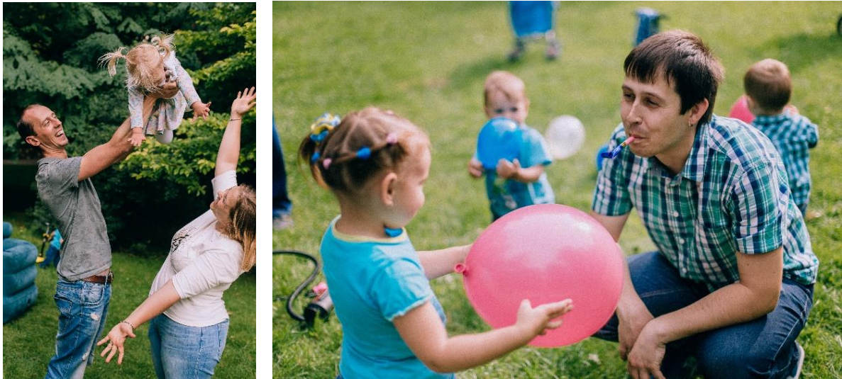
Figures 3 and 4: Fathers, a mother (in their 30s), and preschool-age daughters at play in Lviv city park. (the adults in all photos by author Vasylenko gave verbal consent to include their photos in this article).