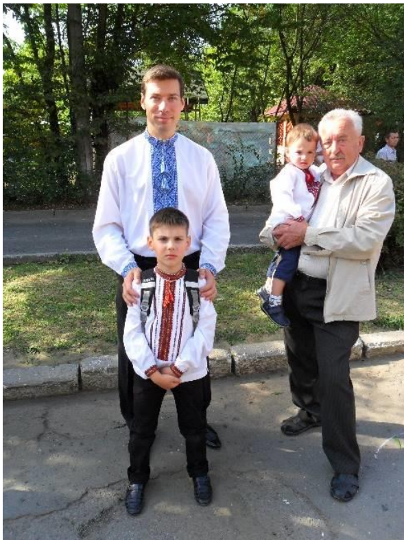
Figure 5. Grandfather (73) with his son-in-law (36) and two grandchildren (ages 7 and 3), Lviv City, marking the [grand]son's first day of school in the first grade.

Most grandfathers enjoyed spending time with grandchildren, and some even observed that parents neglect their duties as primary caregivers for children. For example, a retired city grandfather, age 66, said, "I don't like when my children don't have time for their children. Sometimes I quarrel with them saying that they have to take care of them and teach them. Grandparents are grandparents, but children have to feel that they have parents, too. They leave the kids for us because they don't have time. I tell them they have to look after the children better, because children need to feel what it means to have parents. So I scold them."