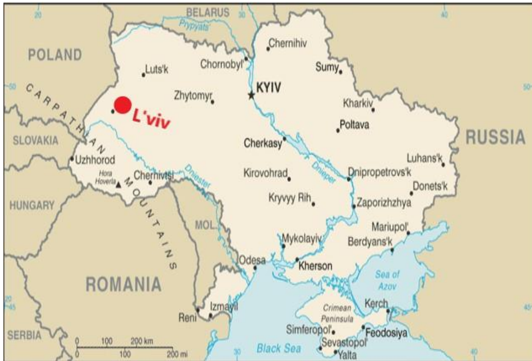
Figure 1. Location of Lviv relative to Ukraine and Central/Eastern European Countries. Figure adapted based on the map at https://www.cia.gov/library/publications/resources/the-world-factbook/geos/up.html .

Soviet state further usurped men's authority by endowing itself with symbolic authority over the family, i.e., the state itself became a ubiquitous father figure. Meanwhile, Soviet ideological control over scholarly activity restricted all family research to that which served the state; in this climate there was no research on fathers or grandfathers whatsoever for several decades.