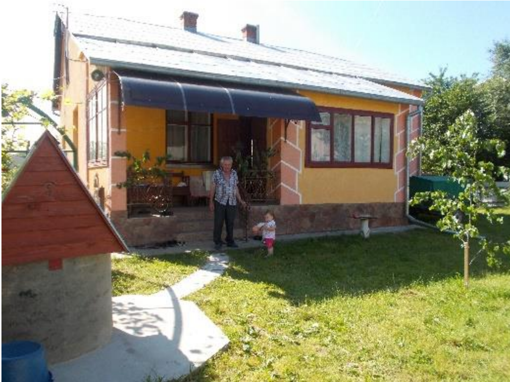
Figure 7. Maternal grandfather (age 73) in back yard of his village summer home, with the middle of his three grandchildren (age 3).