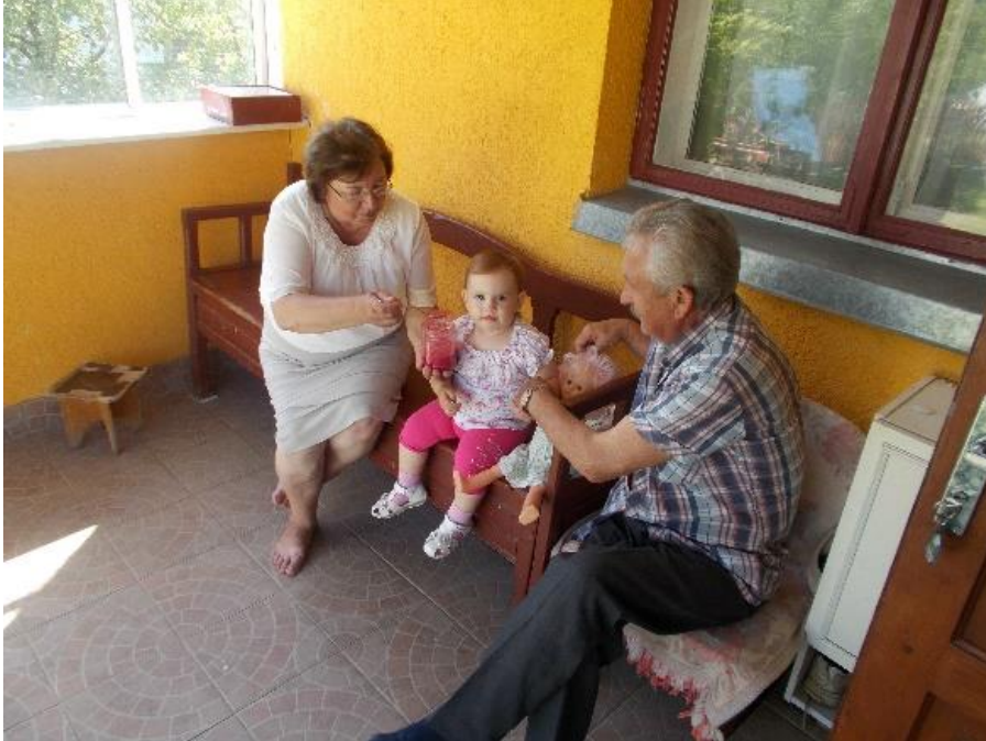
Figure 6. A 64-year-old maternal grandmother and 71-year-old grandfather with their 3-year-old granddaughter, at their village summer home.

relation to Cherlin and Furstenberg's (1986) grandparenting typology (involved, companionate, and remote), it seemed that most grandfathers here were "companionate," with relatively close geographical proximity to the grandchildren, and in that none were involved as primary caregivers to their grandchildren.