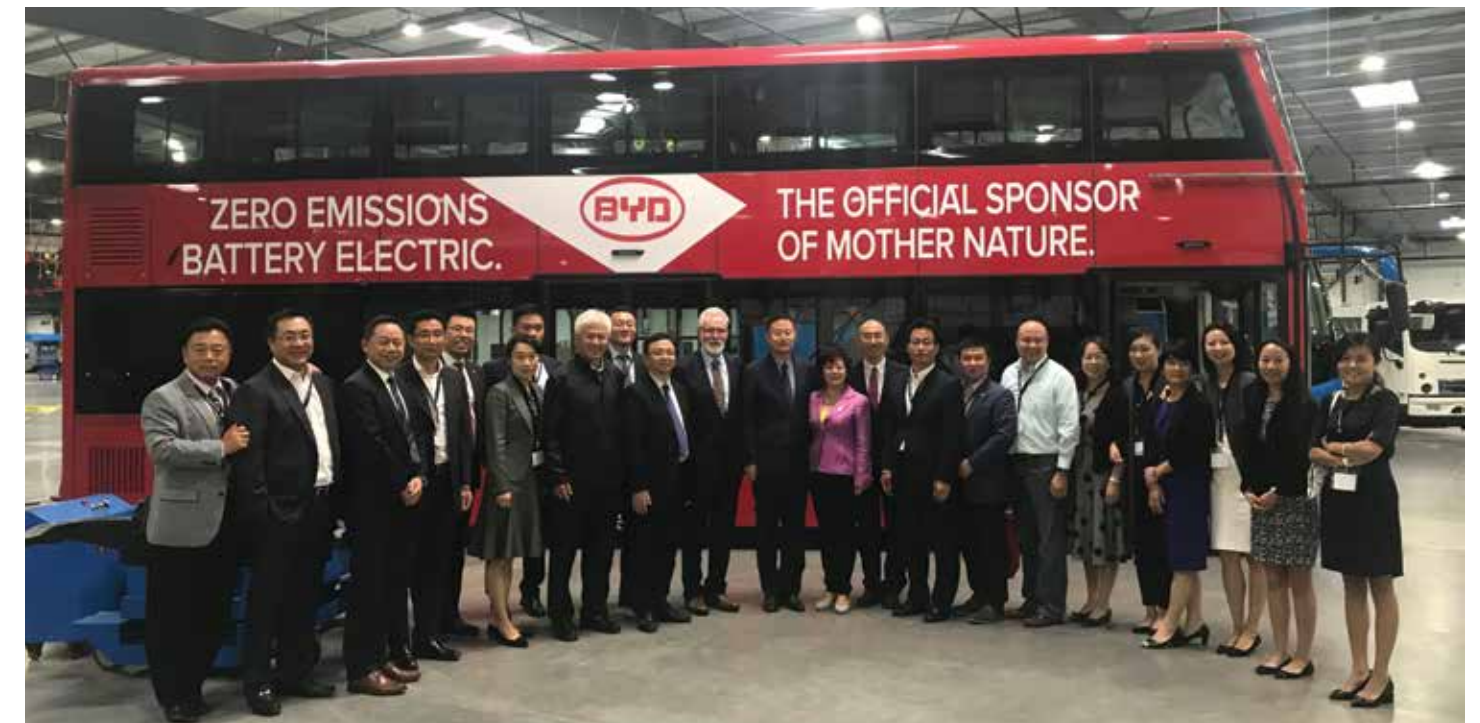
BYD Expansion Grand Opening