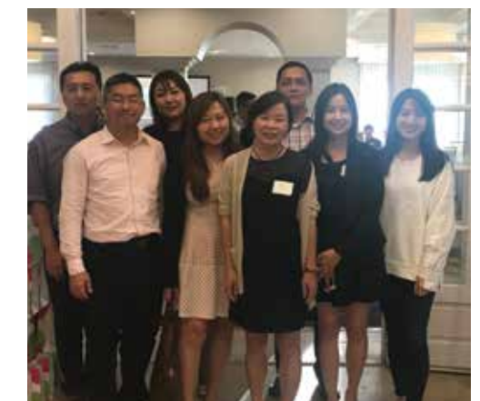
Special Thanks to China Mobile International (USA) 's sponsorship