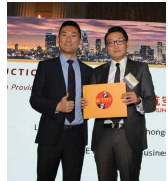
Thanks to Hainan Airlines for donating one round-trip business class ticket.