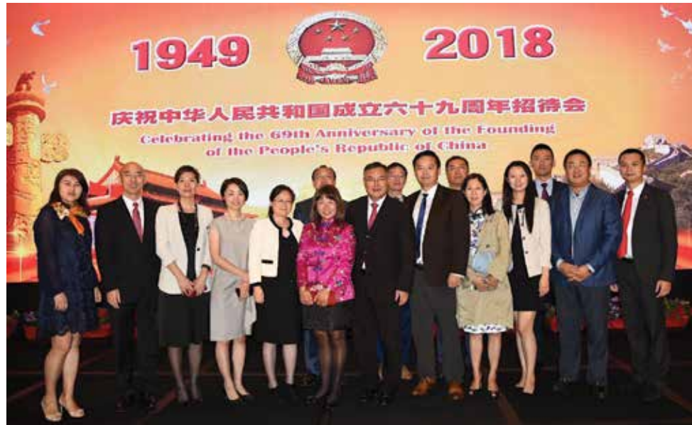
Celebrating the 69th Anniversary of the Founding of the People's Republic of China