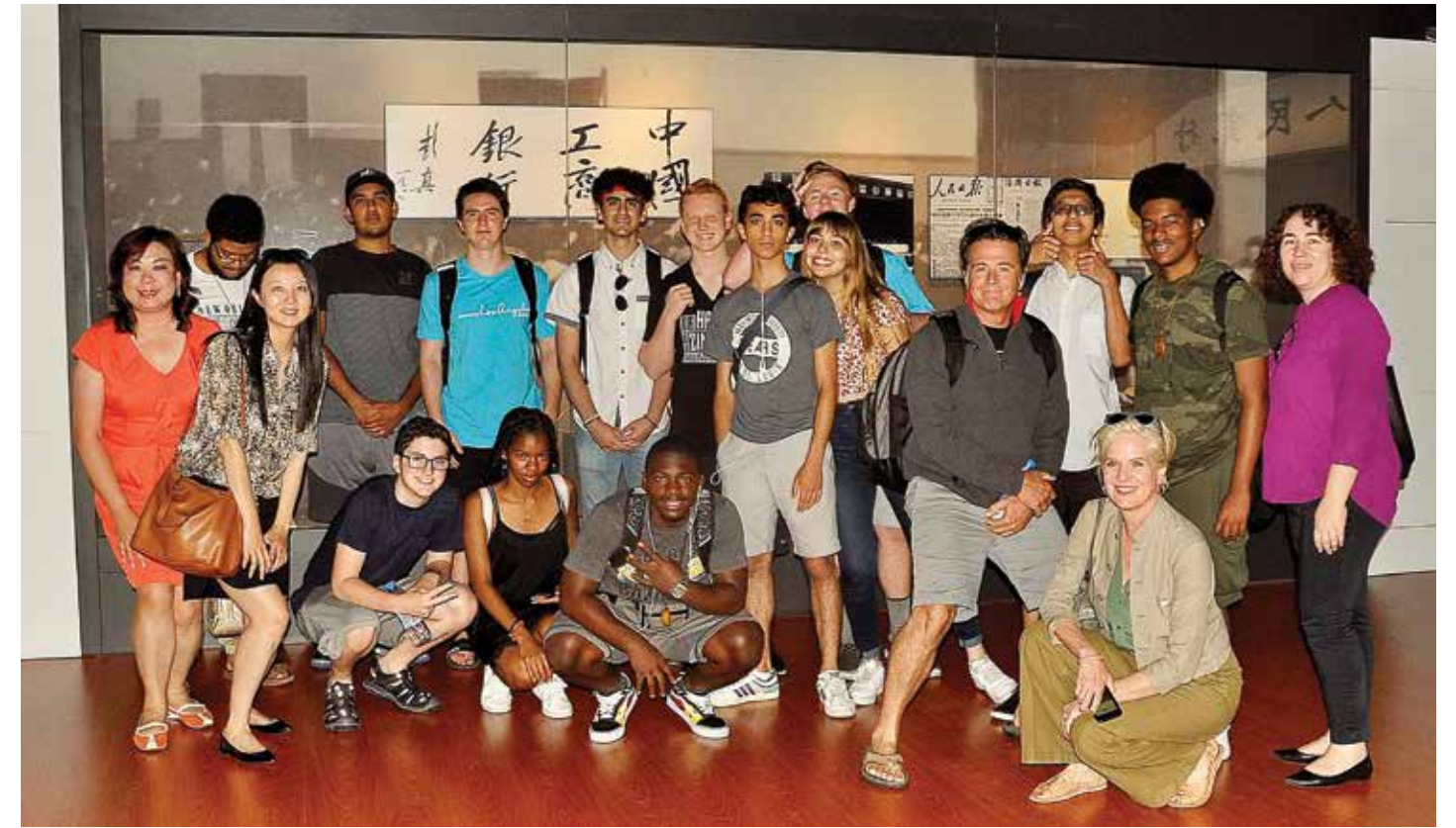
As the largest bank by asset in the world, ICBC focuses on a combination of both domestic and global perspective for its business strategy. Through this event, we hope to bring our sister cities closer in both commercial and cultural communication channels.- ICBC(USA)