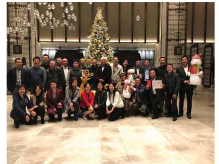
Board Leadership wishes all members a happy holidays.