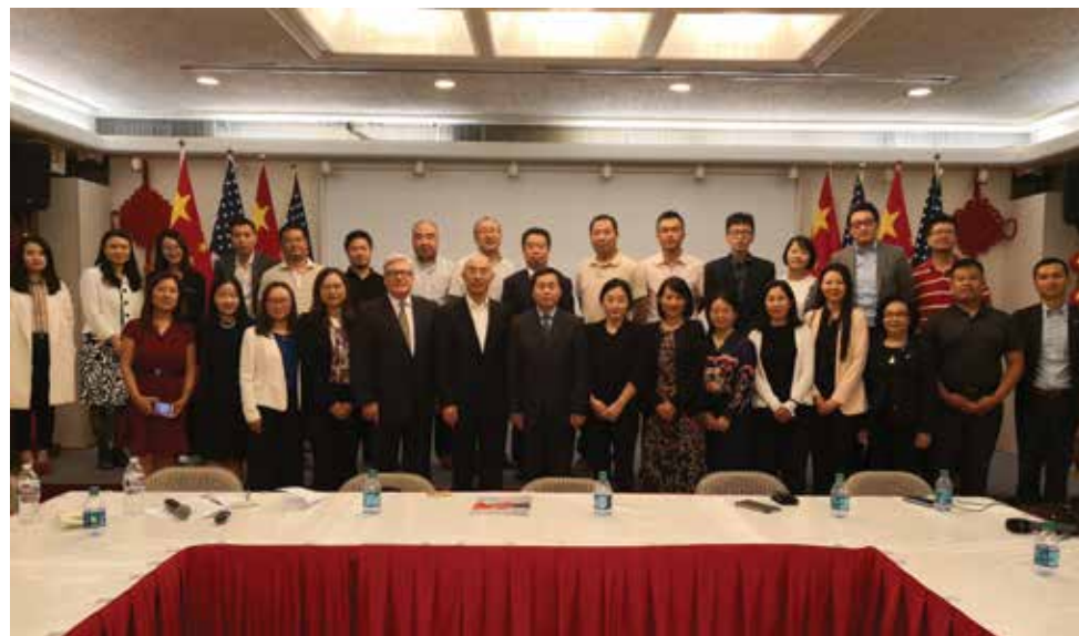
International Arbitration Session by ICC