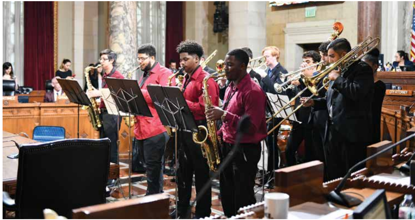
ALEXANDER HAMILTON HIGH JAZZ ENSEMBLE PERFORMED AT LOS ANGELES CITY HALL