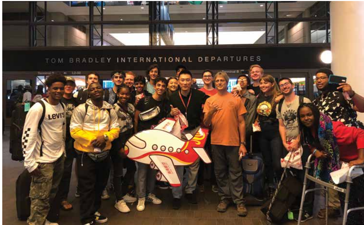
Alexander Hamilton High Jazz Ensemble took Hainan airlines to Chengdu.

Upon the 10th anniversary of entering the US market, Hainan Airlines is proud to sponsor Hamilton High School Jazz Ensemble to Chengdu to celebrate and support cultural exchange between U.S. and China, and realize our vision of flying your dreams."