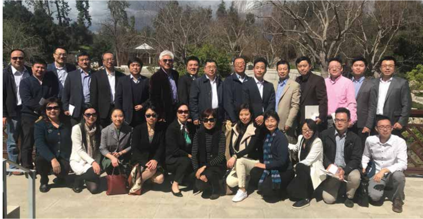
Board Leadership meeting was held in The Huntington Library, Art Collections, and Botanical Gardens.

Board Leadership meets throughout the year to discuss organization's planning goals.