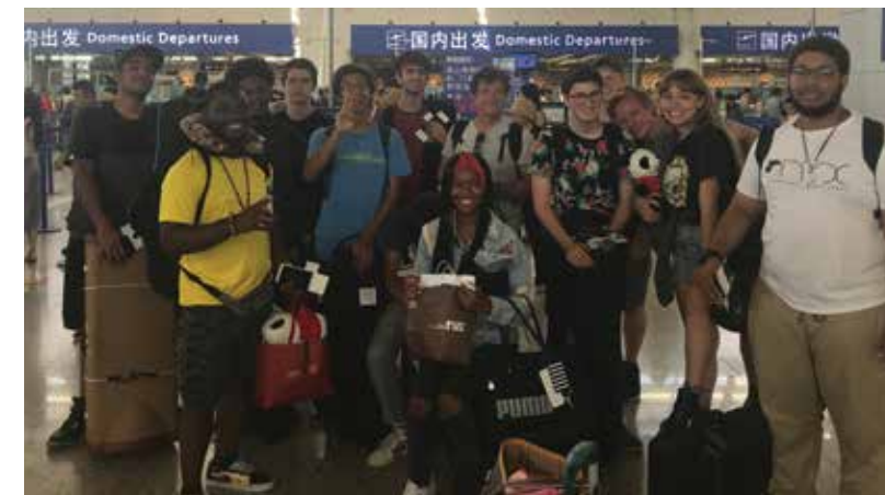
Alexander Hamilton High Jazz Ensemble students spent four days in Shanghai enjoying opportunities to learn about cultural, economic and educational aspects of the most populous city in the world.