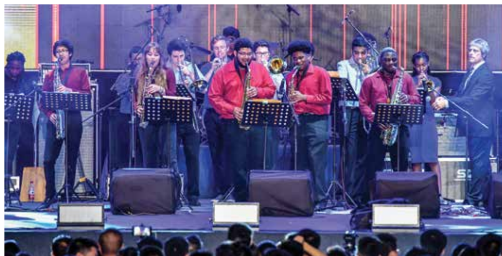
Alexander Hamilton High Jazz Ensemble performed in the 12th annual Sister Cities International Youth Music Festival.