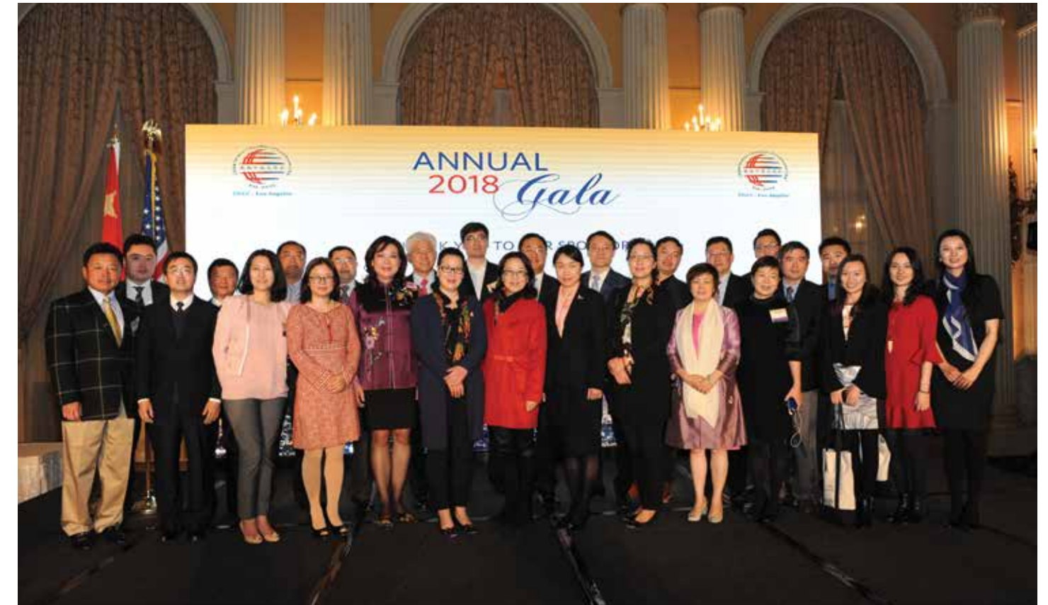
CGCC-Los Angeles Board Meeting and a networking reception for the attendees were held before the gala.