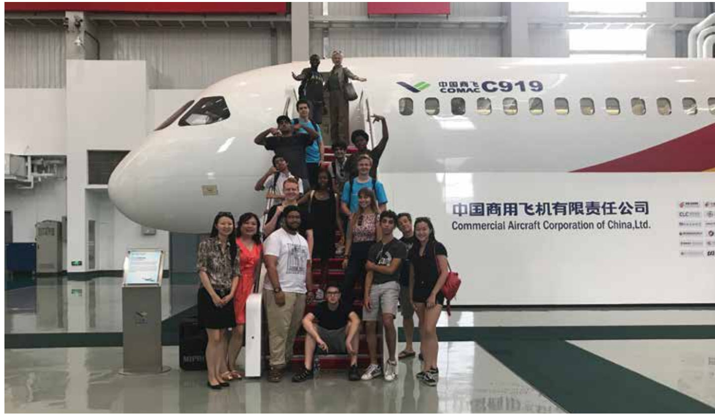
With innovation as the core driver of growth, COMAC America is dedicated to providing opportunities to help young people gain perspectives on how technologies push forward the industry. - COMAC America Corporation