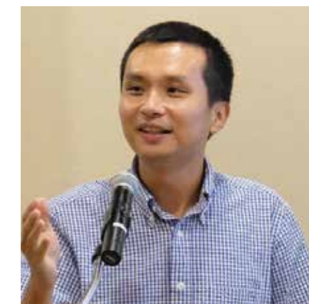
Hao Yuan, Commercial Consul, The Consulate General of The People's Republic of China in Los Angeles