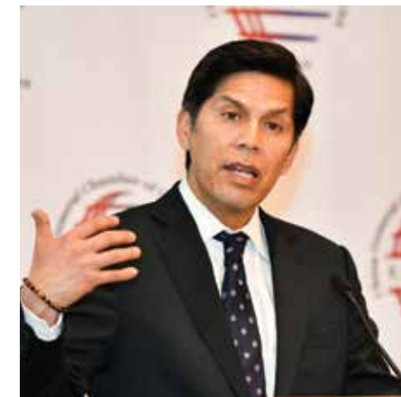
Kevin de León, California Senate President pro Tempore Emeritus