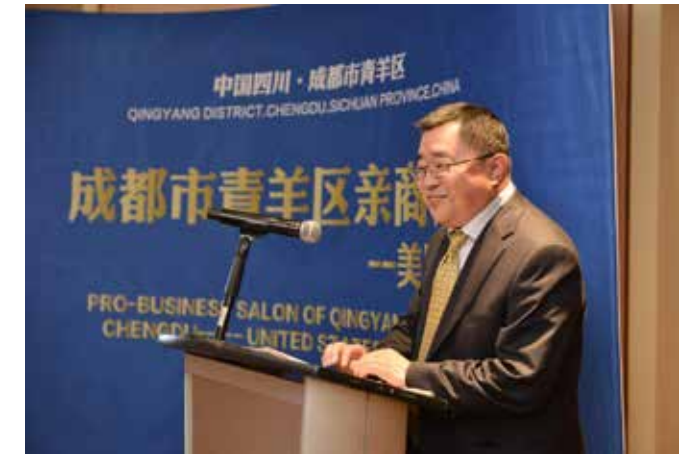
Welcome Business and Government delegation from Chengdu, China