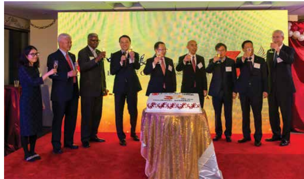
Bank of China Los Angeles Branch Celebrating the 30th Anniversary