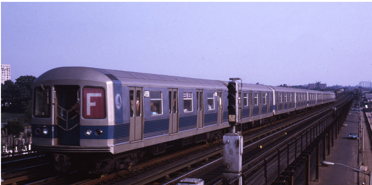
A southbound Culver Express is speeding through the Bay Parkway station on July 18, 1972 with car 4938 on the north end. By the late 1970s, R46s would take over most runs on the F Line and remain as such until the arrival of the R160s.