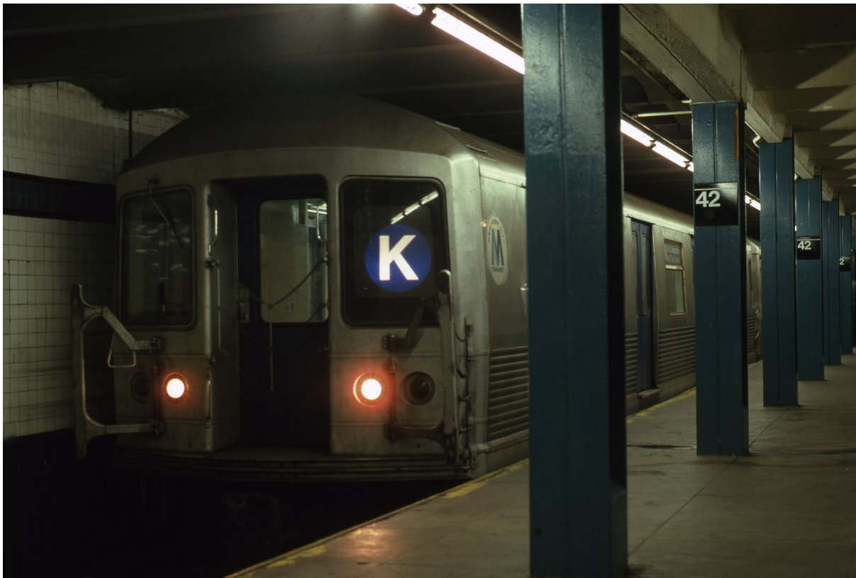
A northbound K train with car 4806 at 42nd Street-Eighth Avenue on December 4, 1988. The K was the replacement for the AA train, but since two-letter designations were now out of vogue, the K designation was created. A photo of the post-rebuilt car 4806 is also included in this issue. The IND version of the K operated from May 6, 1985 to December 11, 1988.