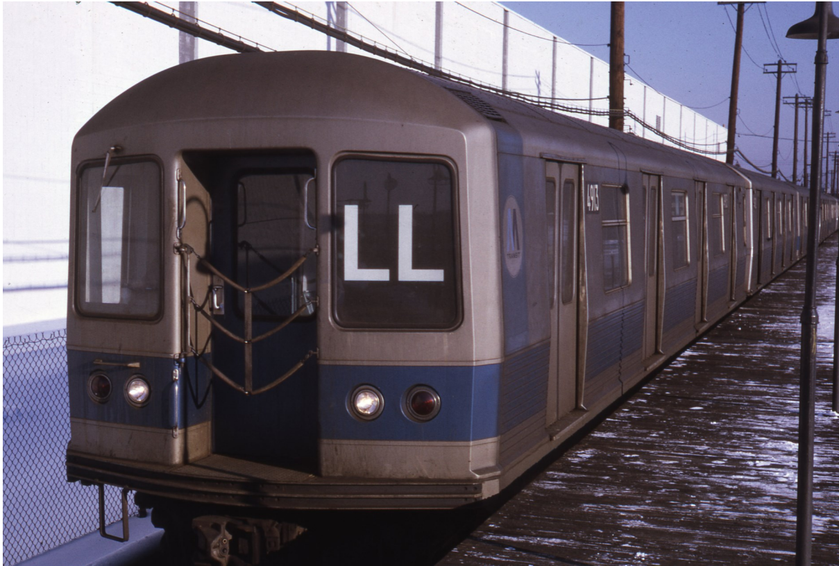
A southbound LL train at E. 105th Street on January 2, 1971. Pantograph gates have yet to be installed. By the mid-1970s, R-42 cars 4852-4949 would be assigned to East New York. This assignment would hold until the early 1980's. Upon rebuilding, all R-42s would be operated out of East New York until the arrival of the R-160s.