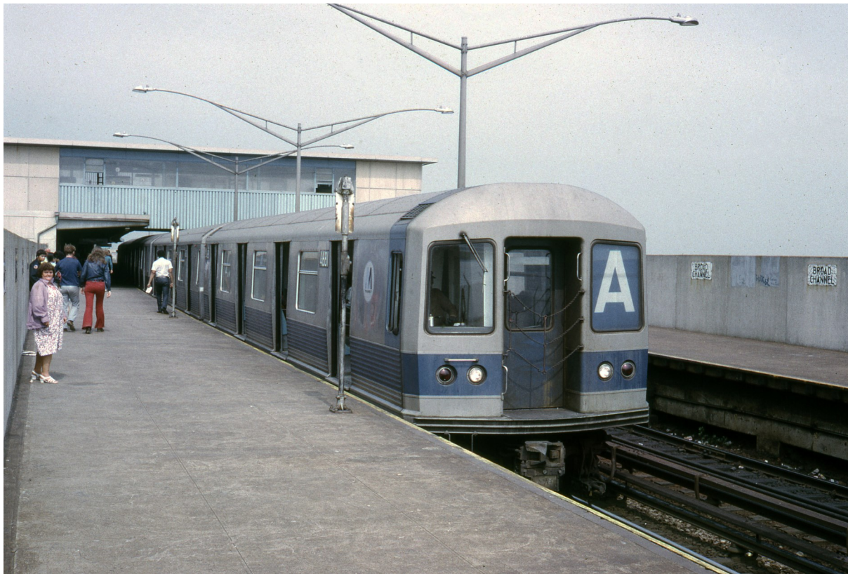
A southbound A train at Broad Channel on September 9, 1972. The A would share cars 4584-4695 with the AA and B until 1977 upon the arrival of the R40 Slants on the A .