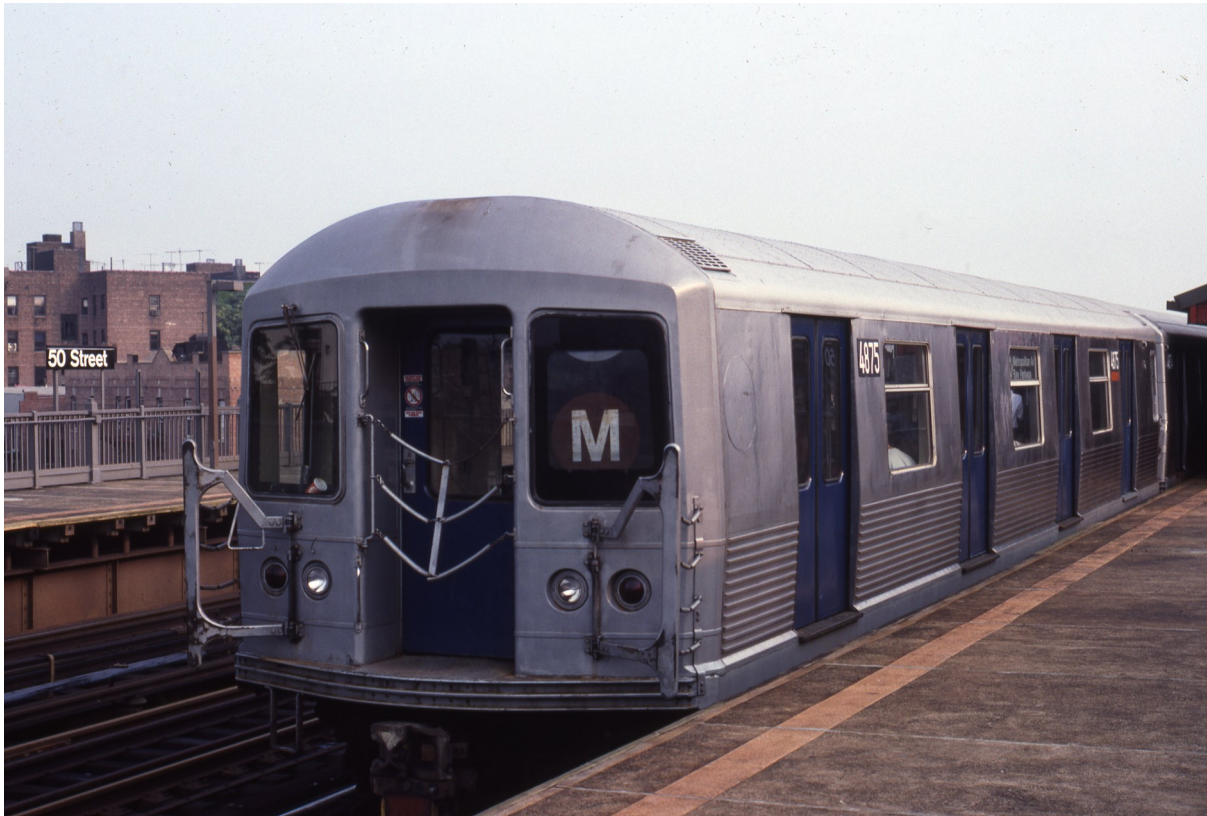
Car 4875 on a southbound M train at 50th Street on the West End Line, July 28, 1988.