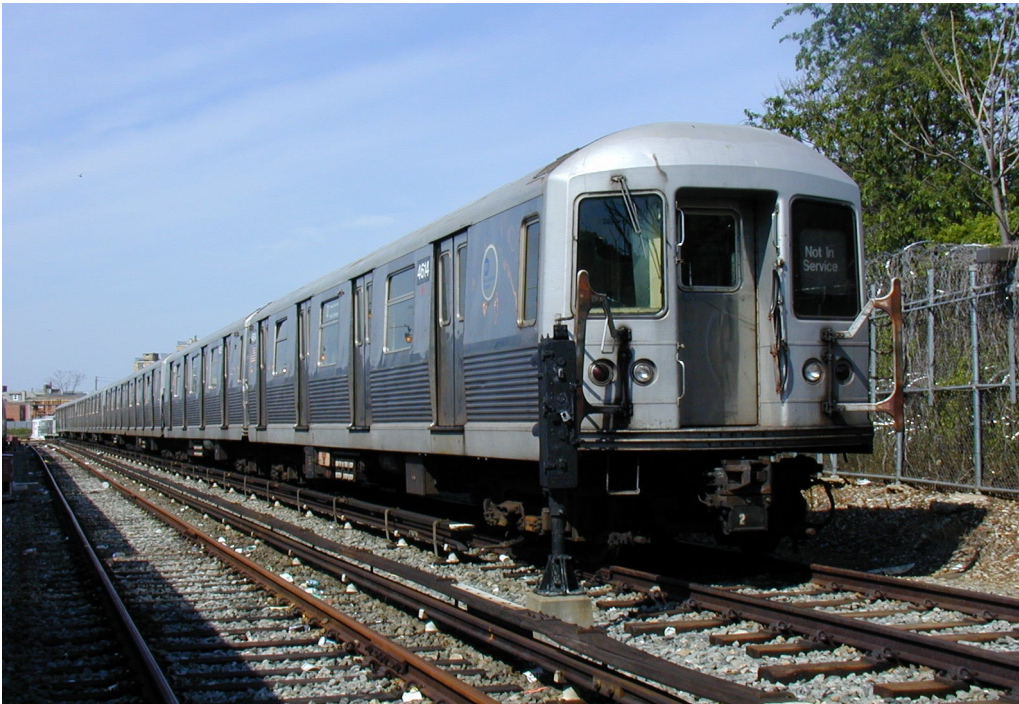
R-42 4614 in Canarsie Yard, June 8, 2002.