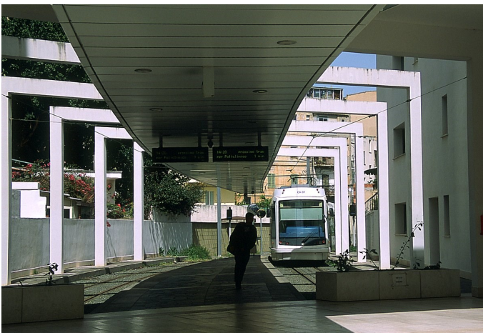
Piazza della Repubblica, the southern terminal of MetroCagliari, contains a center platform serving two stub-end tracks. Even during 10-minute headway periods, it is rare that the left side track is used, which explains its rust. This passenger whisked by me as he ran and just missed a Policlinico-bound tram.

The photos shown below and on the next page follow Route 1 from south to north as far as San Gottardo. While the photographic angles on most of them are similar, each one is included to illustrate various aspects of the line.