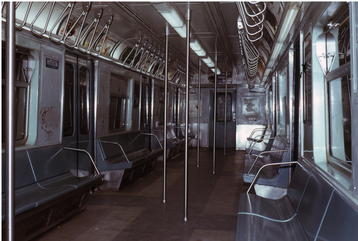
The original interior of the R-42s. This photo of car 4761 in D service was taken on August 11, 1973.