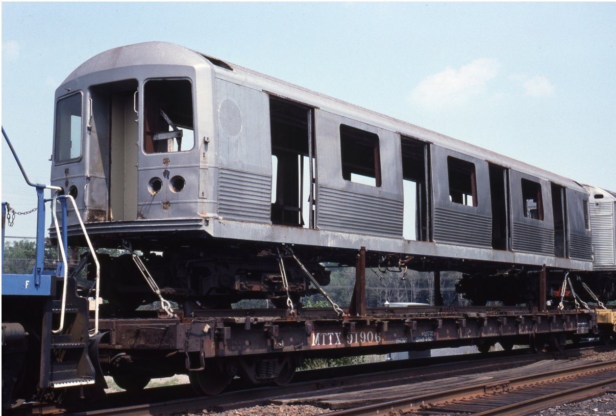
Car 4692 on its way to Morrison-Knudsen via the Metro-North Hudson Line at Otisville, New York. Its trip would continue beyond Port Jervis on the Conrail Line to reach Hornell, New York, where rebuilding would take place.