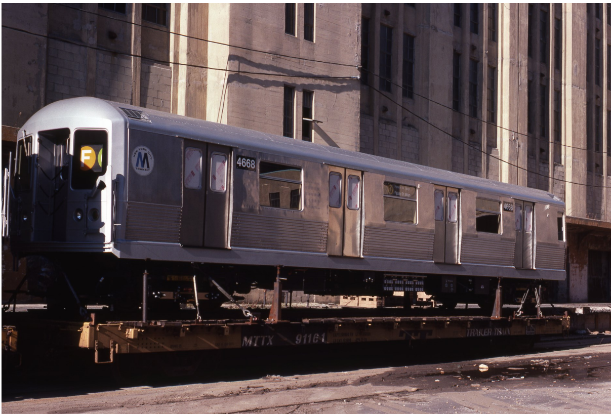
Car 4668 at the Brooklyn Army Terminal upon its return from rebuilding at Morrison-Knudsen. The flatcar will be brought to the South Brooklyn Railway's connection to NYCT at 38th Street between Third and Fourth Avenues. There, the car will be rolled on a ramp down to surface tracks which connect to the West End Line north of the 36th Street station.