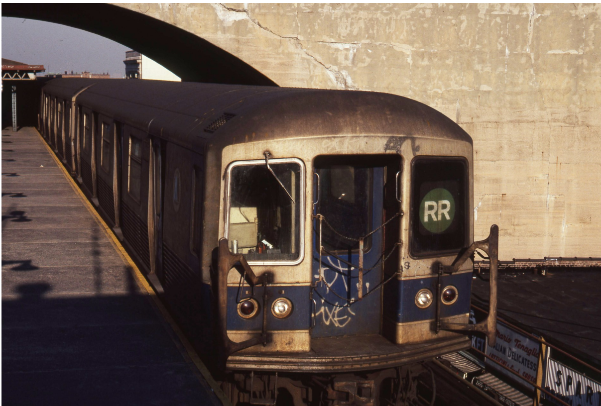
Upon transfer from the N in 1977, cars 4550-83 would receive a cos- metic rehab which also involved the installation of small profile roll signs. These cars joined cars 4808-51, which kept their large profile signs until the early 1980s.