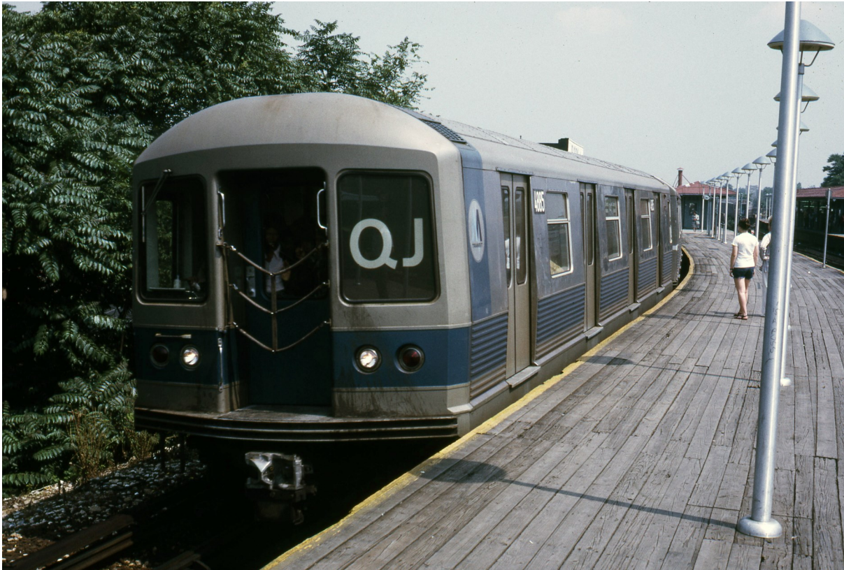
The QJ operated from 168th Street-Jamaica to either Brighton Beach (initially) or Coney Island and operated from Monday, November 27, 1967 to Friday, December 29, 1972. By 1970, cars 4852-87 would carry QB & QJ signs. Initially, lower numbered cars carried these signs, but that is a long story. This photo at Sheepshead Bay was taken on June 28, 1972.