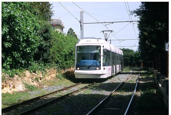
Route 1 is double-tracked from its Repubblica terminal to this point just north of Gennari, the first stop. An inbound tram is shown hurtling through verdant surroundings.