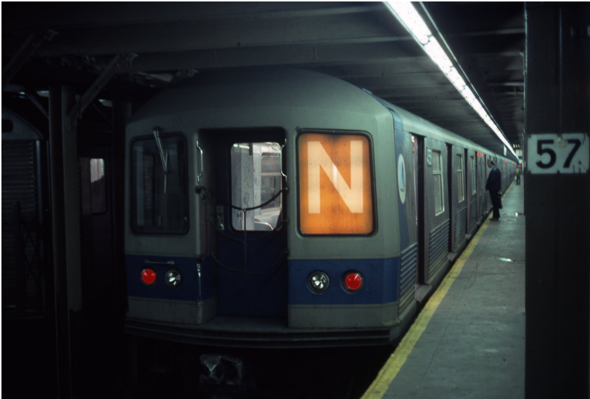
R-42 4558 at 57th Street- Seventh Avenue on April 16, 1976, the terminal for the N at the time. 4550-83 would be as- signed to the N until 1977, upon which the cars were transferred to the RR.