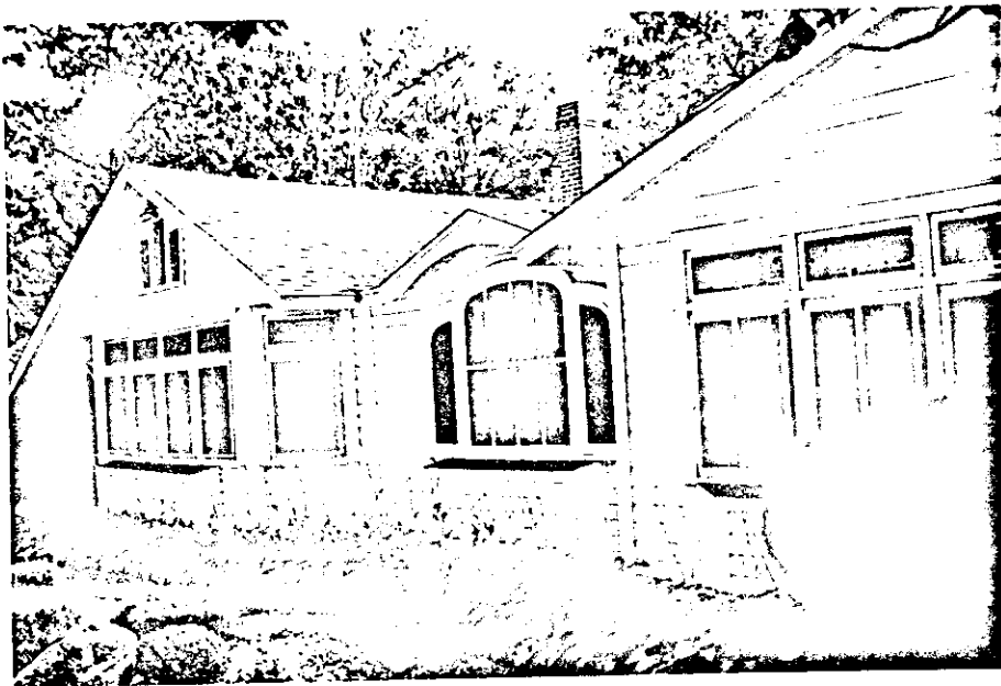
The Albert Campbell House 434 Marshman Highland Park