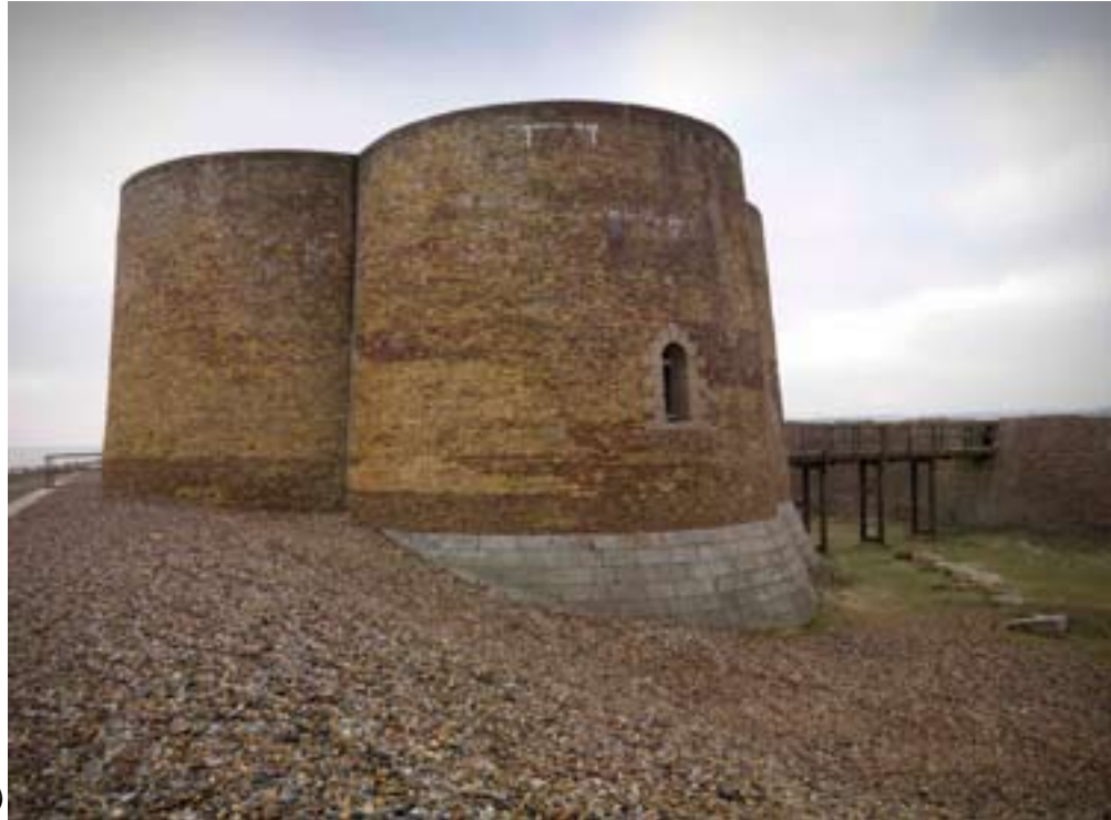
Figure 6: A Photograph of Tower CC, Aldeburgh, Suffolk (NMR: DP029604)

the walls was ceded to the coastguard in 1858 when the present cottages were built. Commander H Georges and Lieutenant J Gutzmer were both stationed in Harwich in 1851 whilst serving with the coastguard. Coastguards were also listed as being stationed at Aldeborough and Clacton Wash at this date so it seems reasonable to suppose that the coastline had been broken into different divisions by this time each administered from a central base ( http://thor.prohosting.com/~hughw/c-guard.txt ). There is no definite proof that the cement produced here was used to construct the Martello Towers but it appears likely.