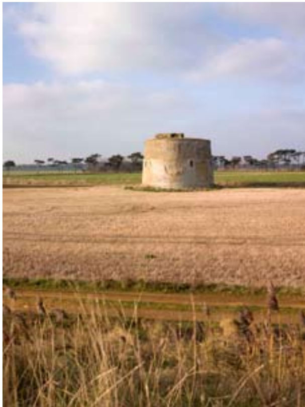
A Photograph of Tower Z, Alderton, Suffolk (NMR: 046358)