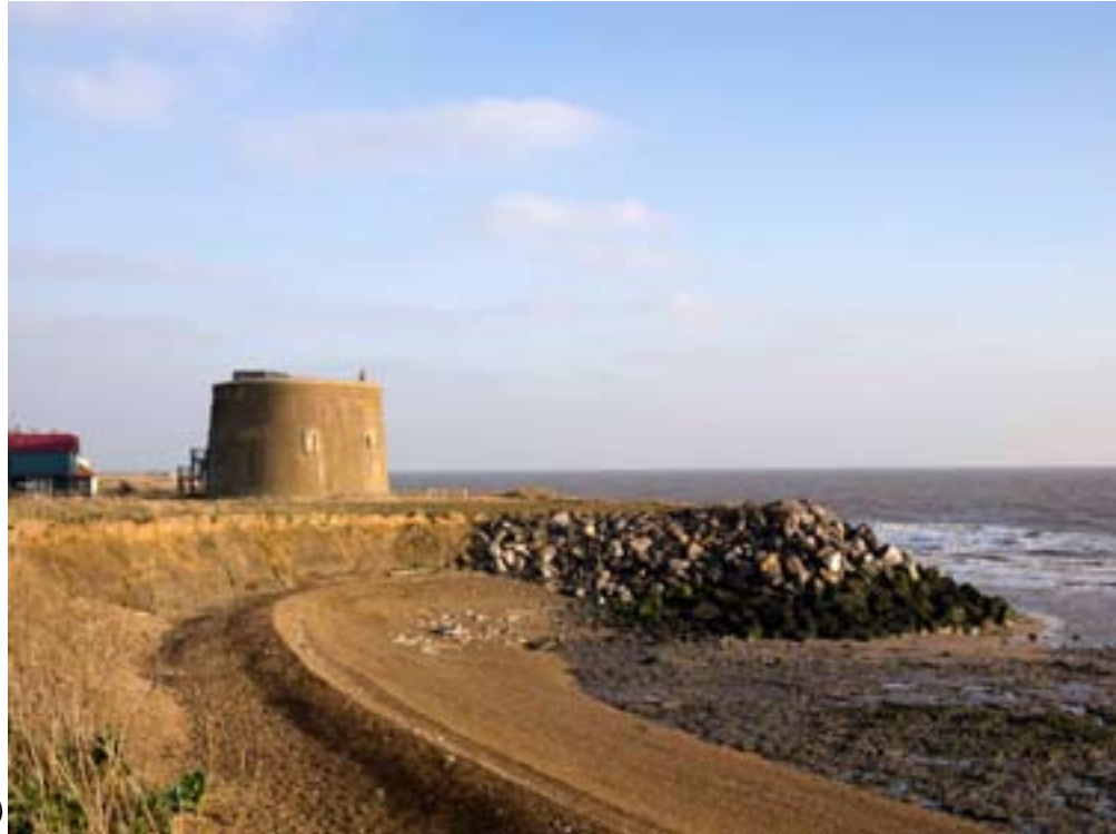
Figure 4: A Photograph of Tower W, Bawdsey, Suffolk (NMR: DP046352)

Tower X, Bawdsey, Suffolk , (NGR: TM 3580 4024) was built with a large ditch surrounding it. There were no traces of this tower surviving; it has been lost due to a combination of coastal erosion, and changing landuse such as the creation of lakes in this area. A coping stone was noted adjacent to this site in 1991 by Robert Carr of Suffolk County Council.