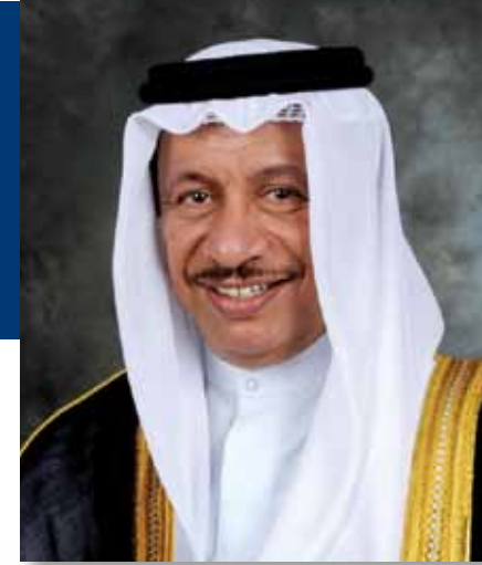
His Highness Sheikh Jaber Al-Mubarak Al-Hamad Al-Sabah The Prime Minister