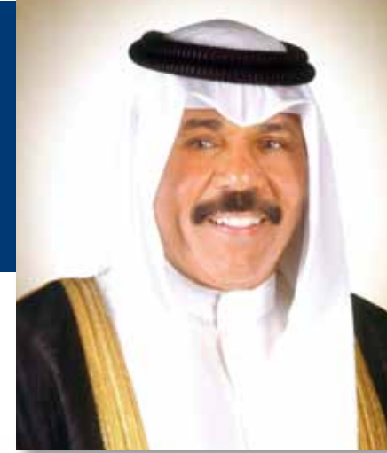
His Highness Sheikh Nawaf Al-Ahmad Al-Jaber Al-Sabah Crown Prince