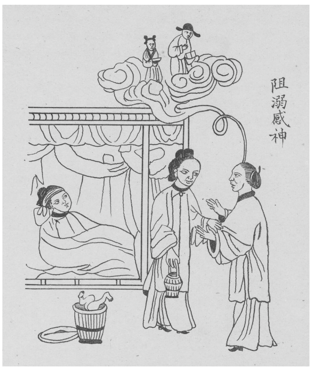
FIGURE 2: "Preventing Infanticide Moves the Gods." Nineteenth-century Chinese woodblock print urging people to prevent infanticide. The French Jesuit Gabriel Palatre collected this and other ephemera related to the issue of infanticide from bookshops in Shanghai. From Gabriel Palatre, L'Infanticide et l'Oeuvre de la Sainte-Enfance en Chine (Chang-hai, 1878), 76.

give no indication of the frequency of the practice, scholars have used the assumption that girls were more likely to be unwanted than boys, and then looked at sex ratios to find evidence of infanticide. These show that girls died in disproportionately large numbers, but not necessarily that they were killed at birth. Some women did kill their infants, but more commonly it seems that children were abandoned in situations