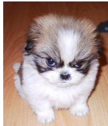
Fig 5: The stego-image