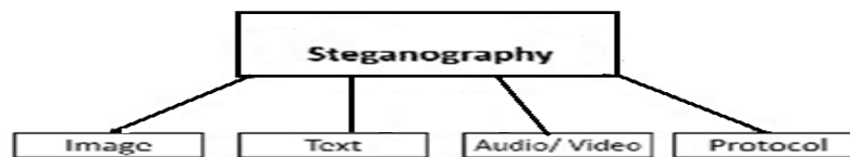
Fig 3: Types of Steganography

Steganography can be used for almost all digital file formats, but the formats those are with a high degree of redundancy are more suitable. Redundancy can be defined as the bits of an object that provide accuracy far greater than necessary for the object's use and display. The redundant bits of an object are those bits that can be altered without the alteration being detected easily [4]. Image and audio files especially comply with this necessity, while research has also uncovered other file formats that can be used for information hiding. There are four categories of file formats that can be used for Steganography shown in fig. 3.