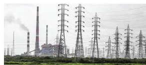
The ruling Law and Justice Party (PiS) promised last year that households would not be hit by increases (ET Energy)

New power prices have not yet been approved for Poland's biggest energy group, State-run PGE. The ruling Law and Justice Party (PiS) promised last year that households would not be hit by increases despite rising carbon emission costs and