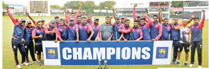
Victorious Chilaw Marians celebrate with the trophy.