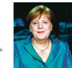
German Chancellor Angela Merkel gives a New Year's speech at the Chancellery in Berlin, Germany

"So we have to do everything humanly possible to overcome this human challenge. It is still possible," Merkel said. "At 65, I am at an age at which I personally will no longer experience all the consequences of climate change for what I believe in for politicians do not act," the Chancellor said. "It will be our children and