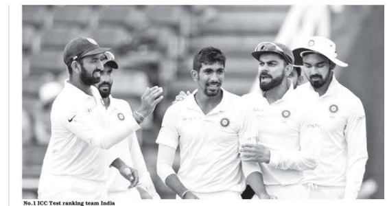
No.1 ICC Test ranking team India