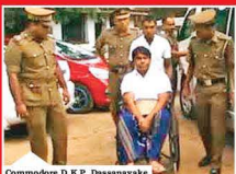
Commodore D.K.P. Dassanayake