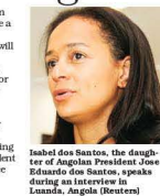
Isabel dos Santos, the daughter of Angolan President Jose Eduardo dos Santos, speaks during an interview in Luanda, Angola

She wrote on Twitter late on Monday: "I would like to leave a message of tranquility and confidence to my teams. We will continue, everyday, in every business, doing our best and fighting for what I believe in for Angola. The road is long, the truth will prevail. United we stand stronger." Ranked in Africa's wealthiest woman by Forbes, she chaired State oil company Sonangol before being sacked in late 2017 by President Joao Lourenco, who has since launched a crackdown on corruption.