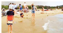
A crowd of people at the beach evacuate from the bushfires at Batemans Bay, Australia

Thousands swarmed to beaches on Australia's East Coast on Tuesday, to escape fierce wildfires breaking down on several seaside towns, as the Government reacted.