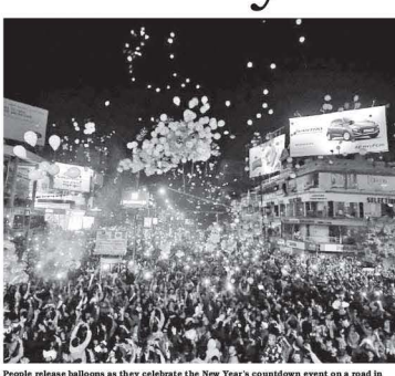
People release balloons as they celebrate the New Year's countdown event on a road in Ahmedabad, India