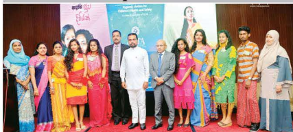
Minister of Small Medium Enterprise and Enterprise Development, Industries and Supply Management, Wimal Weerawansa said present Government was ready to give a helping hand to those engaged in manufacturing apparel items with natural products. He said the present Government will pay more attention to youth aid to all those who show prowess at turning out garments to natural products. Weerawansa was speaking at an event organised by the Sri Lanka Institute of Textile and Apparel in Colombo recently.