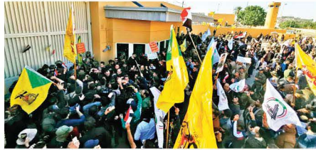
Protesters and militia fighters gather to condemn air strikes on bases belonging to Hashd al-Shabahi (paramilitary forces), outside the main gate of the US Embassy in Baghdad, Iraq

Qais al-Khazali, leader of the Iranian-backed Asaib Ahl al-Haq militia, and many other senior militia leaders were among the protesters. Kataba Hezbollah flags were hung on the fence surrounding the building.