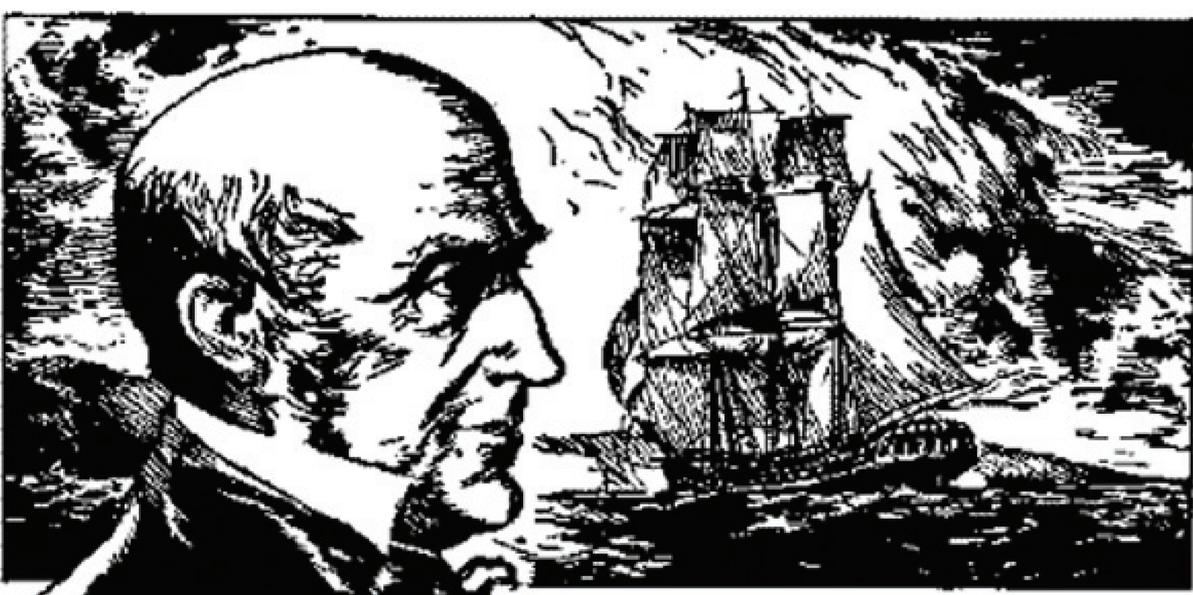
PHILLIP PARKER KING

Cape Londonderry belongs to indigenous lands which have been recognised as having native title since 2012. Since the 1970's Aboriginals have been moving from large settlements back to ancestral homelands reclaimed from the government. This has resulted in healthier communities with lower rates of obesity, diabetes and alcohol related problems. Today 21% of Australia's estimated 670,000 indigenous peoples live in remote areas like Cape Londonderry-