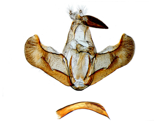
Fig. 2. Male genitalia of D. libanotidella .