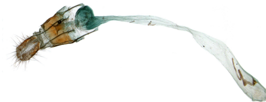
Fig. 3. Female genitalia of D. libanotidella .