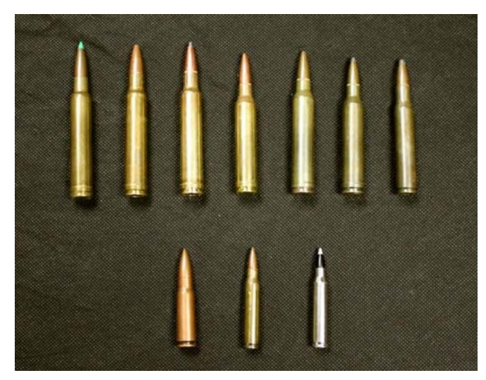
Figure 10. Big game hunting and military ammunition are high velocity and designed to retain bullet stability for delivering major destructive kinetic energy at longer distances. The top row is typical big game hunting ammunition, ranging on the left a 300 Weatherby magnum to the right a 30.06 Springfield. On the bottom row is typical military ammunition, on the left, an AK47; the middle, an M-4; and the right, an AR15 with a Teflon jacketed bullet.

The semiautomatic rifle, like the semiautomatic handgun, uses the recoil of the fired round to load the next round into the chamber. The semiautomatic rifle fires a round each time the trigger is fired until the magazine or clip is empty. Assault rifles are semiautomatic or fully automatic. An assault rifle is shoulder fired and uses intermediate-sized cartridges in a clip or magazine and may have selective fire between semiautomatic,