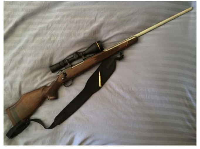
Figure 9. Bolt action rifle, 300 Weatherby magnum rifle, typically used for wapiti hunting.

shell, and loading the next round into the chamber and barrel. Modern-day semiautomatic pistols have a double-action capability. If a round has been chambered already and the hammer is in the uncocked position, a long pull of the trigger in one action will cock the hammer and send it forward with one long pull. After discharging the first round, the gun is then ready to be fired with a short pull as the discharging and recoiling process cocks the hammer and loads the next round simultaneously. Thus, with a semiautomatic handgun, all the rounds in the bullet can be fired as fast as the trigger can be pulled until the rounds in the magazine are spent. Highcapacity magazines that can hold more than 10 rounds were federally banned from manufacture in the United States in 1994, but this ban was allowed to expire and has not been legislatively renewed at the federal level. Eight states currently have bans on these magazines. Consequently, most pistols sold in the United States can hold 7 to 17 rounds, but high-capacity magazines holding up to 30 rounds are easily available.