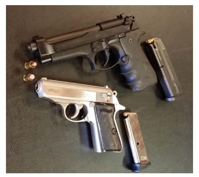
Figure 8. Semiautomatic pistols. Top gun is Baretta 92FS Brigadier, similar to the weapon used in the military. Bottom gun is Walther PPK, which is small and concealable, popularized in Ian Fleming's novels featuring James Bond 007.

the shooter to pull the trigger (long pull), which cocks the hammer and fires the gun, performing a double action with just one pull of the trigger. A double-action revolver can also function as a single-action revolver when the hammer is cocked back against the spring and the pull of the trigger (short pull) sends the hammer forward striking the pin.