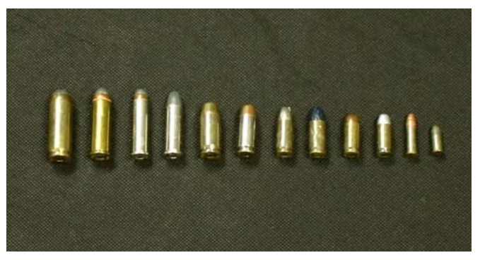
Figure 6. Handgun ammunition is considered low velocity and designed for short-range targets. The bullets vary widely in design; the left is a 50 cal magnum; the right, a 22 cal short.

The .380 is a round used in a semiautomatic handgun that is most well-known for its use by James Bond in the 007 movies. The .380 bullet is similar in diameter to the 9-mm semiautomatic handgun used by law enforcement and the military. Although the diameter may be similar among various bullets, the length and weight of the bullet and the amount of propellant are not normally distinguished in the nomenclature. Ultimately, this equates to the muzzle kinetic energy being different between the .380 and the 9-mm round (Fig. 5).