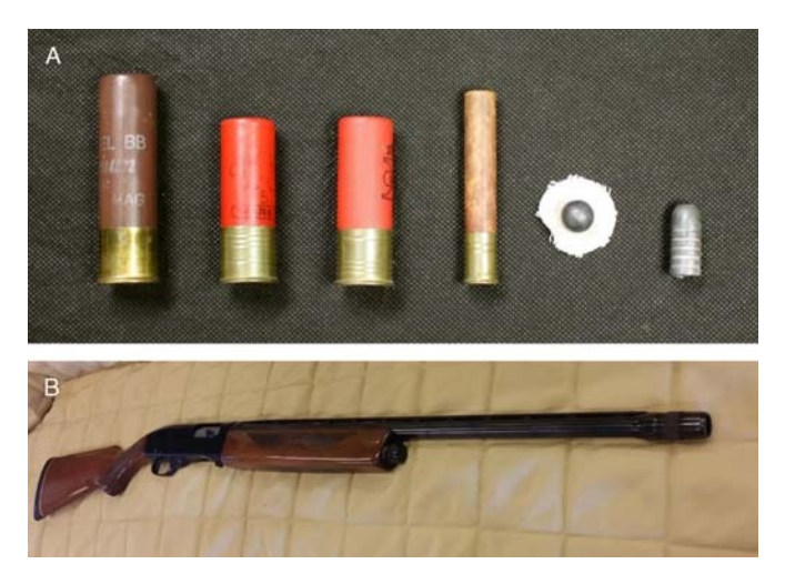
Figure 12. A , Shotgun ammunition usually contains multiple pellets, varying considerably in number and size, which are designed for short-range targets. On the right are 50 cal lead slugs used in muzzle loading rifles. B , Sears-Roebuck semiautomatic shotgun.

of the barrel decreases (Table 6). The most commonly used shotgun shell is the "birdshot" consisting of hundreds of small lead pellets. "OO" double ought buckshot contains only nine pellets, and each has the potential wounding equivalent of a small handgun round, and a "slug" is one large projectile.