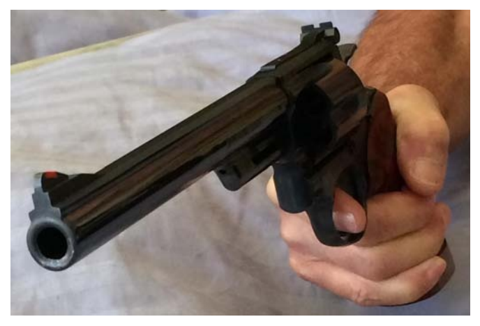
Figure 7. This is a 44 magnum revolver handgun, also known as "Dirty Harry," and known for its relatively high muzzle velocity.

Revolvers have a revolving cylinder containing multiple chambers<sup>5,6</sup> that are capable of firing multiple rounds with a single load. Revolvers are of two types, namely, single action and double action. The single-action pistol requires the hammer to be manually pulled back against a spring with the thumb with the first action. The second action of the trigger being pulled sends the hammer forward striking the firing pin, which strikes the primer of the round in the chamber causing the bullet to fire. Every time the hammer of the revolver is cocked, the revolving cylinder realigns itself to the next chamber and is ready to fire the next round. The double-action revolver enables