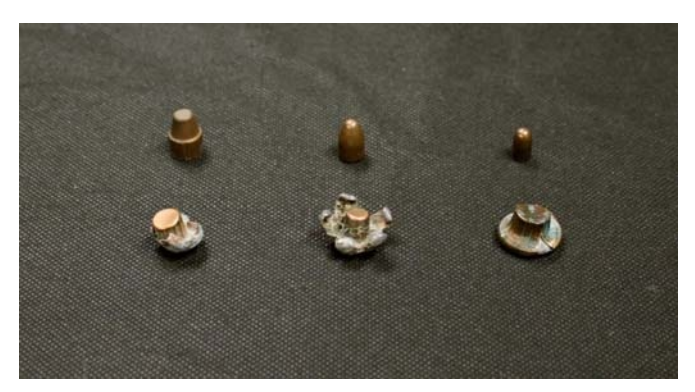
Figure 4. Fully jacketed bullets, on the top row, retain their shape when traversing tissue. Partially jacketed bullets are designed to expand upon entering tissue and thus deliver more of their potential energy to their target.

(density) of the bullet but the on composition of the bullet. The center of the modern bullet is typically made of soft lead because it is cheap, easy to work with, and readily available. The modern-day bullet comes in precise diameters, lengths, mass, shape, and outer jacket, all of these factors help determine the energy and tissue damage imparted to the target (Fig. 3).