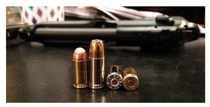
Figure 5. .380 caliber round next to 9-mm hollow point round next to 9-mm round next to .380 round. When compared side to side, the rounds are different, but when comparing them from the back, the diameter of the rounds is similar.

Another important variable of shape is the hollow point bullets designed for handguns (Fig. 5). Handguns are for short range, and thus, the flight characteristics are less important. One of the design intents of hollow point bullets is that the hollow point will result in more deformation of the bullet on impact, and thus, more tissue injury will occur, but the main design characteristic is that the deformed bullet is less likely to pass through the body, minimizing the potential of bystander injury.<sup>26</sup> If the bullet deforms and does not pass through the victim, then the entire kinetic energy of the bullet is imparted