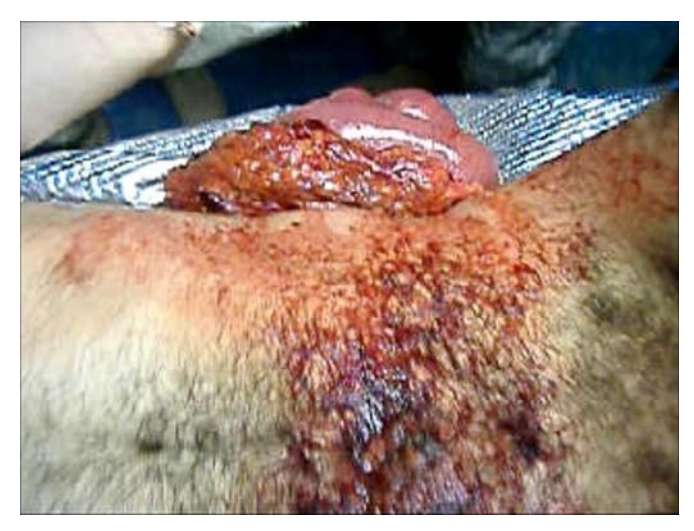
Figure 14 . Evisceration of bowel through 3-cm exit wound on the left side of the abdomen created by high-velocity weapon (AK47), probably caused by cavitation effect.

Stopping power is the ability to wound enough to incapacitate the victim where they stand. This is in contrast to lethality, which is killing power. A lethal gunshot wound may