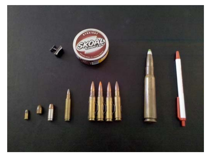
Figure 3. Various sizes of bullets and rounds. Variety of cartridges or rounds, from 0.22 cal handgun round, 9-mm hollow point handgun round, 5.56-mm rifle round, 7.63 rifle rounds, 0.50 cal rifle round, average pen for comparison.

The projectile or bullet is the part of the cartridge that exits the weapon and comes in every imaginable shape and size. Bullets are an important part of the damaging potential of a weapon because they affect the kinetic energy imparted to the target tissue. It depends not only on the size and weight