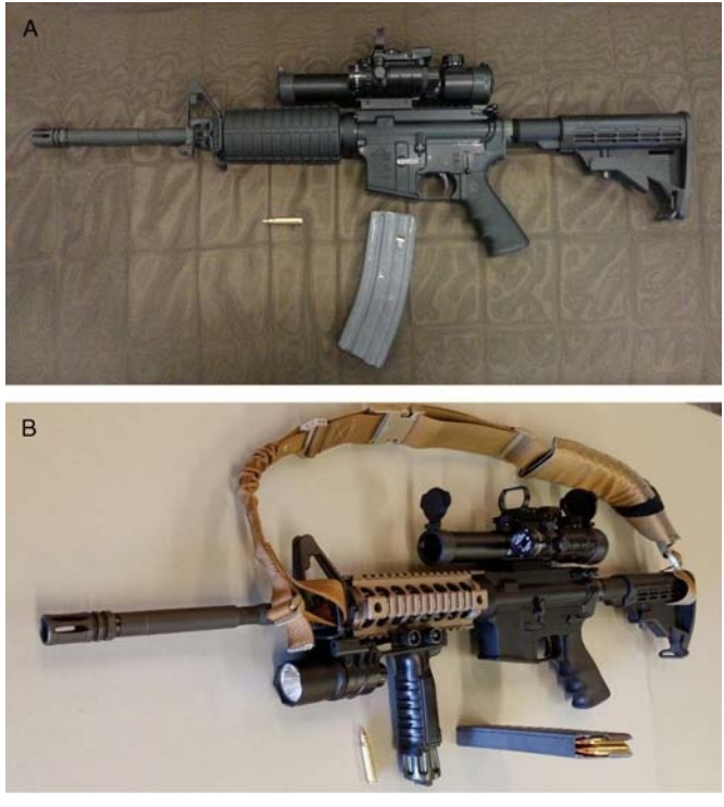
Figure 11. A , Semiautomatic assault rifle with adjustable stock, scope, heads up sighting system, and laser targeting device. B , Same rifle with a different handguard, lighting system, and sling.

Shotguns are a smooth bore long arms that fire a variety of projectiles from small spherical pellets (birdshot) to large spherical pellets (buckshot) to solid lead projectiles (slugs). Shotguns have an external appearance similar to rifles but differ in the lack of rifling inside the barrel. They exist in breach load, pump (rounds are ejected and the weapon rearmed from a magazine with a pump of the forearm mechanism), lever action (works much like a pump shotgun but uses a lever to extract and chamber shells), and semiautomatic varieties. These have a wide caliber range, from 5.5 mm to approximately 2 cm (Fig. 12). Gauge is the caliber of the shotgun. It is determined by the number of lead balls of equal size that make one pound. A 12gauge shotgun is the most popular hunting weapon that has a bore diameter equal to the size of 12-lead balls that add up to one pound. As the gauge of the shotgun increases, the caliber