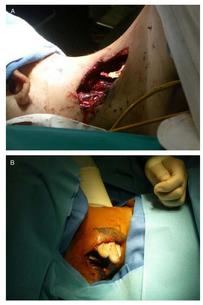
Figure 13. A , Gunshot wound to the posterior neck with large tissue defect. B , Wound with surgeons hand in it.

A bullet with sufficient energy will have a cavitation effect in addition to the penetrating track injury.<sup>35,36</sup> As the bullet passes through the tissue, initially crushing then lacerating, the space left by the tissue forms a cavity, and this is called the permanent cavity . Higher-velocity bullets create a pressure wave that forces the tissues away, creating not only a permanent cavity the size of the caliber of the bullet but also a temporary cavity or secondary cavity, which is often many times larger than the bullet itself (Fig. 13). This temporary cavity depends not only on the energy imparted by the bullet to